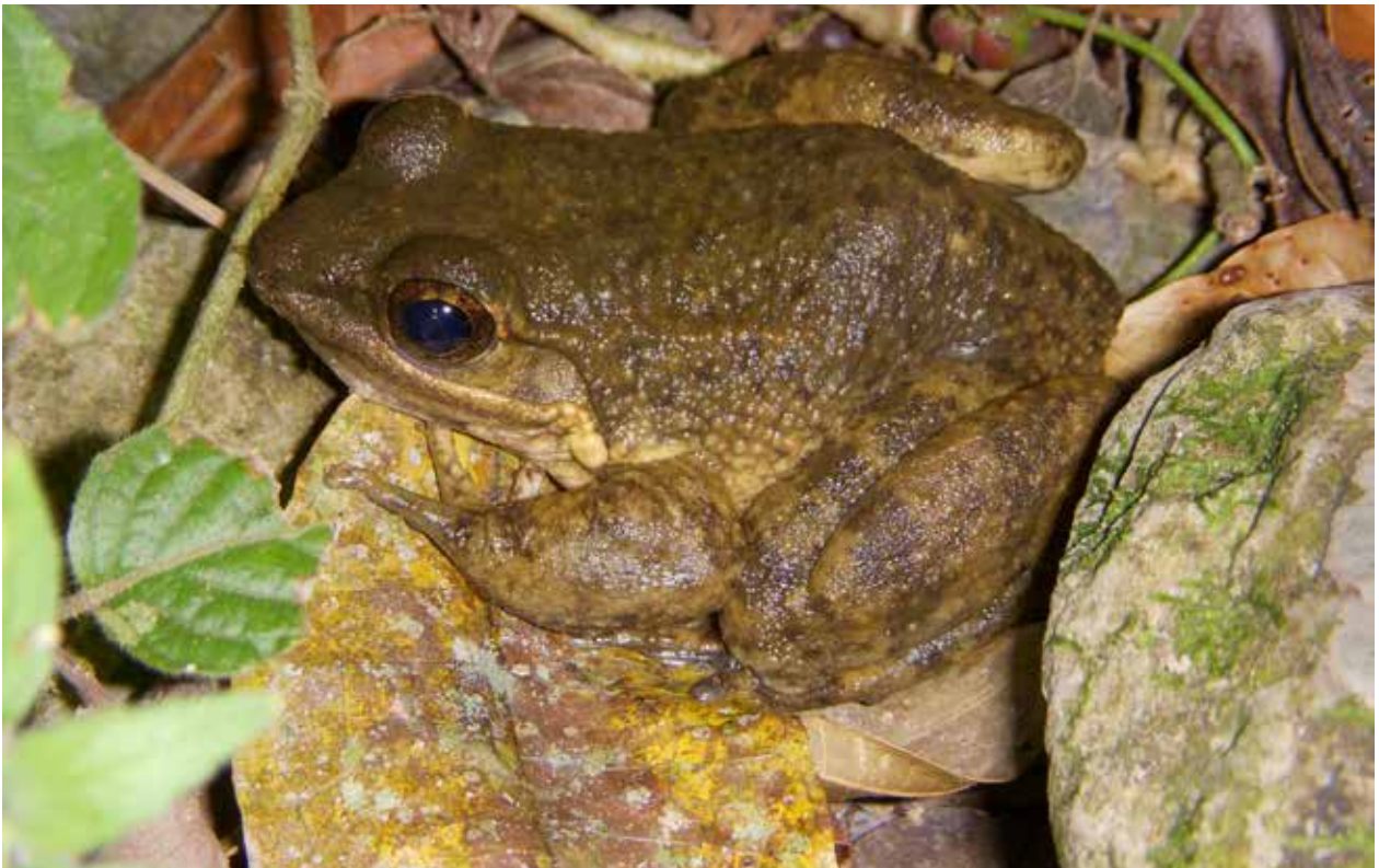
Lithobates johni . Moore's frog is an endemic anuran whose distribution is limited to southeastern San Luis Potosí, eastern Hidalgo, and northern Puebla. Its EVS has been assessed as 14, placing it at the lower end of the high vulnerability category, and its IUCN status as Endangered. This individual came from Río Claro, Municipality of Molango, Hidalgo.