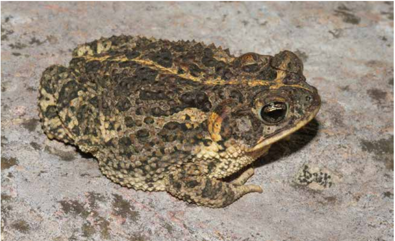
Incilius pisinus . The Michoacán toad, a state endemic, is known only from the Tepalcatepec Depression. This toad's EVS has been assessed as 15, placing it in the lower portion of the high vulnerability category, and its IUCN status as Data Deficient. This individual came from Apatzingán.