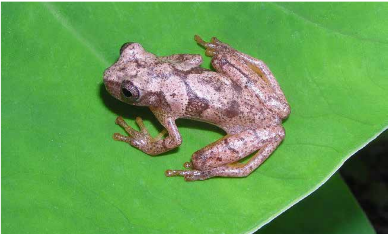
Dendropsophus sartori. The endemic Taylor's yellow treefrog is distributed along the Pacific slopes from Jalisco to Oaxaca. Its EVS has been determined as 14, at the lower end of the high vulnerability category, and its IUCN status as of Least Concern. This individual came from the Municipality of Minatitlán, Colima.