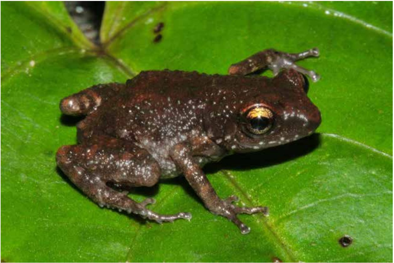
Eleutherodactylus modestus . The endemic blunt-toed chirping frog is known from Colima and southwestern Jalisco. Its EVS has been calculated at 16, placing it in the middle portion of the high vulnerability category, and its IUCN status as Vulnerable. This individual is from the Sierra de Manantlán in Jalisco.