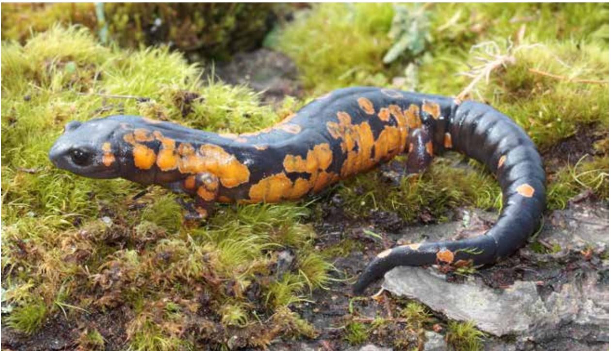
Bolitoglossa franklini. Franklin's salamander is distributed along Pacific slopes from southern Chiapas, Mexico, southeastward to south-central Guatemala. Its EVS has been determined as 14, placing it at the lower end of the high vulnerability category, and its IUCN status as Endangered. This individual came from Cerro Mototal, in the Municipality of Motozintla, Chiapas.