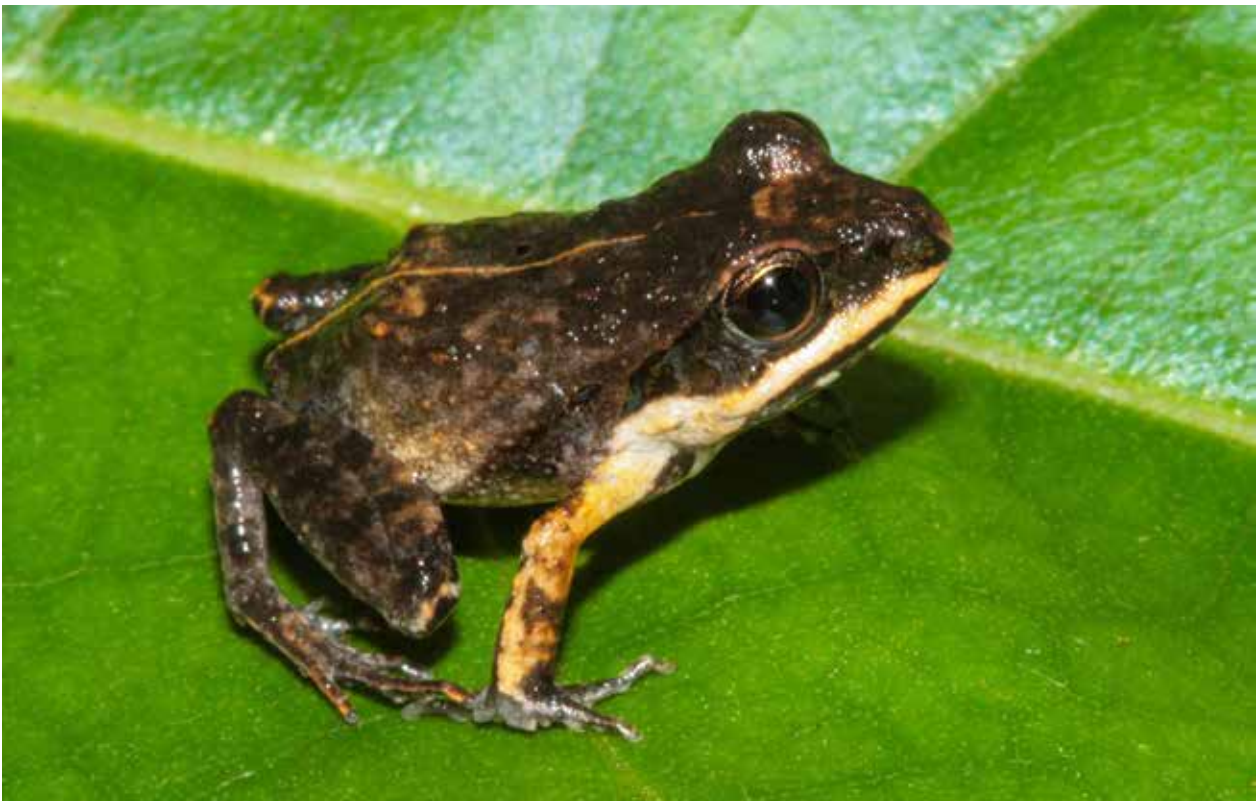
Craugastor hobartsmithi . The distribution of the endemic Smith's pygmy robber frog is along the southwestern portion of the Mexican Plateau, from Nayarit and Jalisco to Michoacán and the state of México. Its EVS has been determined as 15, placing it in the lower portion of the high vulnerability category, and its IUCN status as Endangered. This individual is from the Sierra de Manantlán in Jalisco.