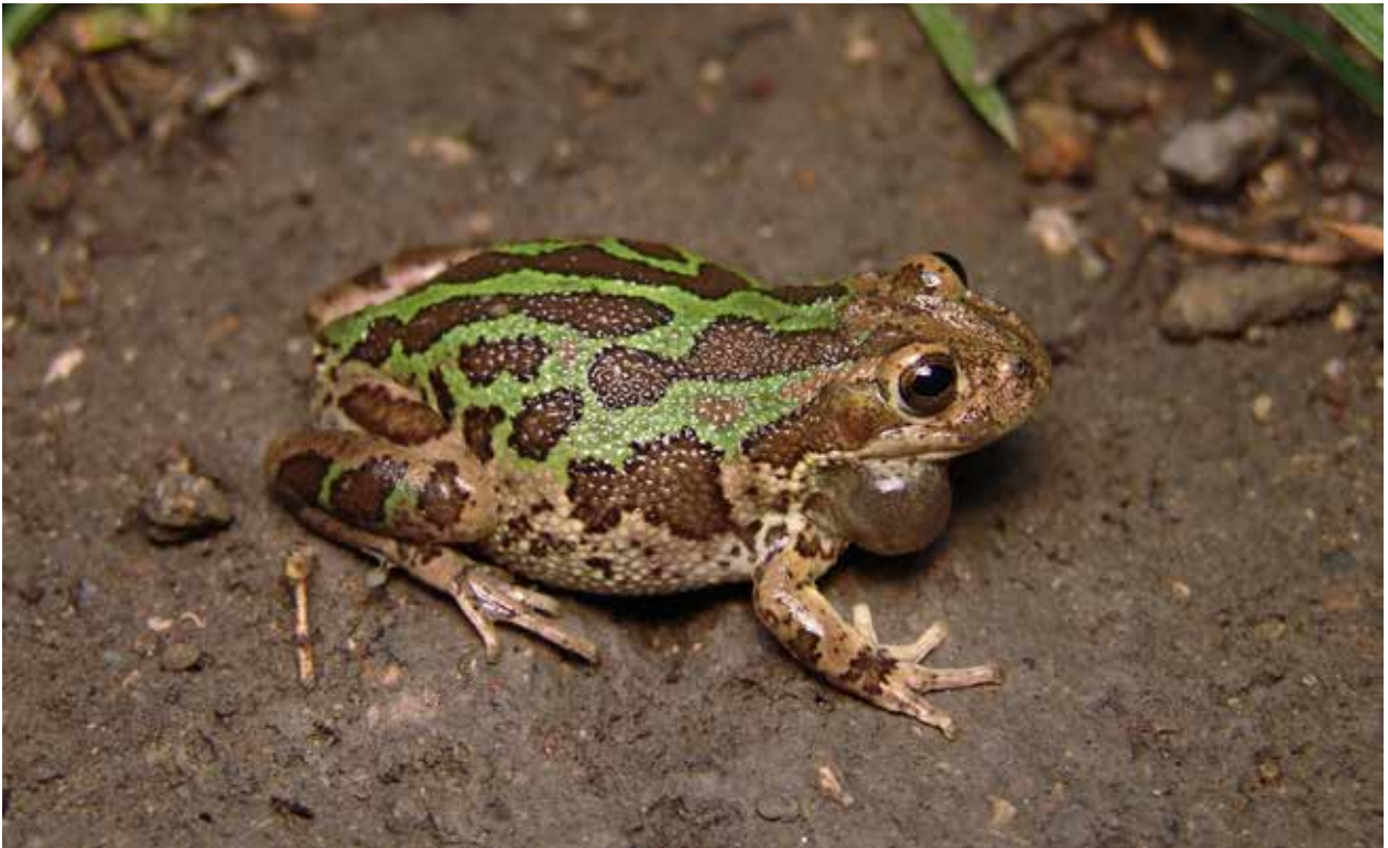
Smilisca dentata . The endemic upland burrowing treefrog occurs only in southwestern Aguascalientes and adjacent northern Jalisco. Its EVS has been assessed as 14, placing it at the lower end of the high vulnerability category, and its IUCN status as Endangered. This individual was found in the Municipality of Ixtlahuacán del Río, Jalisco.