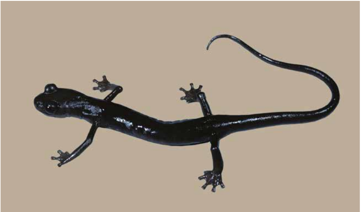
Ixalotriton niger . The black jumping salamander is known only from the immediate vicinity of the type locality in northwestern Chiapas. Its EVS has been calculated as 18, placing it in the upper portion of the high vulnerability category, and its IUCN status as Critically Endangered. This individual came from the type locality and was used as part of the type series in the description of the species by Wake and Johnson (1989). The genus Ixalotriton is endemic to Mexico, and contains one other species ( I. parvus ).