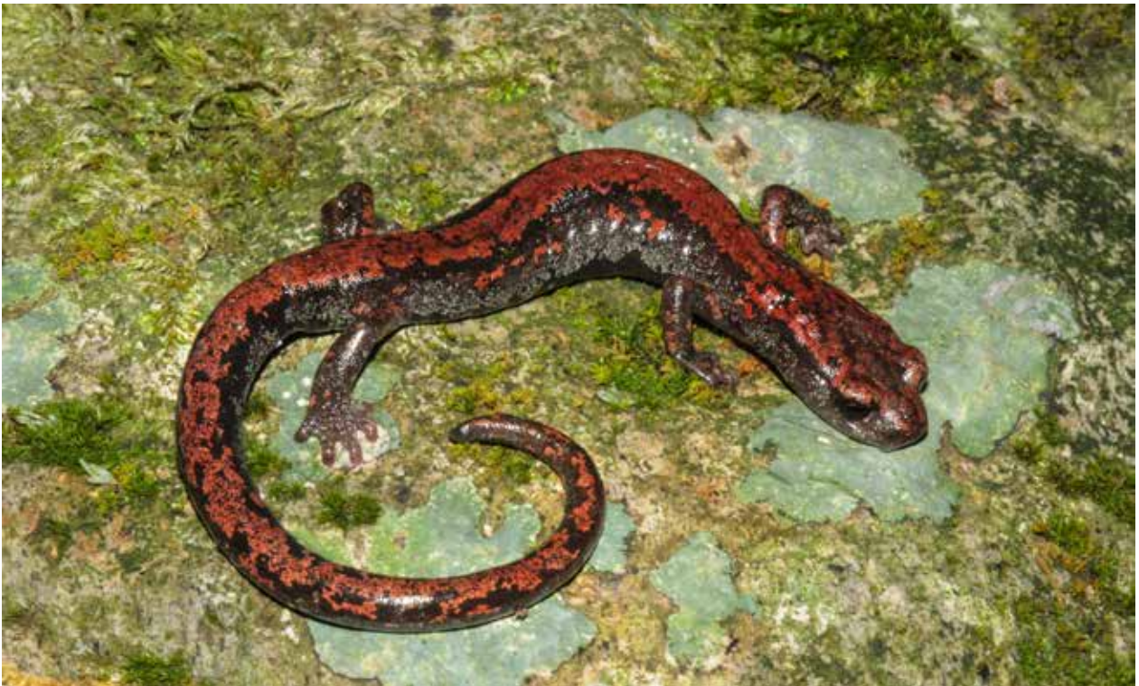
Pseudoeurycea longicauda . The endemic long-tailed false brook salamander is distributed in the Transverse Volcanic Axis of eastern Michoacán and adjacent areas in the state of México. Its EVS has been determined as 17, placing it in the middle of the high vulnerability category, and its IUCN status as Endangered. This individual came from Zitácuaro, Michoacán, near the border with the state of México.