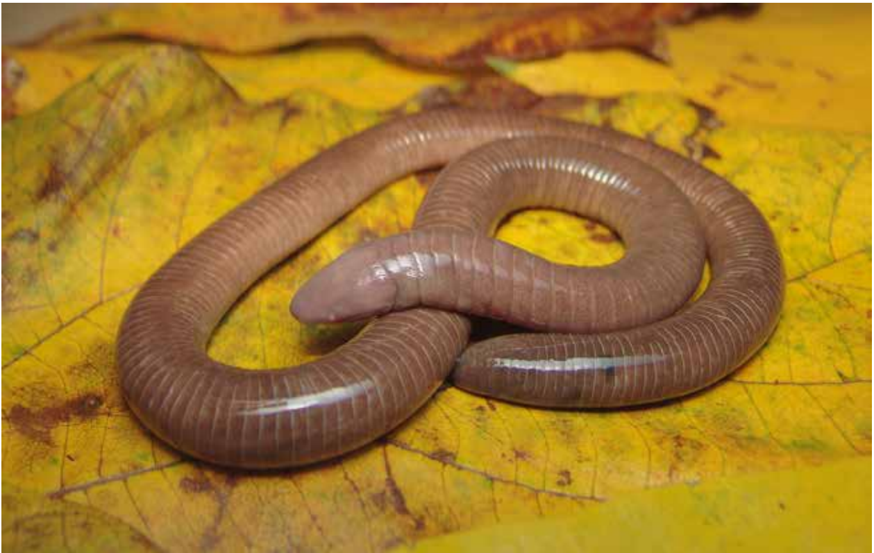
Dermophis oaxacae . The endemic Oaxacan caecilian is distributed in Colima, Jalisco, Michoacán, Guerrero, Oaxaca, and Chiapas. Its EVS has been calculated as 12, placing it in the middle portion of the medium vulnerability category, and its IUCN status as Data Deficient. This individual was found on the road at Ixtlahuacán, Colima.

species assessed as DD with those occupying the threat categories (CR, EN, and VU) to arrive at a total of 249 species (65.9% of the total amphibian fauna). The EVS range for these DD species (12–18) falls within that for the threat species as a whole (7–19) and the mean for all the four categories becomes 15.1, the same as that for the EN species alone. So, if the DD species can be considered “threat species in disguise,” then close to two-thirds of the Mexican amphibian species would be considered under the threat of extinction.