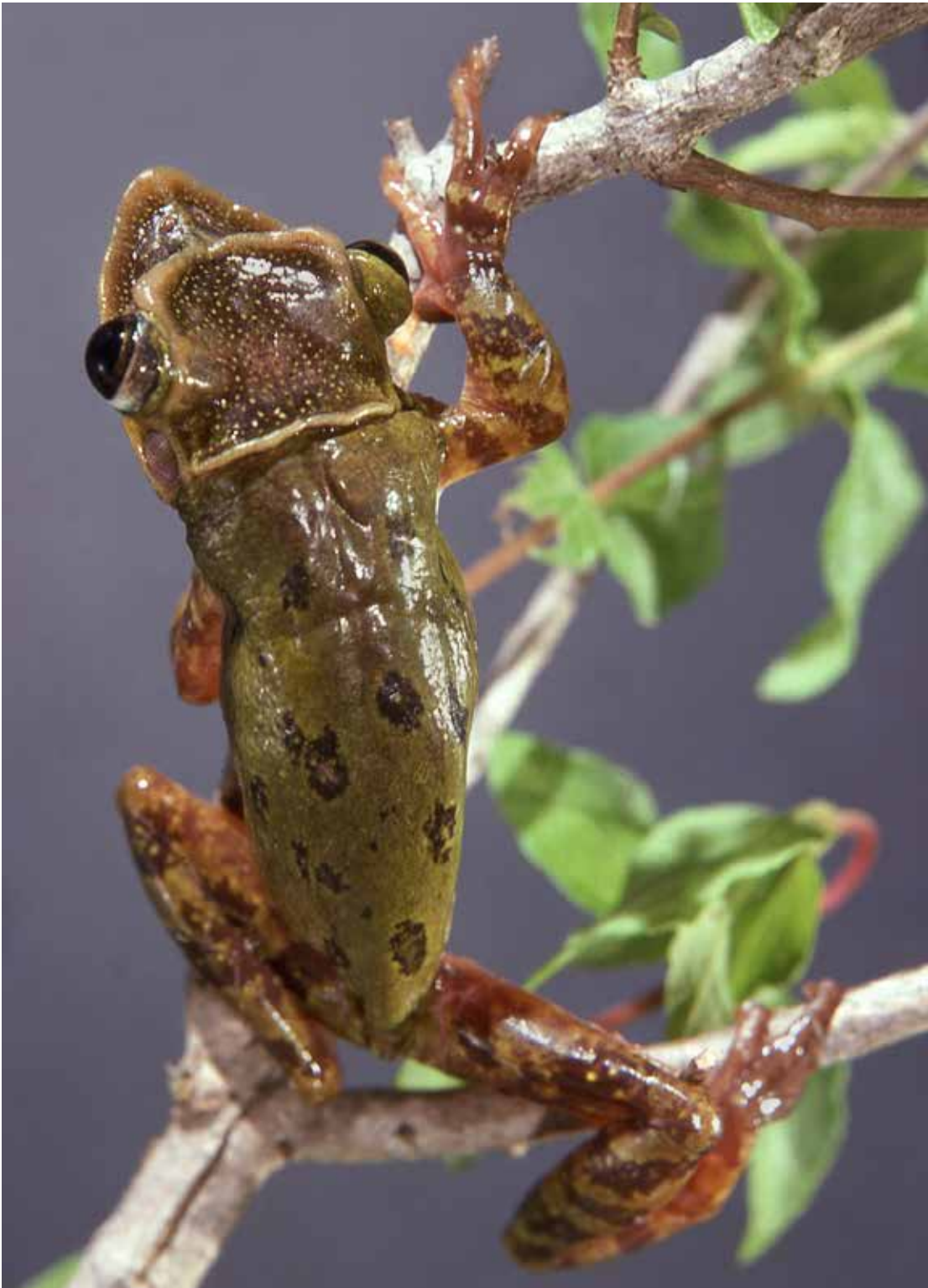
Tripion petasatus . The Yucatecan casque-headed treefrog is restricted primarily to the Yucatan Peninsula, occurring in the Mexican states of Yucatán, Campeche, and Quintana Roo, as well as in northern Guatemala and northern Belize. A disjunct population also has been recorded from Santa Elena, Departamento de Cortés, Honduras. Its EVS has been calculated as 10, placing it at the lower end of the medium vulnerability category, and its IUCN status is of Least Concern. Although this treefrog is broadly distributed in the Yucatan Peninsula, it usually is found only during the rainy season when males and females congregate around restricted bodies of water (solution pits, cenotes, and ephemeral ponds) on this flat limestone platform. During the dry season, these frogs retreat into tree holes and rock crevices, and sometimes use their head to plug the opening. This individual is from the state of Yucatán.