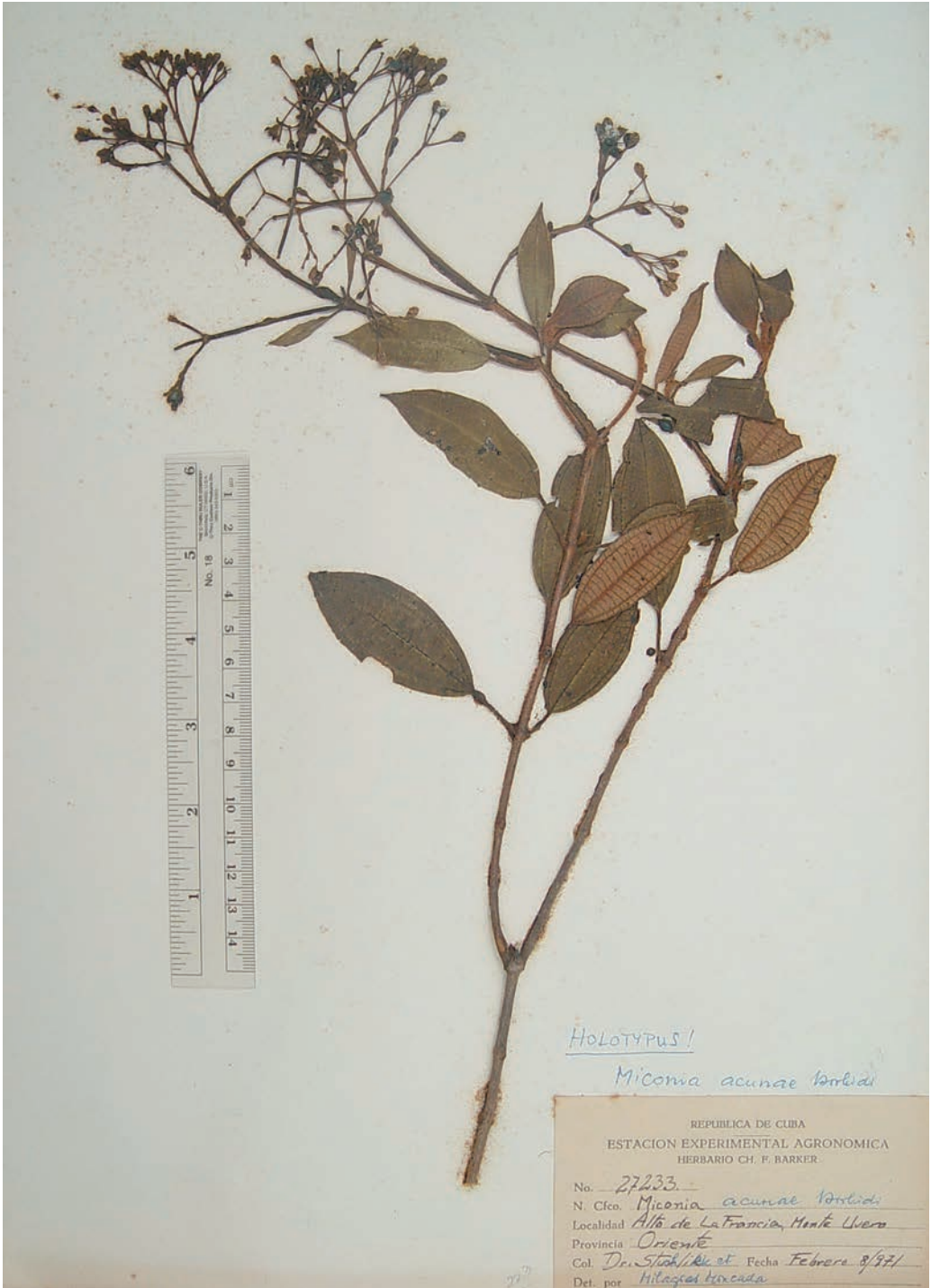
FIG. 2. Holotype of Miconia acunae (at HAC); note large inflorescence and rather small leaves, each with four secondary veins (two inconspicuous and intramarginal) and a cuneate or rounded base.