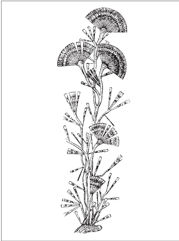
Bacillariophyta (Diatoms). After Mangin 1908.

ambiguity as to which was the case); none of these records included information on habitat and distribution and no reference was made to vouchers. Short of tracking down everything that could qualify as old literature and deducing from this which were new records, there is no way to verify the sources. With the lack of habitat and distributional information in that aforementioned major Gulf of Mexico summary, and our concern regarding possible overvaluation of reports from the Gulf of Mexico that should themselves require better documentation in years to come, we elected to not treat habitats and distributions to the same extent as in other chapters of this volume. Although a modern species nomenclator for the Bacillariophyta does exist, namely the Catalogue of the Fossil and Recent Genera and Species of Diatoms and their Synonyms (Van Landingham 1967, 1968, 1971, 1975, 1978a, 1978b, 1979), online sources such as Index Nominum Algarum (Silva 2006), AlgaeBase (Guiry and Guiry 2007), and the California Academy of Sciences Diatom Names (Fourtanier and Kociolek 2006) provide additional information on the diversity of this group. Therefore, these online sources are being used to confirm reported species as distinct.