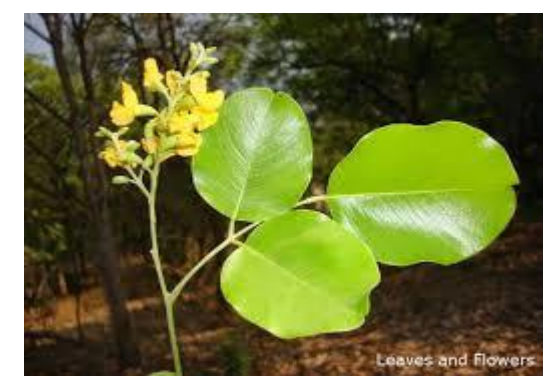
P. Santalinus- Flowers