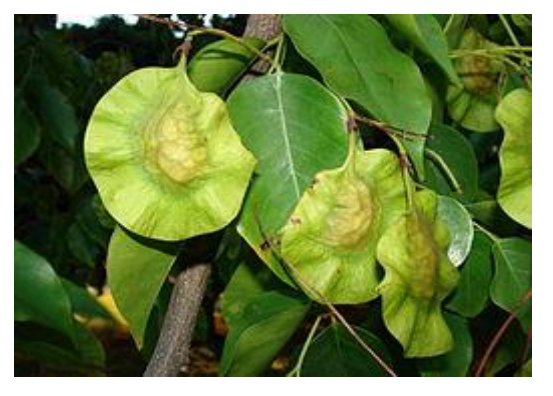
P. Santalinus- Seeds