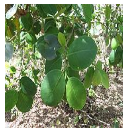
P. Santalinus- Leaves