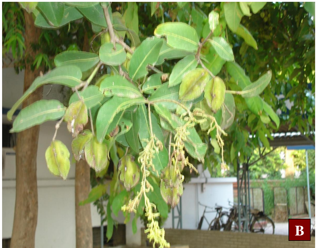
Fig. 19. Terminalia arjuna (Roxb. ex DC.) Wight & Arn.