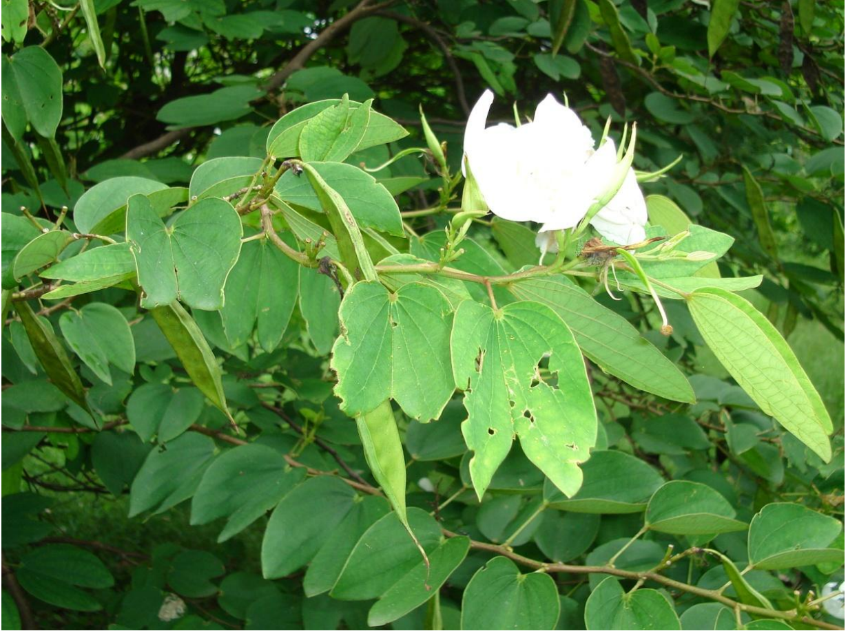
Fig. 14. Bauhinia purpurea L.