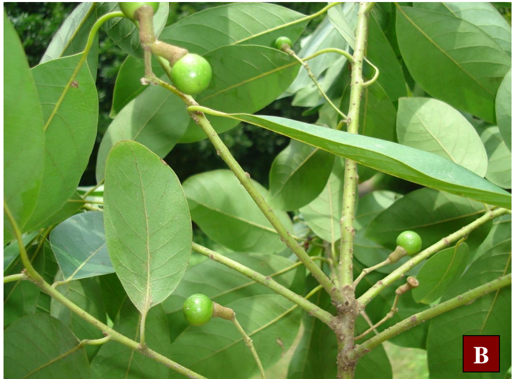
Fig. 25. Litsea glutinosa (Lour.) Rob.