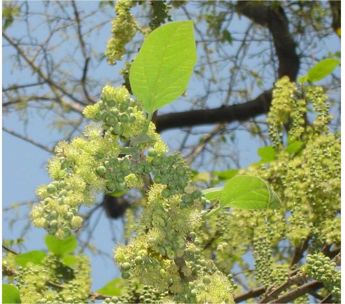
Fig. 22. Mallotus nudiflorus (L.) Kulju & Welzen