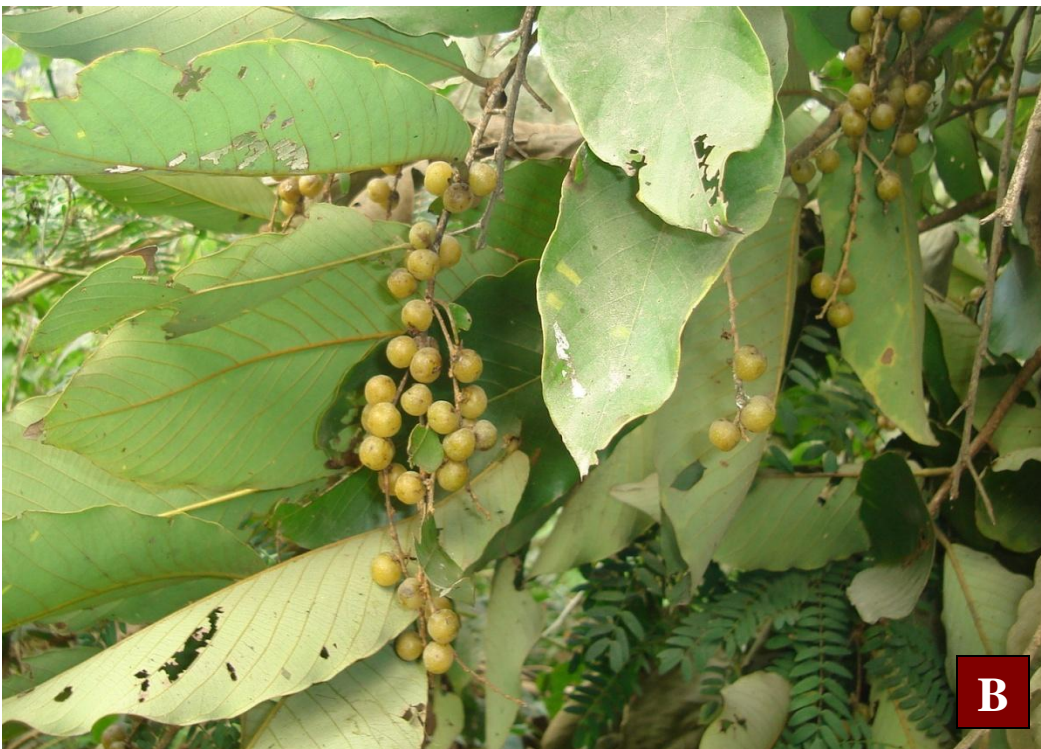
Fig. 21. Bridelia retusa (L.) Juss.