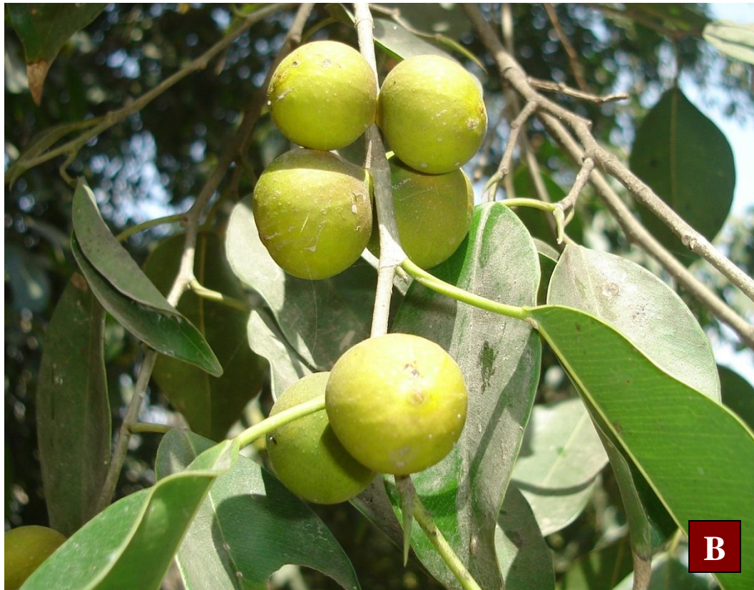
Fig. 34. Ficus benjamina var. nuda (Miq.) Barrett