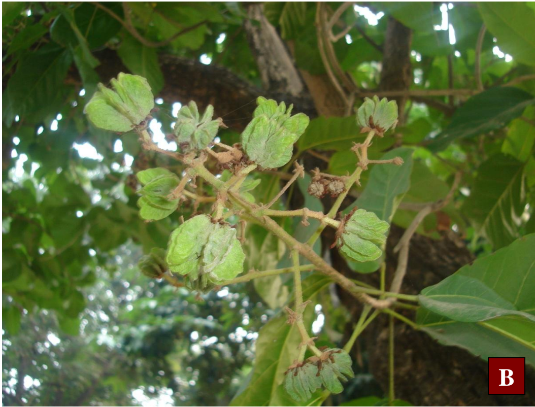
Fig. 49. Berrya cordifolia (Willd.) Burret