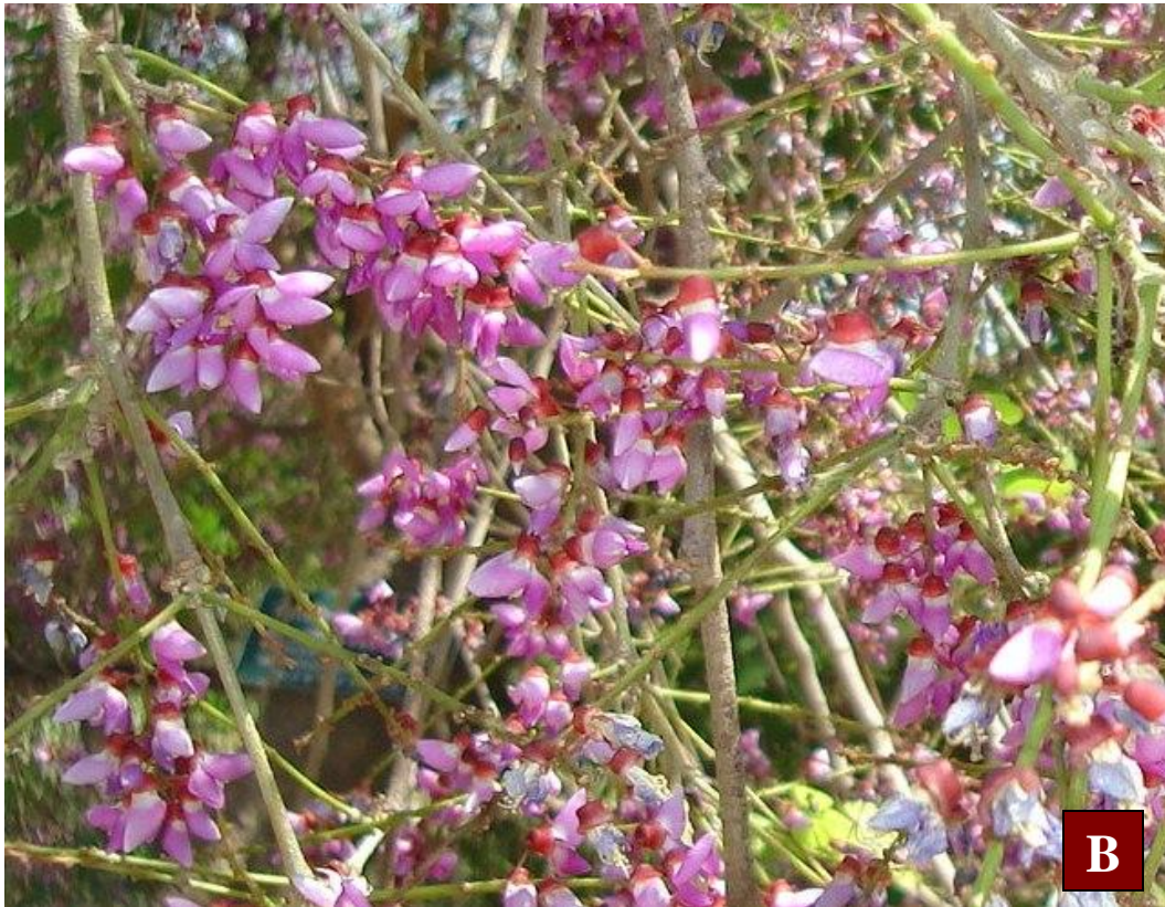
Fig. 24. Millettia peguensis Ali