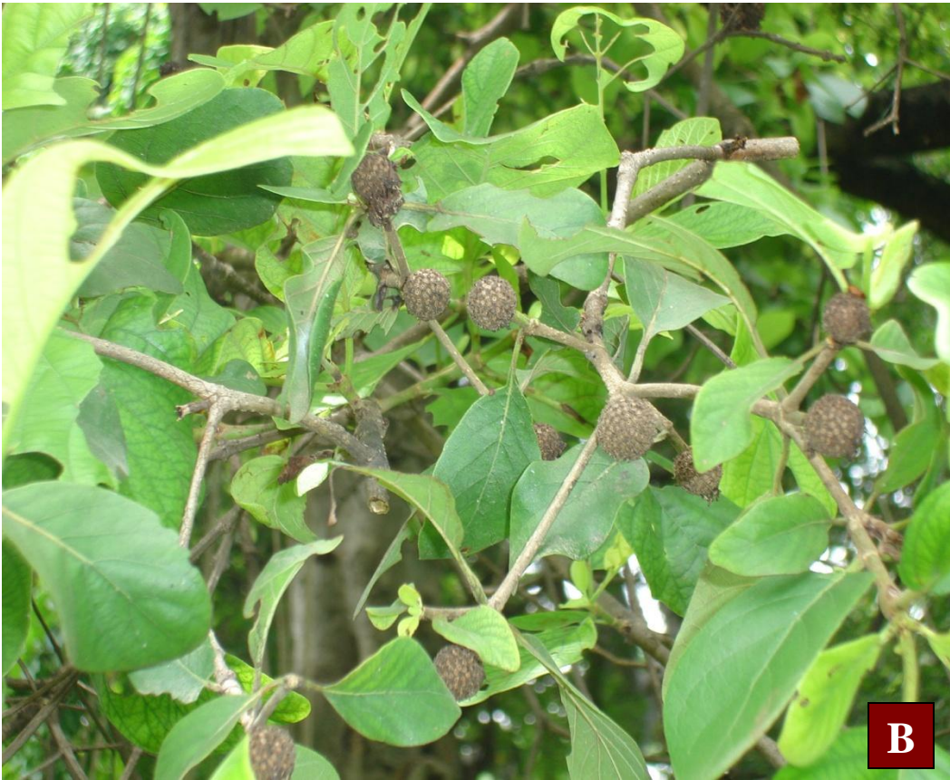
Fig. 42. Mitragyna parvifolia (Roxb.) Korth.