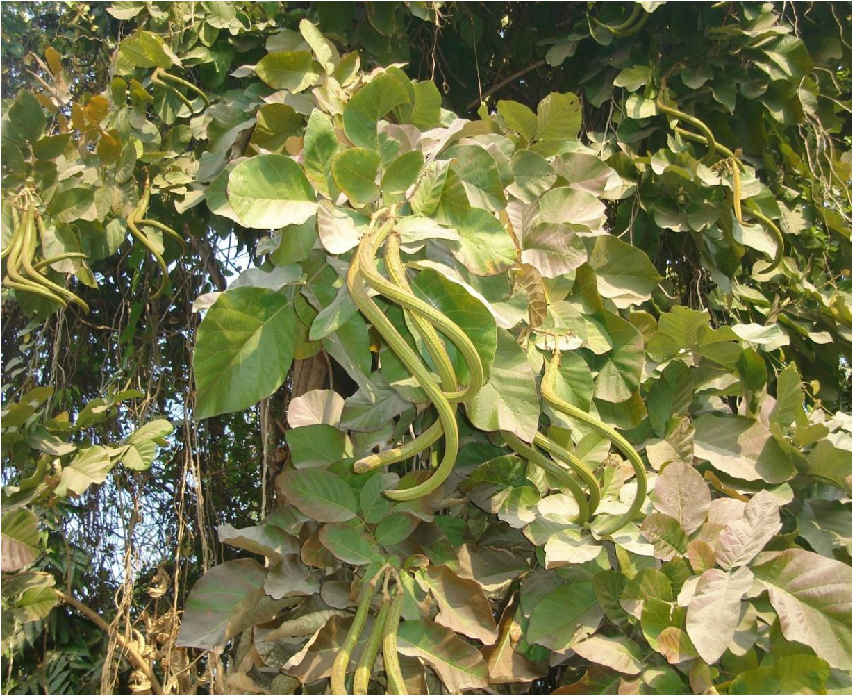
Fig. 9. Haplophragma adenophyllum (Wall. ex G. Don) Dop.