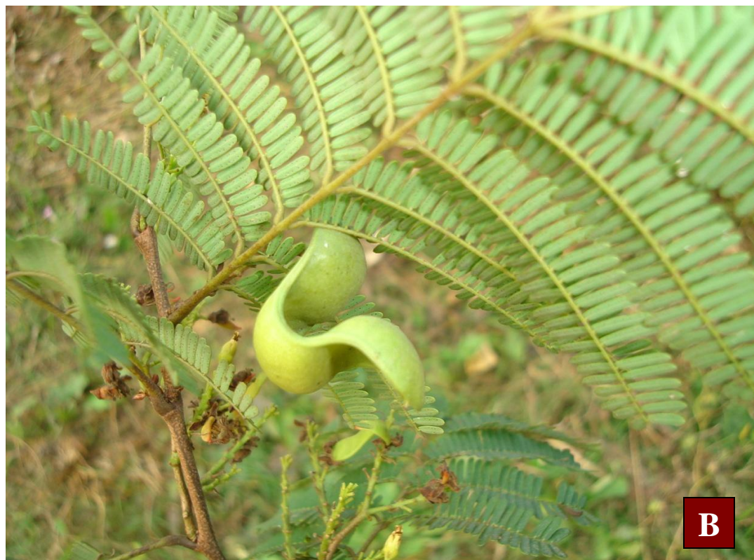
Fig. 16. Caesalpinia coriaria (Jacq.) Willd.