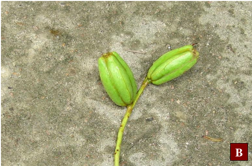
Fig. 7. Barringtonia acutangula (L.) Gaertn.