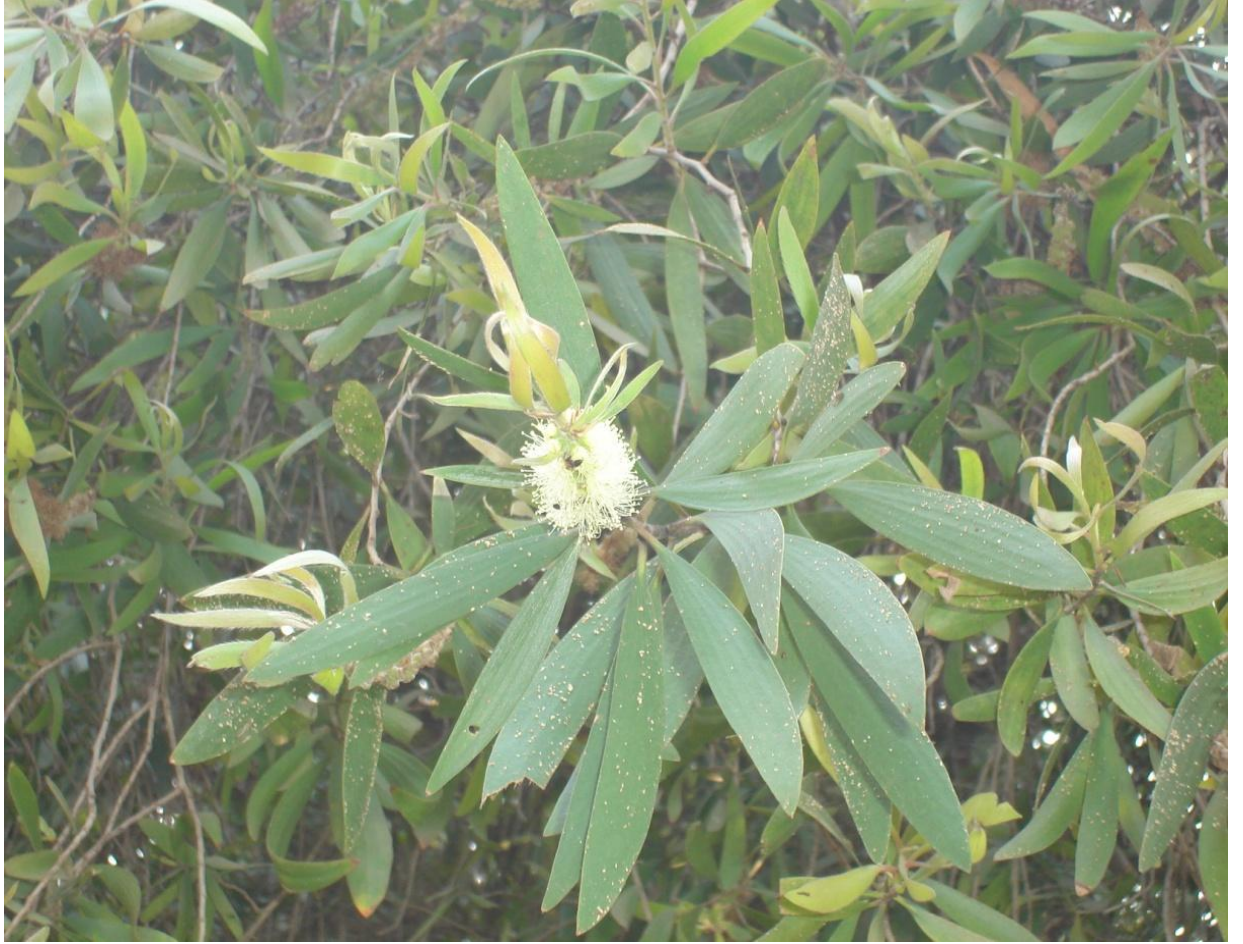
Fig. 39. Melaleuca leucadendra (L.) L.