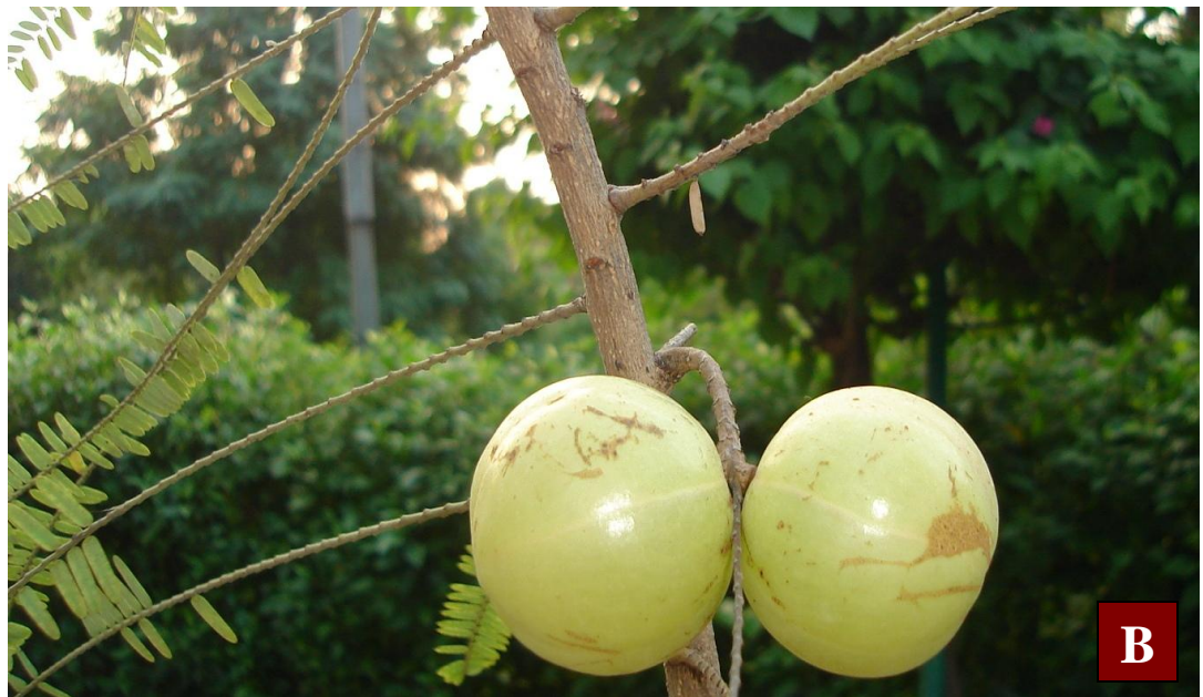
Fig. 23. Phyllanthus emblica L.