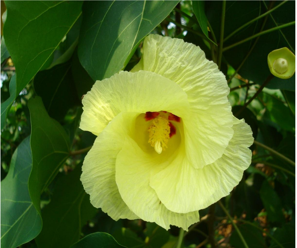
Fig. 29. Thespesia populnea (L) Sol. ex Correa