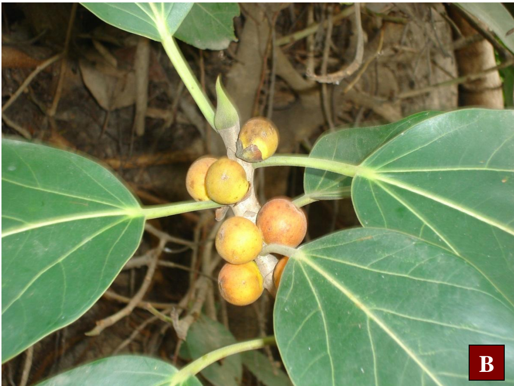
Fig. 33. Ficus benghalensis L.