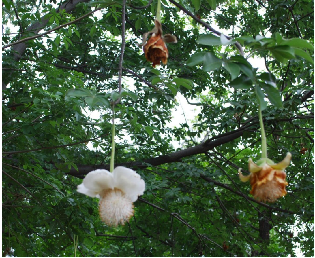
Fig. 12. Adansonia digitata L.