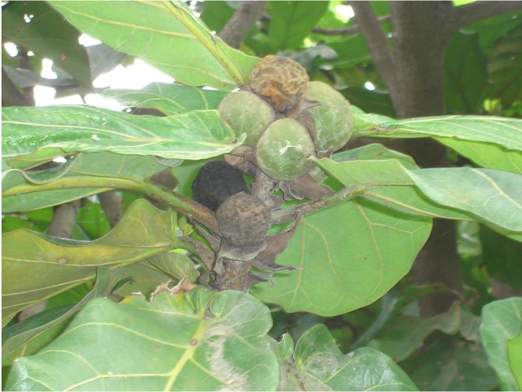
Fig. 35. Ficus lyrata Warb.