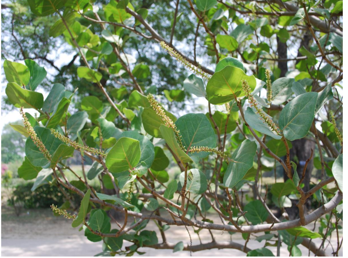
Fig. 40. Cocoloba uvifera (L.) L.