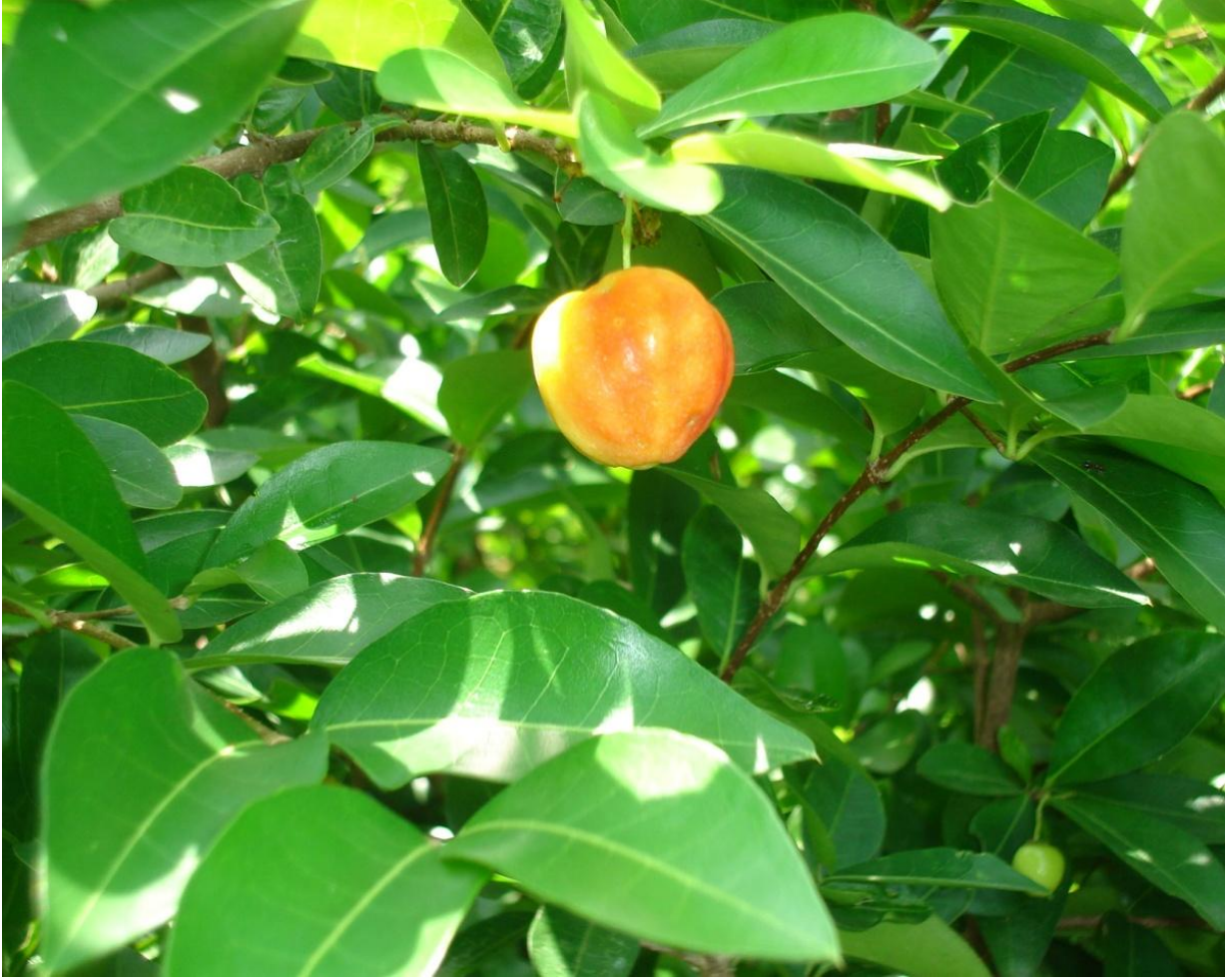
Fig. 41. Prunus avium (L.) L.