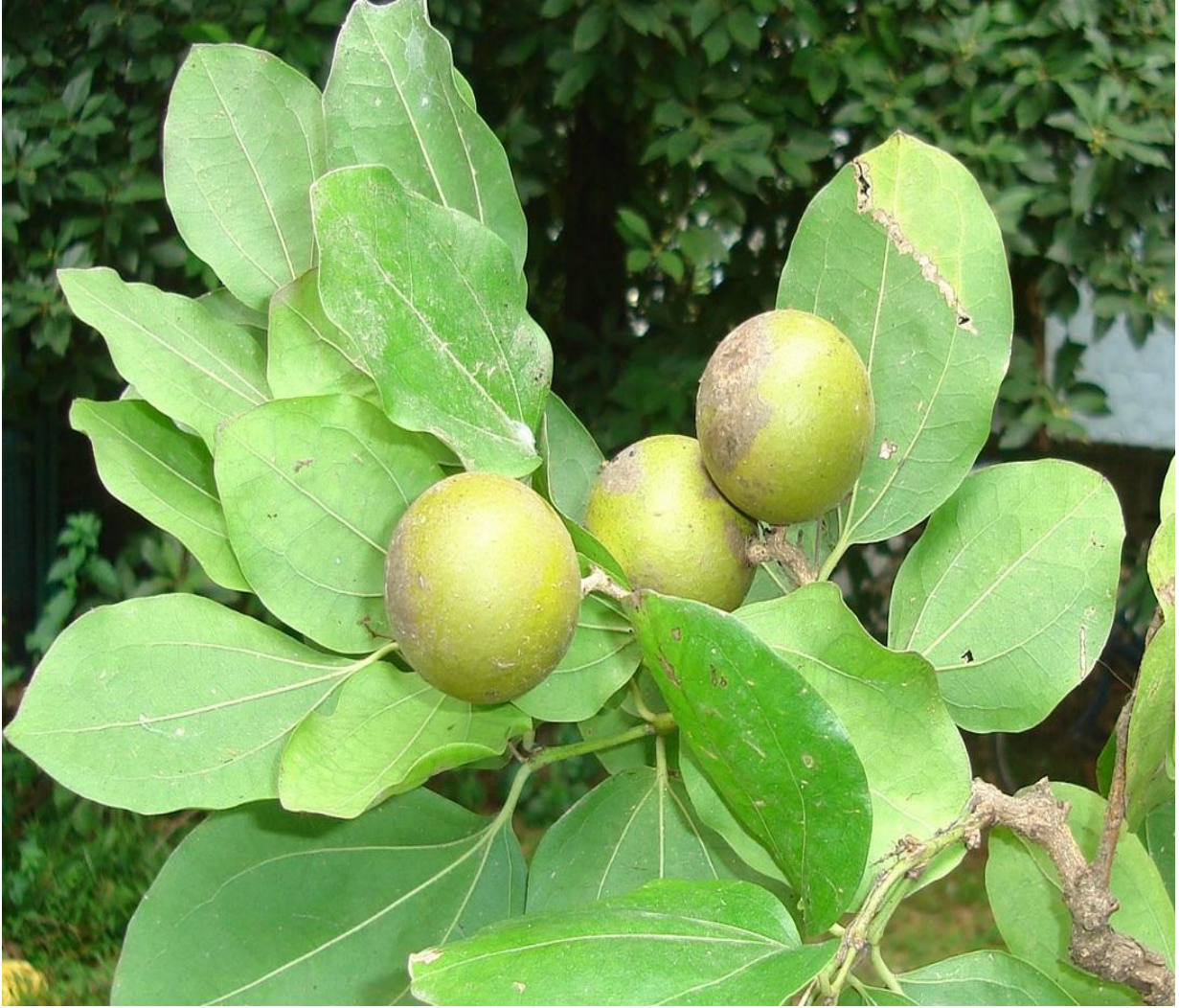
Fig. 48. Strychnos nux – vomica L.