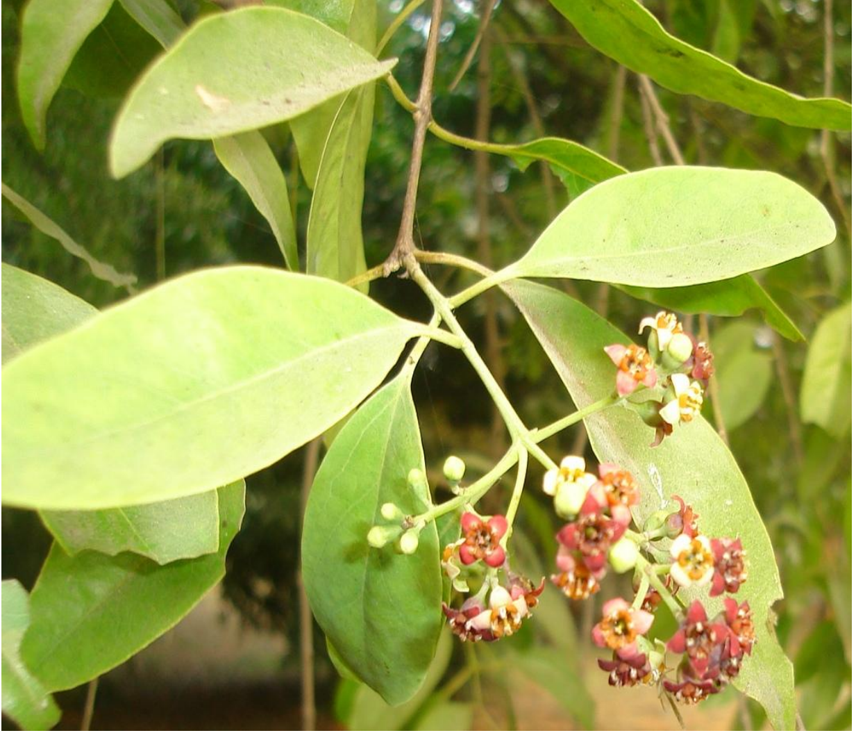
Fig. 43. Santalum album L.