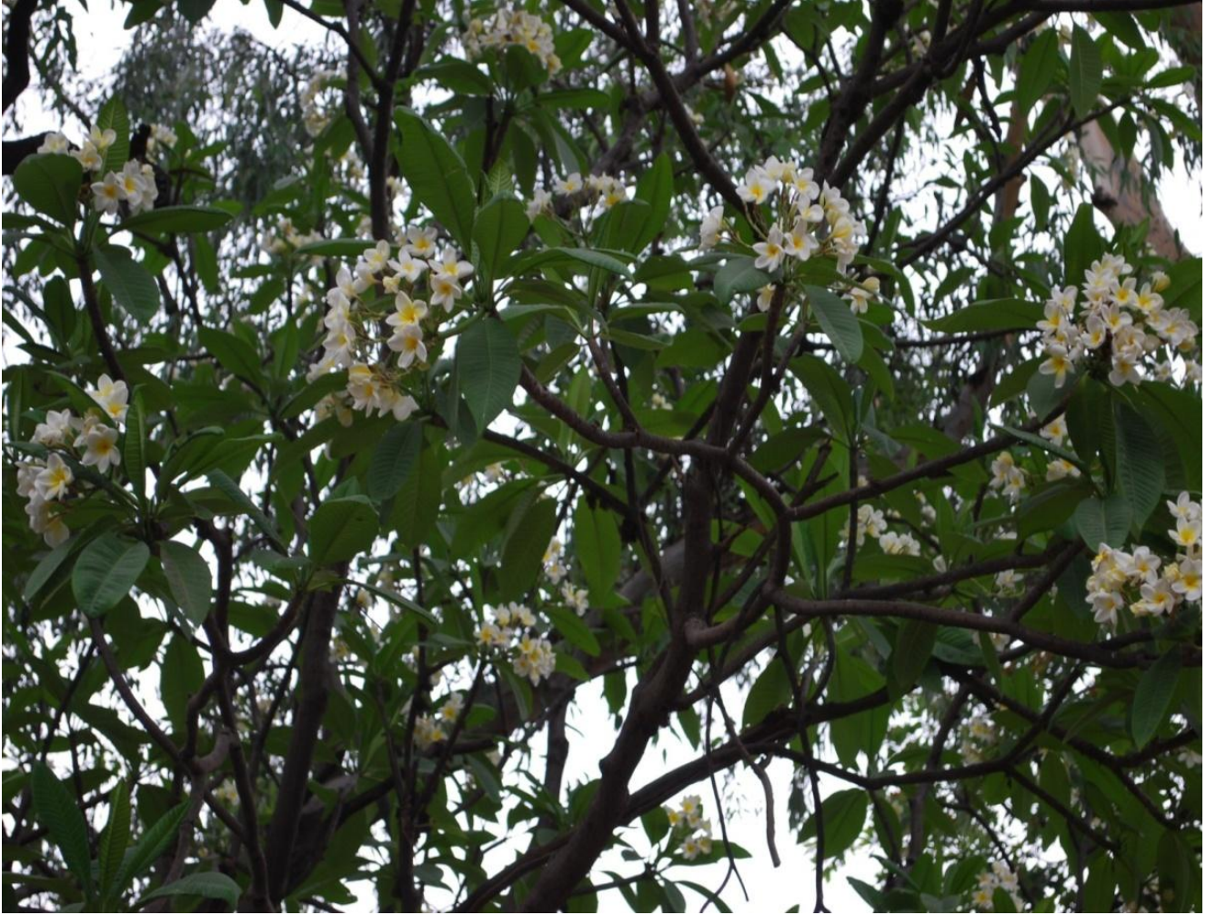
Fig. 3. Plumeria rubra L.