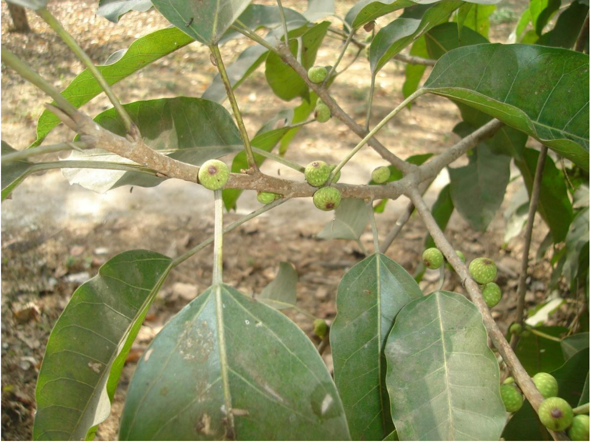
Fig. 36. Ficus virens Aiton