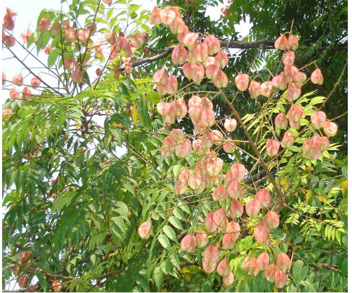
Fig. 45. Koelreuteria paniculata Laxm.