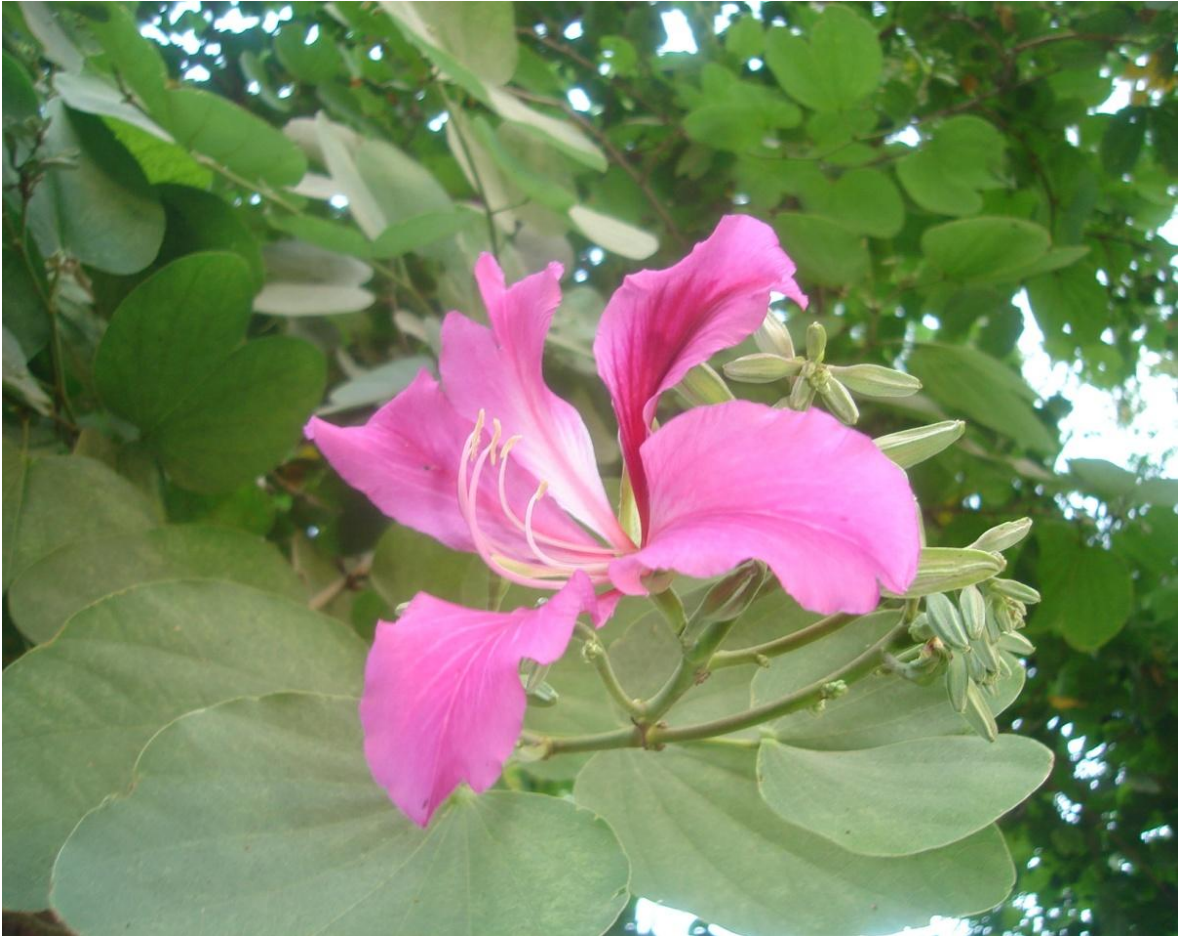
Fig. 15. Bauhinia x blakeana Dunn.