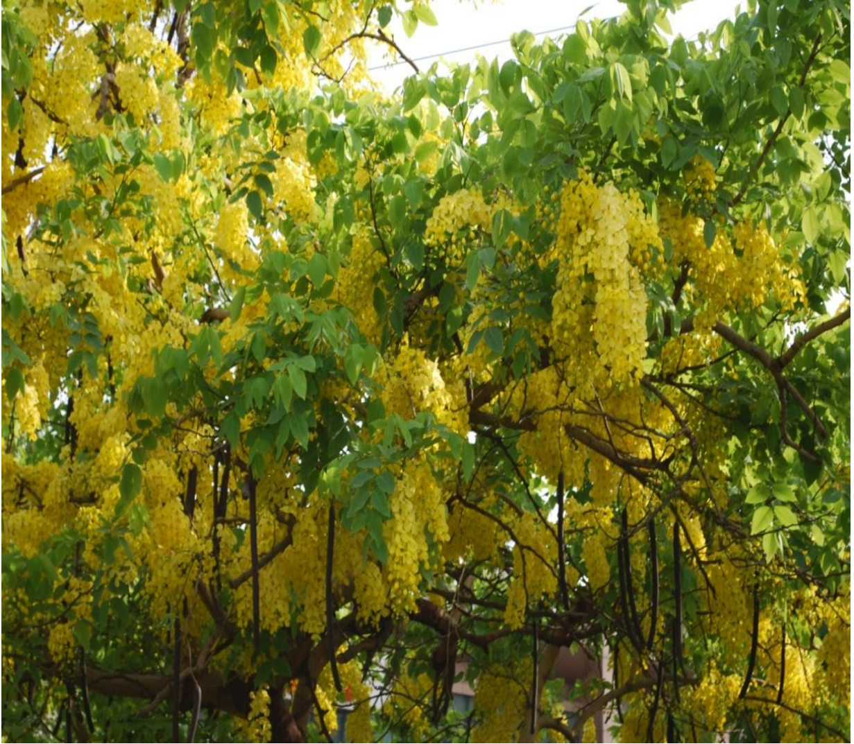
Fig. 17. Cassia fistula L.