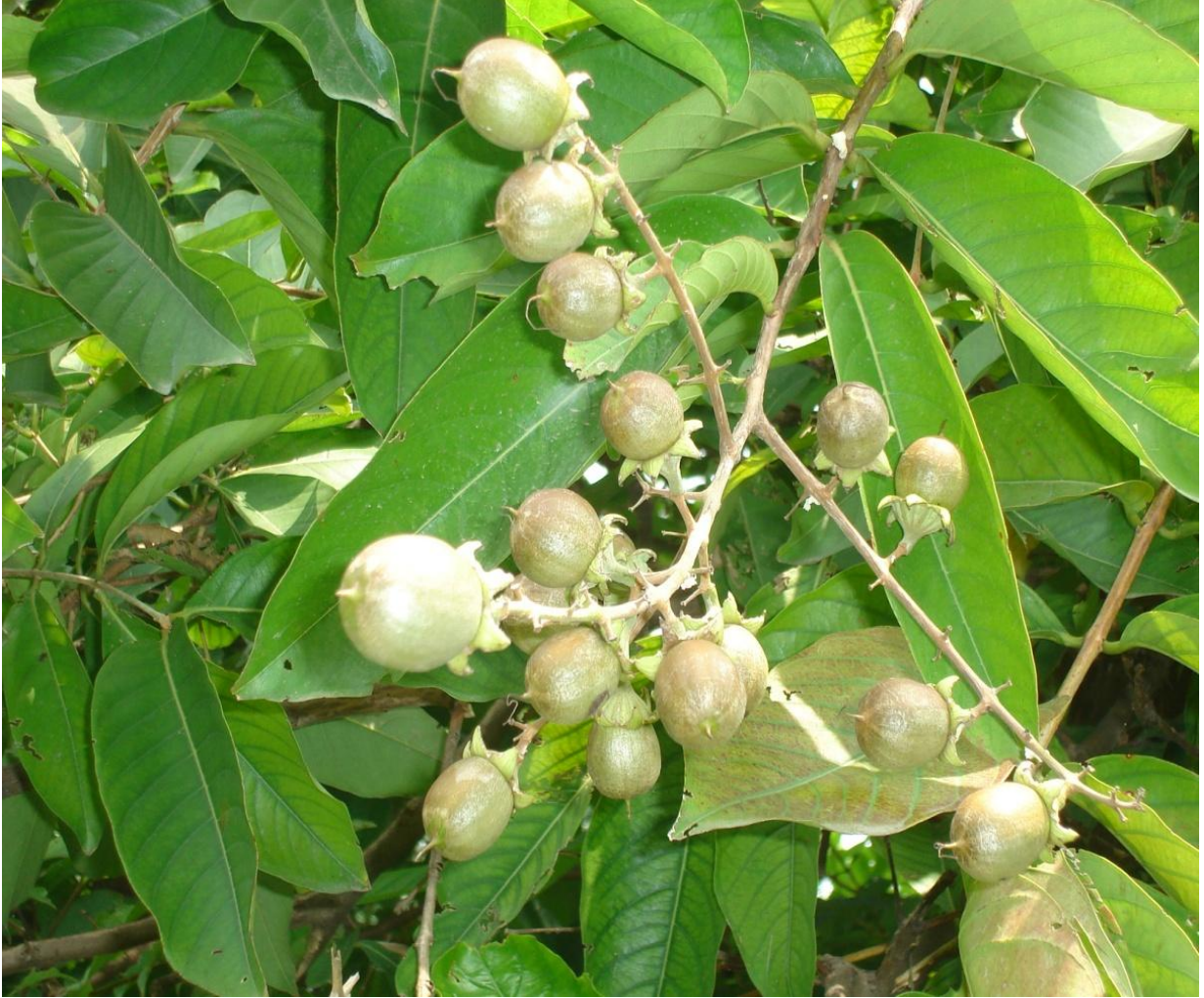
Fig. 26. Lagerstroemia speciosa (L.) Pers.