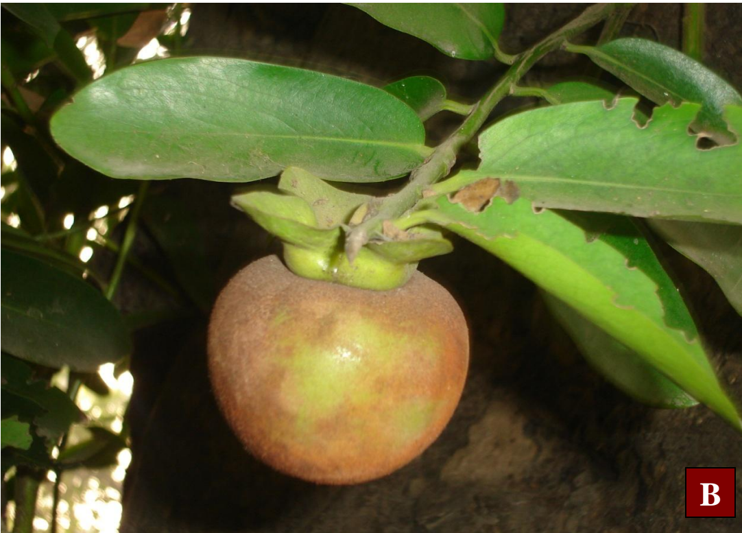
Fig. 20. Diospyros peregrina (Gaertn.) Gurke