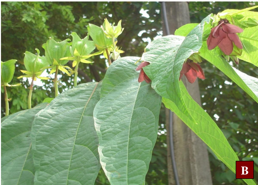
Fig. 27. Abroma angusta (L.) L.f.