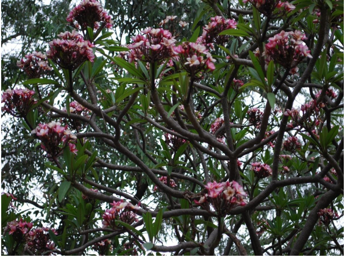
Fig. 4. Plumeria rubra f. tricolor (Ruiz & Pav.) Wood.