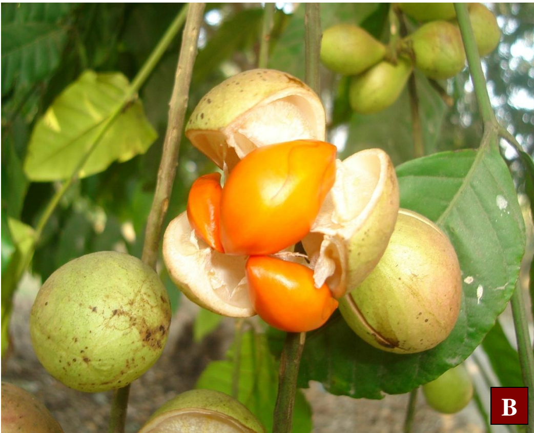
Fig. 30. Aphanamixis polystachya (Wall.) Parker