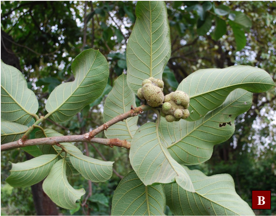
Fig. 32. Artocarpus lacucha Buch.-Ham.