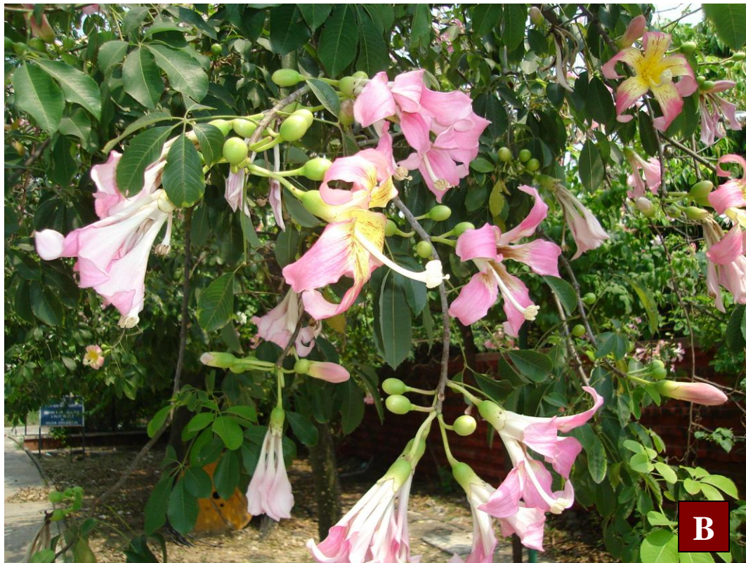
Fig. 13. Ceiba insignis (Kunth) Gibbs. & Semir