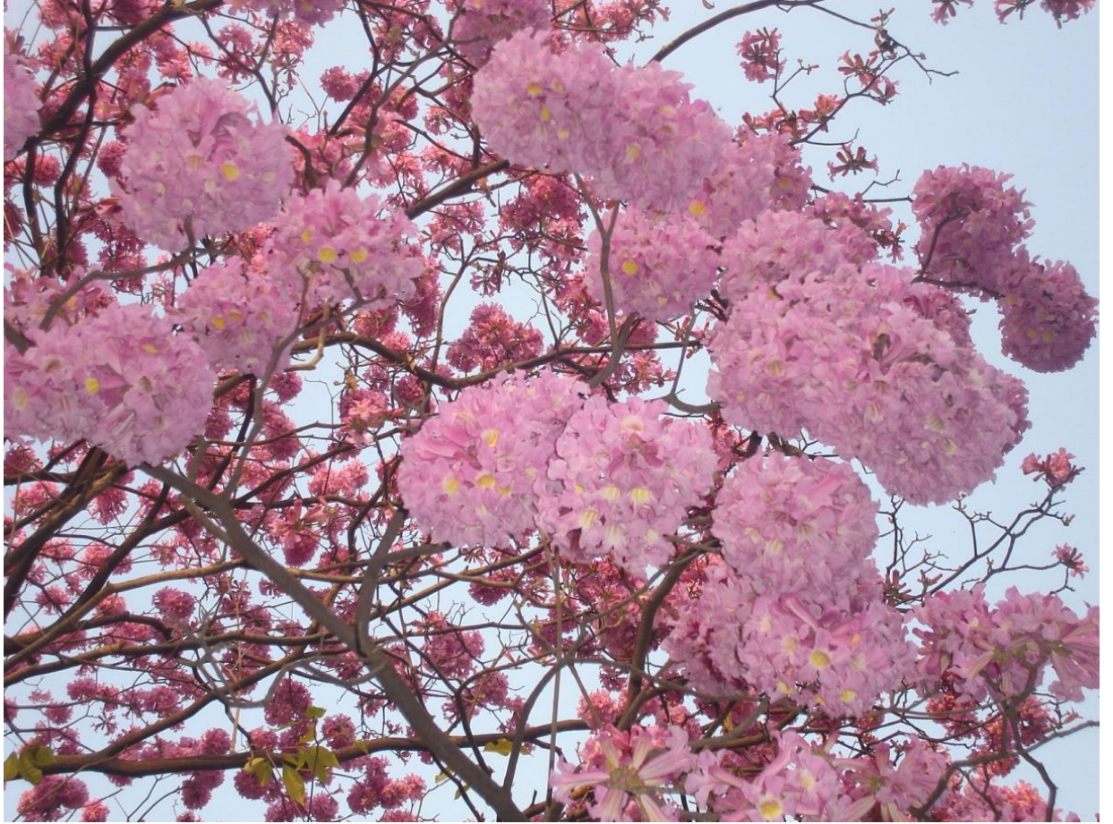
Fig. 8. Handroanthus impetiginosus (Mart. ex Dc.) Mattos