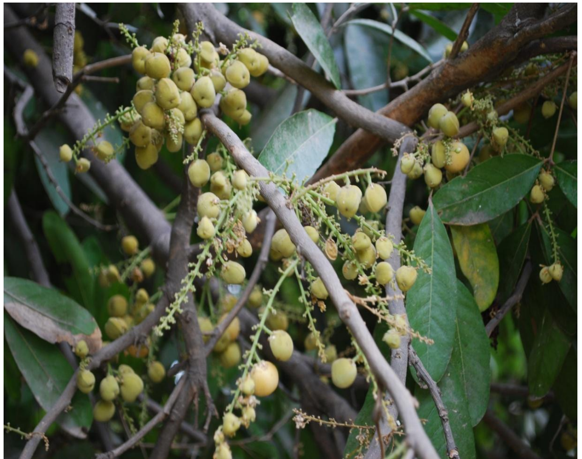
Fig. 46. Lepisanthes tetraphylla (Vahl.) Radlk.