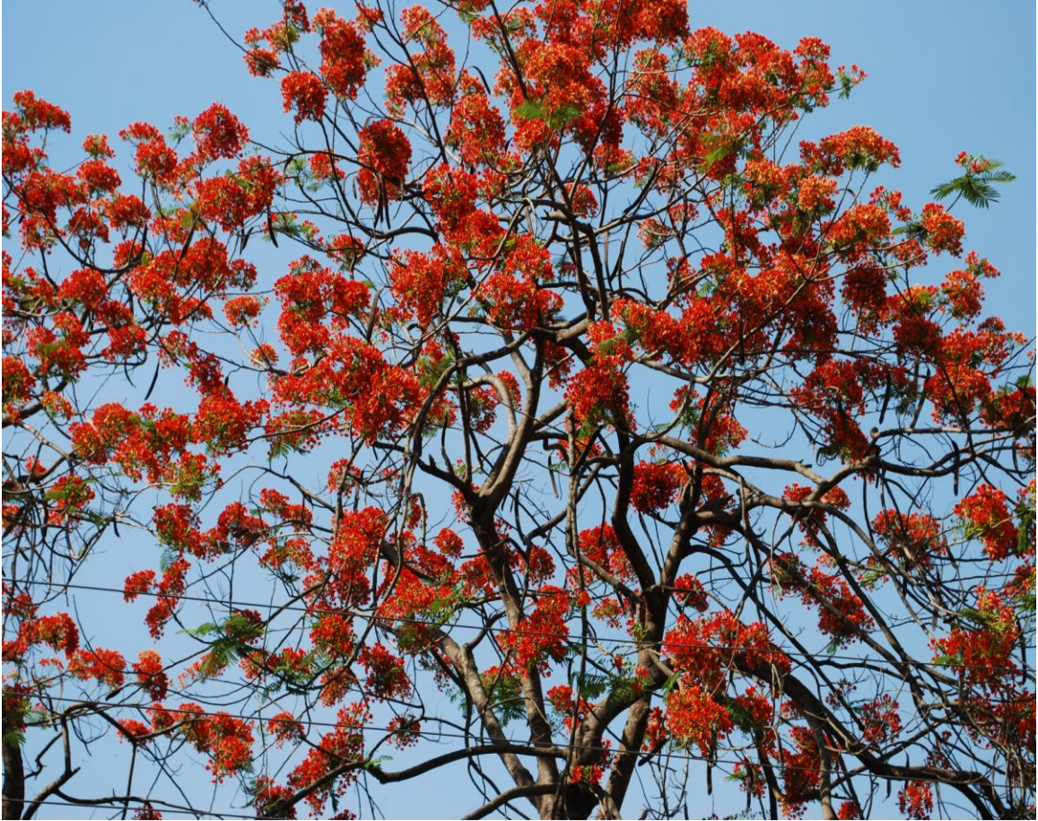
Fig. 18. Delonix regia (Bojer ex Hook.) Raf.