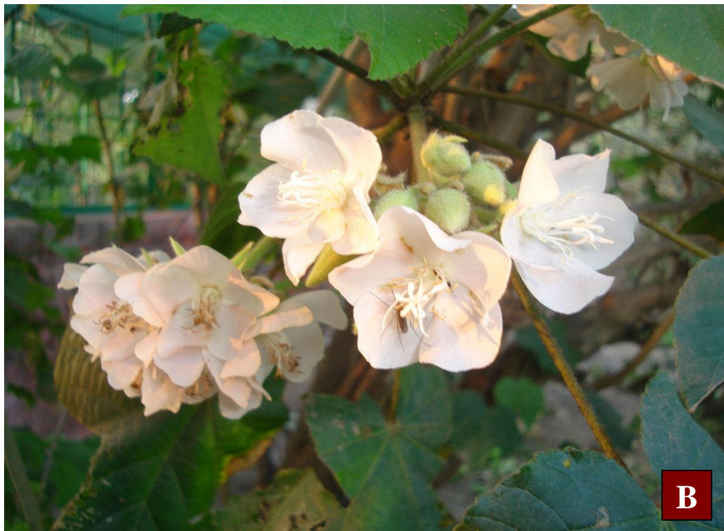
Fig. 28. Dombeya burgesiae Gerrard ex Harv.