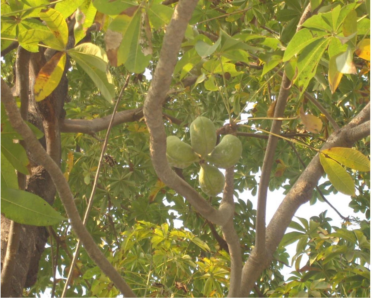
Fig. 47. Sterculia foetida L.