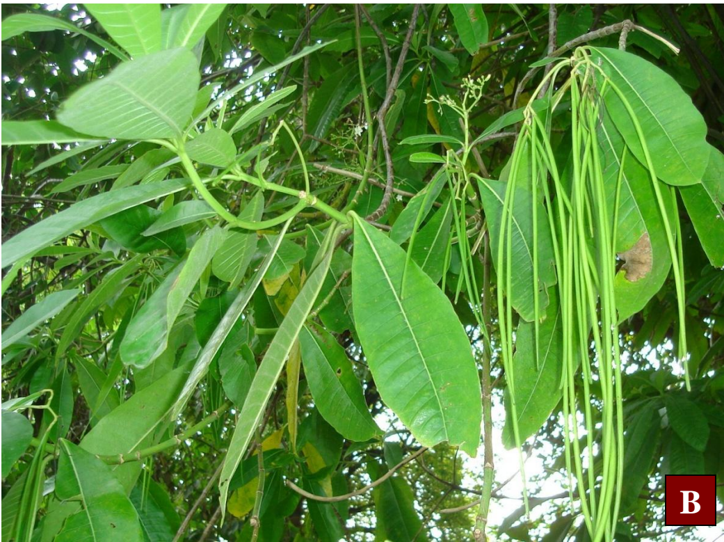
Fig. 1. Alstonia macrophylla Wall. ex. G. Don