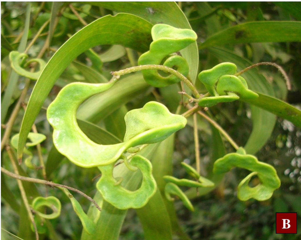
Fig. 31. Acacia auriculiformis A.Cunn. ex Benth.