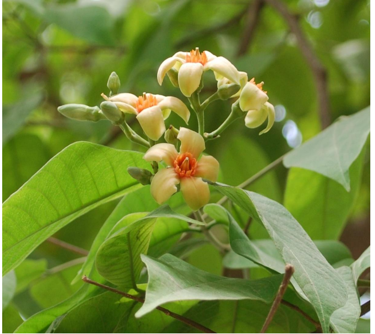
Fig.5. Wrightia coccinea Sims