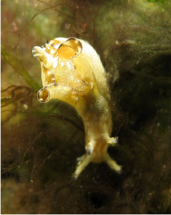
5) Aplysia punctata (Cuvier, 1803)

No picture of living animal from Madeira Island available.