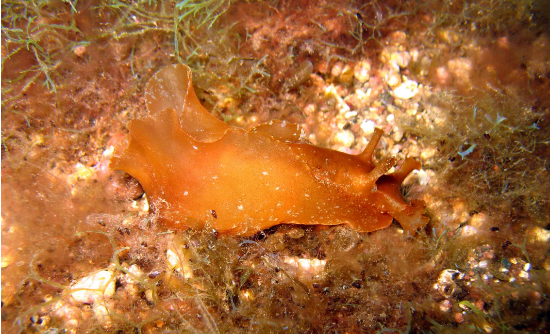
3) Aplysia fasciata Poiret, 1789