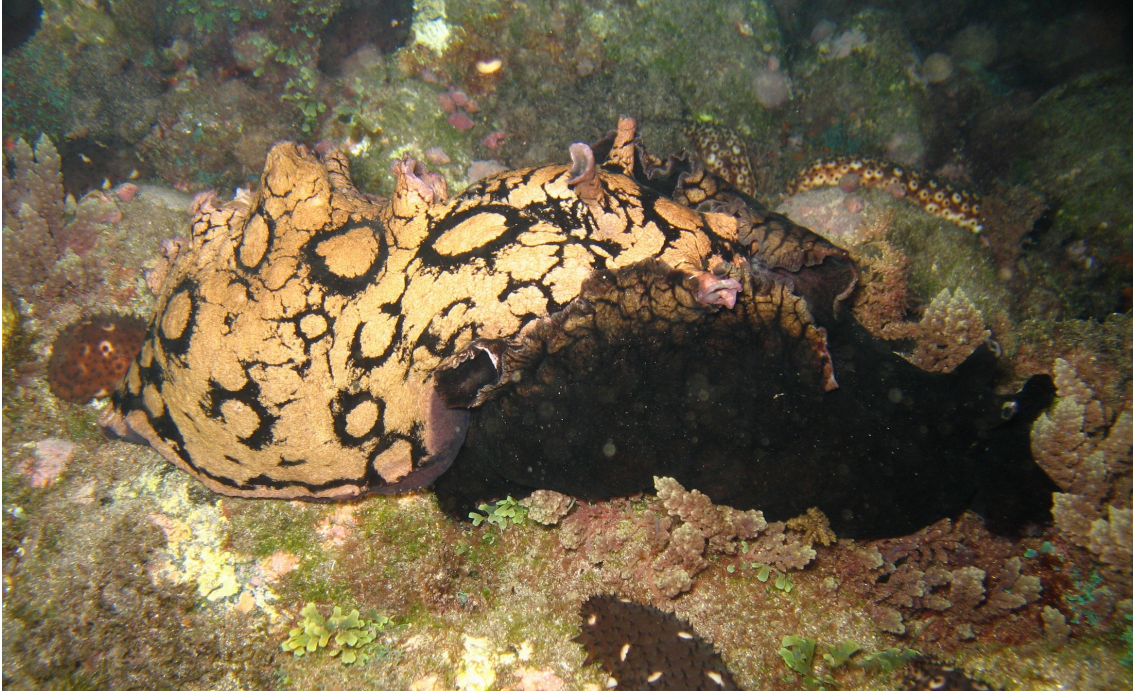
Two different colour morphs mating.