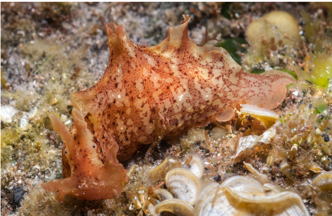
Canary Islands.

No picture of living animal from Madeira Island available.