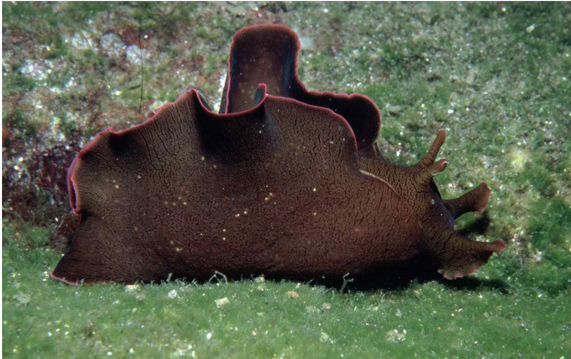
4) Aplysia parvula Guilding in Mørch, 1863