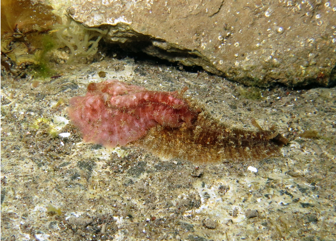
Two different colour morphs mating. Note spawn in background.

6) Dolabrifera edmundsi Valdés et al., 2017