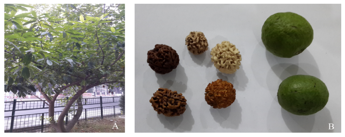
Fig. 1. The rudraksha plant (A) and fruits and seeds of rudraksha (B).

Apart from India, the rudraksha tree is mainly found in Philippines, Manila, Australia, Myanmar, Bangladesh, Bhutan and Nepal. The rudraksha tree has medicinal and religious values especially in India. Parts of rudraksha tree are used as medicines for treatment of epilepsy, stress, depression, palpitation, nerve pain, migraine, arthritis hypertension, anxiety, liver diseases and asthma. E. sphaericus is also reported to have antibacterial and antioxidant properties [2]. The dried herbal fruit of rudraksha tree (Fig. 1) has been reported to have positive effects on nervous system and heart in ayurvedic medicine [3, 4].