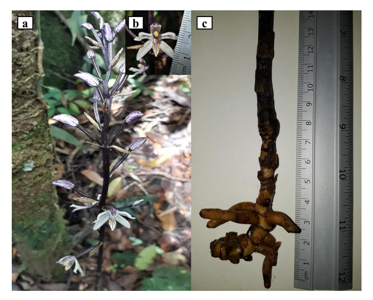
Fig. 1. Aphyllorchis halconensis. a. Habit; b. Frontal view of the flower; c. Stem, Rhizome and Roots.

Conservation status : A halconensis has not been assessed by the IUCN Red List of Threatened Species, but is in the Catalogue of Life (IUCN 2017).