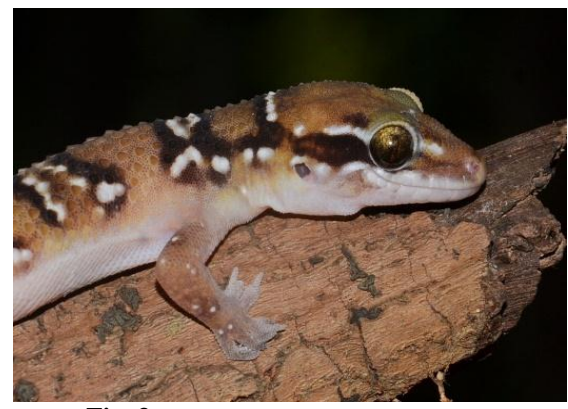
Fig. 3. Head portion of Hemidactylus triedrus