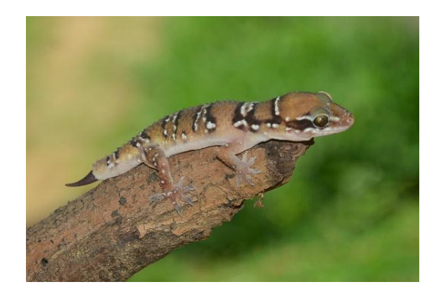
Fig. 1. Termite hill gecko Hemidactylus triedrus

Conversion forests into agricultural lands, habitat loss and road kill are the major deleterious effects on the local population of geckos. However, the documented habitat suffers from high industrial activities which bring about high pollution and high anthropogenic pressure. Additional field surveys are necessary for the harmony of this habitat and our study establishes the existence of this species in the state of Odisha.