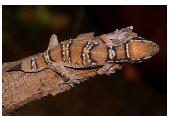
Fig. 4. Dorsal side of Hemidactylus triedrus