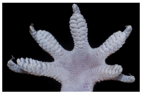
Fig. 2. Lamellae of Hemidactylus triedrus