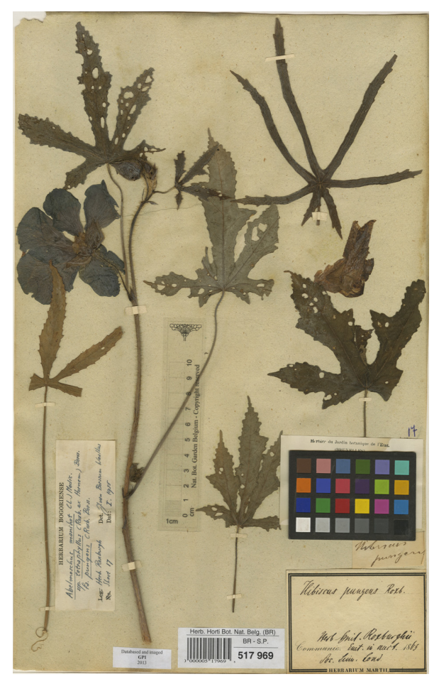
Fig. 2. Lectotype of Hibiscus pungens Roxb.

Abelmoschus pungens var. mizoramensis K.J.John, Krishnaraj & K.Pradheep, var. nov.