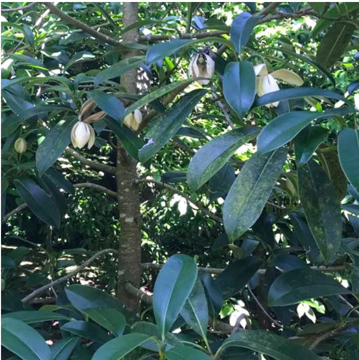
Magnolia conifera .

This year the flowering was copious and I hoped for better things. The flowers opened in succession from the top of the tree downwards, and the tree was covered. Looking up into the branches, there were a few flowers still retaining their white colour but most had become brown and from a distance looked as if they had turned to mush. A rather unpleasant sight.