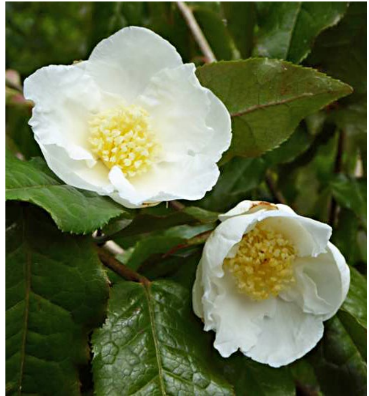
Camellia trichocarpa . See page 10

The 2020 AGM will be at the Bothy at Bowood on 9th May