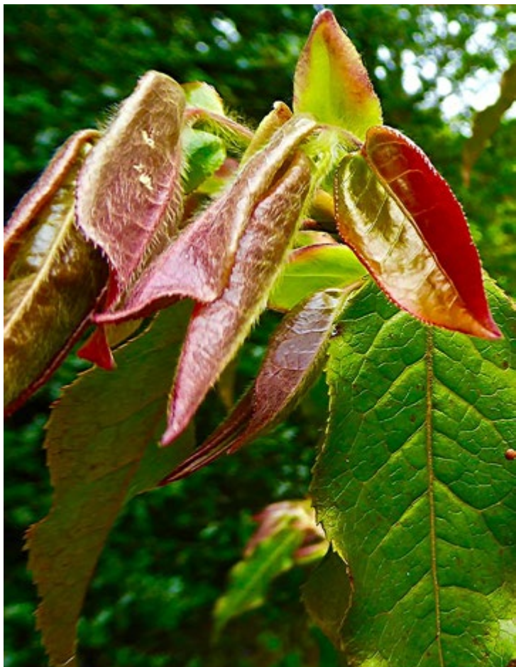
Young foliage of Camellia trichocarpa

The foliage is very distinctive. Leaves are dark green, glossy and up to 13cm long with a short petiole, acuminate, rounded at the base, serrate but with a characteristic wavy edge and a rugose finish with reticulate veining. The young growth is coppery red.