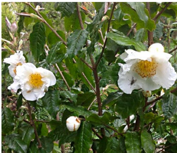
Camellia trichocarpa .

The flowers, opening in early spring, are held singly or in twos at the shoot tips and in the upper leaf axils and are 5–8cm across, white, slightly wavy and crinkled with 6-7 petals framing a prominent boss of deep yellow stamens.