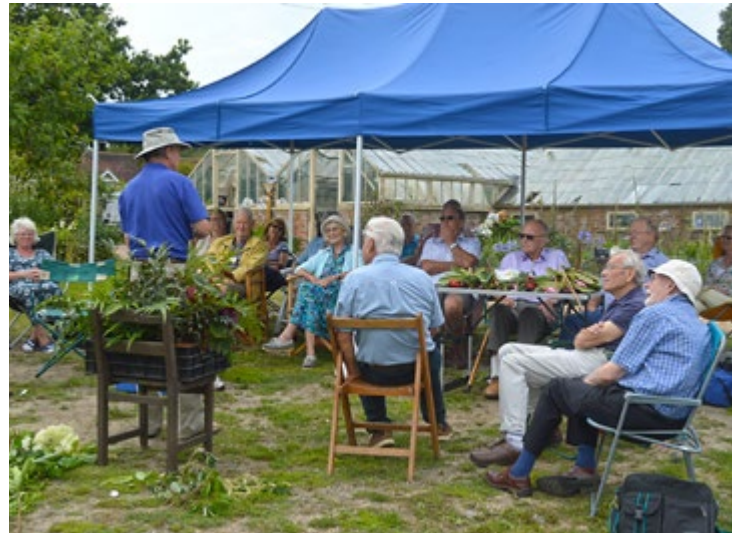
Summer picnic at Loder Plants.