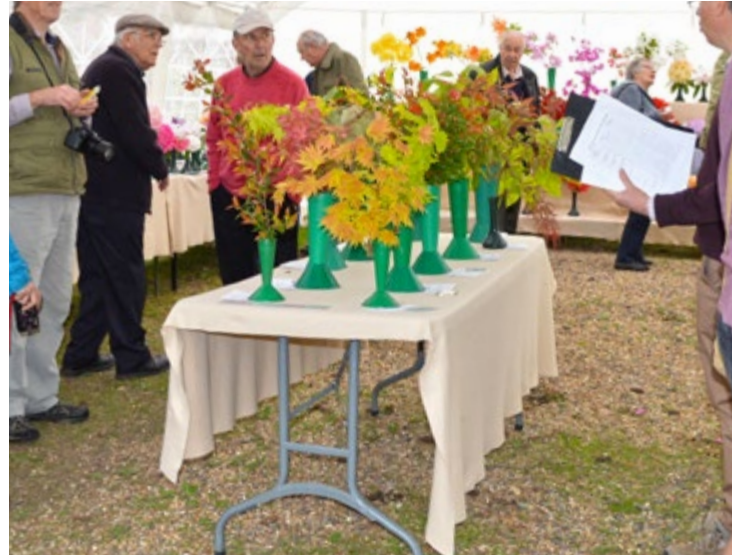
Part of the show tables at the Wessex Branch Show

The floral displays provoked a lot of interest among the garden visitors and many questions were asked.