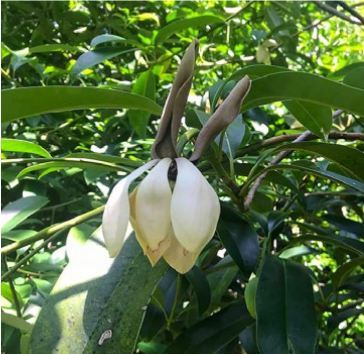
John's magnolia before the unpleasant change he describes in this note.

This year the flowering was copious and I hoped for better things. The flowers opened in succession from the top of the tree downwards, and the tree was covered. Looking up into the branches, there were a few flowers still retaining their white colour but most had become brown and from a distance looked as if they had turned to mush. A rather unpleasant sight.