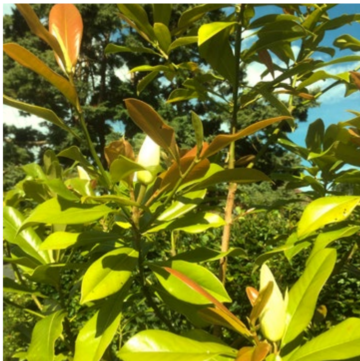
Above: photos of Steve's magnolia