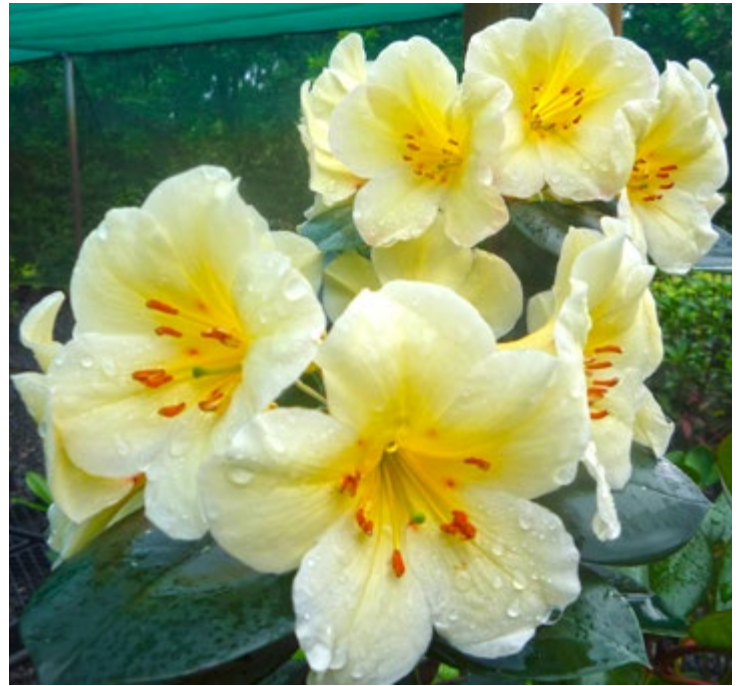
R. 'French Vanilla'