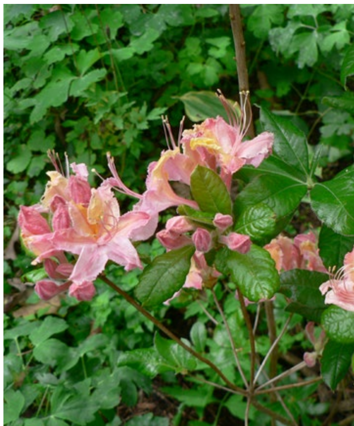
Rhododendron 'Thurstaston'