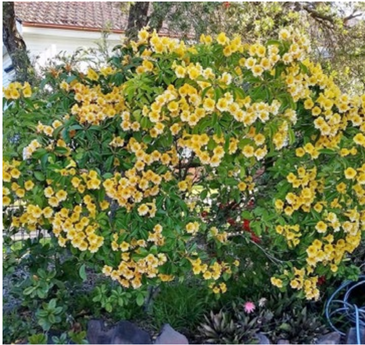
R. 'Haloed Gold'