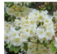
Olivia New and floriferous rhododendrons