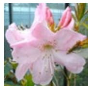
Schlippenbachii Outstanding and fragrant azaleas

Growers of the finest range of Rhododendrons and Azaleas in the country. Everything from historic varieties rescued from some of the great plant collections, to the latest introductions from around the world.