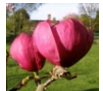
Black Tulip Fantastic range of magnolias

Fantastic new searchable website with secure online transactions for fast and acclaimed delivery. Quality specimen plants up to 1.2m high.