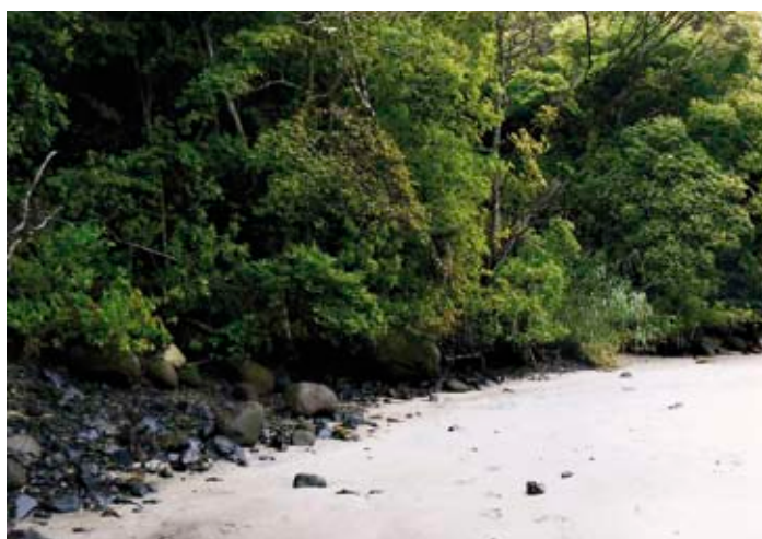
(6) Riverside of the Anbo River. R. yakuinsulare at the margin of the evergreen broadleaved tree forest.

Although usually occurring as rheophytes along the streams, sometimes R. indicum mixes in low bushes on the wet mountainside. But I cannot fully explain the origin of pollen source, because the mass plantations of R. indicum are along the roadside.