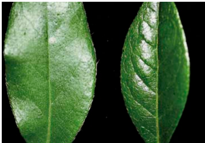
(5) Upper surface of the leaves.

I observed two small populations of R. yakuinsulare near Anbo, Yaku-cho, eastward of the island. One is around the well-developed evergreen broadleaved tree forest that clothes the ravine of the Anbo River. R. yakuinsulare occurs along the riverside or on the steep sunny slope of the ravine at an altitude of 0 to 10 m (Photo 6 & 7). On some plants nearest to the stream, occasional floodwater washes their roots. Possibly not surviving under deep shade, young seedlings are only found on the steep stony parts of the site.