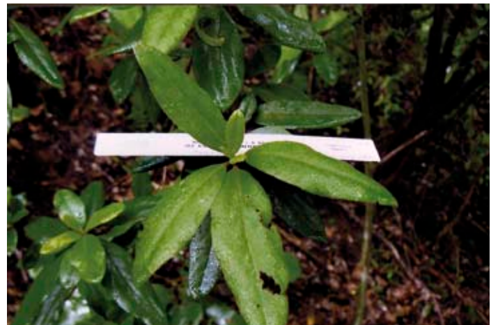
(3) R. yakuinsulare . An oblong leaf form in the woodland. The white plastic scale is 15cm long.