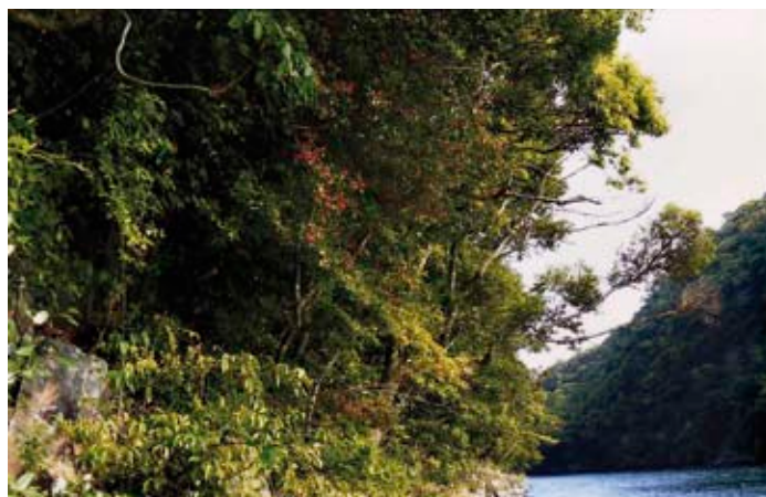
(7) R. yakuinsulare . A plant on the steep rocky slope