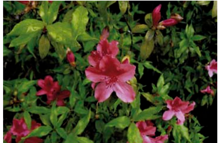
(2) R. yakuinsulare . A stenophyllous leaf form from the riverside

Taxonomically this species relates to R. oldhamii (Taiwan), R. amanoi (southern Ryukyus) and R. scabrum . The most closely allied species is R. scabrum of Amami and Okinawa Islands of middle Ryukyus. The major differences between them are R. yakuinsulare has a smaller corolla and greater density of whitish adpressed hairs on the leaf upper surface (Photo 5). Recently an author treated R. yakuinsulare as a variety of R. scabrum (Yamazaki 1993, 1996).