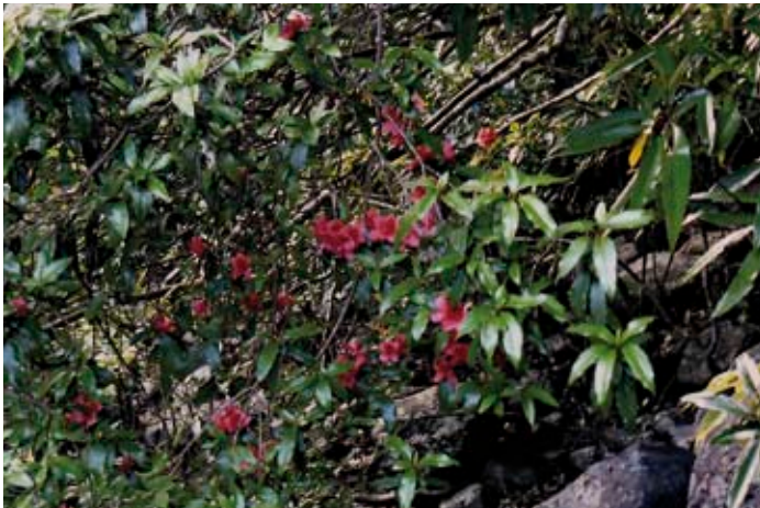
(1) Rhododendron yakuinsulare .

In 2007, I had the opportunity to observe this plant in its native habitat. So I would like briefly to introduce this azalea to western readers.