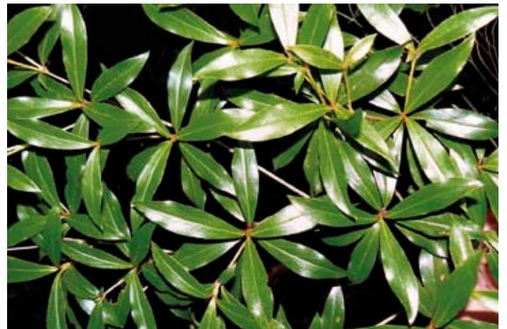
(4) R. tashiroi . Commonest azalea species in Yakushima Island. Some plants show 'stenophyllism'