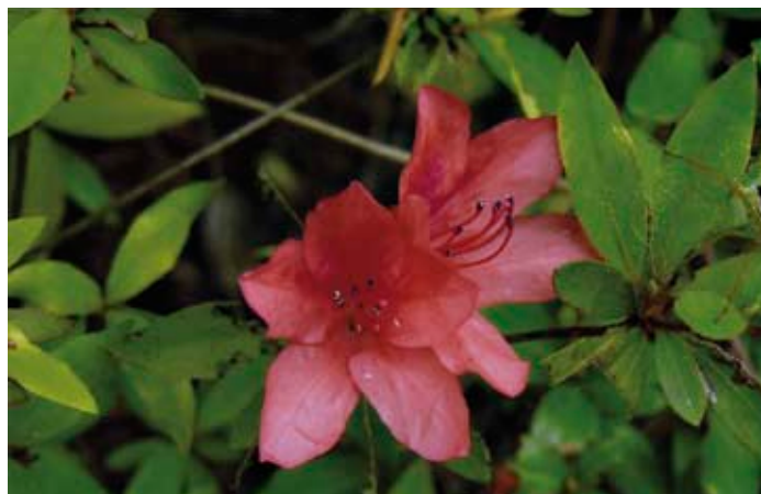
(8) A natural hybrid ( R. yakuinsulare x R. indicum ).

The 7 stamens and narrow leaves show the intermediate characters of the two species.