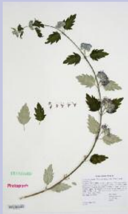
Nomenclatural standard of Caryopteris incana (Thunb. ex Houtt.) Miq. 'Blue Cascade'

This is the nomenclatural standard for Caryopteris incana 'Blue Cascade' which forms a permanent record of the distinguishing characters of the cultivar 'Blue Cascade', which is deposited in the RHS Herbarium (WSY).