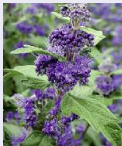
C. × clandonensis