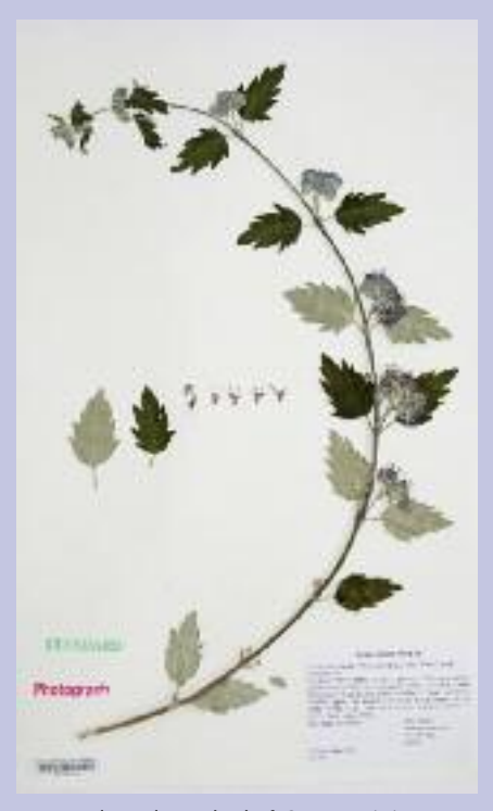
Nomenclatural standard of Caryopteris incana (Thunb. Ex Houtt.) Miq. 'Blue Cascade'

This is the nomenclatural standard for Caryopteris incana 'Blue Cascade' which forms a permanent record of the distinguishing characters of the cultivar 'Blue Cascade', which is deposited in the RHS Herbarium (WSY).