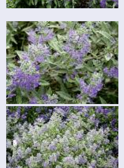
C. × clandonensis 'Heavenly Baby'

A dwarf plant with very small silvery grey leaves and small, sharp teeth. Flowers pale blue. Pale grey-green fruiting calyx. Seedling found by Rachel Thompson in her Surrey garden and introduced by Liss Forest Nurseries in 2001.