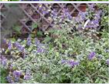
C. × clandonensis 'Moody Blue'

A rather lax plant with pale reddish stems and small, narrow ovate, green leaves, deeply toothed towards the apex with a pale cream margin. Flowers pale blue. Deeply lobed pale blue to green, slightly inflated fruiting calyx. Raised in Ireland by Kieran Dunne and introduced by Liss Forest Nurseries in 2003. The leaves tend to burn if grown in full sun.