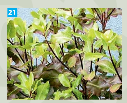
'Variegatum' see under 'Mystery'

'Loxhill Gold' is somewhat similar but with darker green leaves with a yellow central variegation.