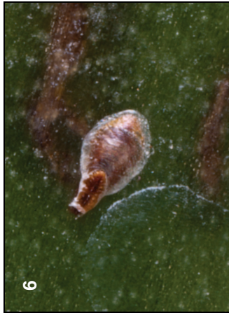
PLATE 5. Fig. 1. Lepidosaphes chinensis colony on the stem of Dracaena sandreriana © Maurice Jansen. Fig. 2. Lepidosaphes chinensis mature adult female scale cover (bottom, cover length 3.0mm) and male scale cover (top, cover length 1.4mm) on Yucca © Fera. Fig. 3. Lepidosaphes chinensis female scale cover turned over to show the white eggs © Fera. Fig. 4. Lepidosaphes chinensis female scale cover turned over to show the white eggs © Fera. Fig. 5. Lepidosaphes chinensis first instar scale cover © Fera. Fig. 6. Lepidosaphes chinensis second instar scale cover © Fera.