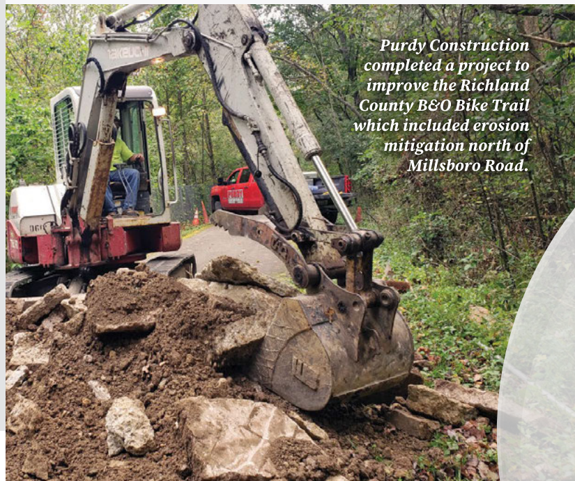
Purdy Construction completed a project to improve the Richland County B&O Bike Trail which included erosion mitigation north of Millsboro Road.