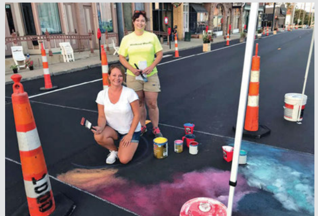
The Better Block Project spearheaded by Richland County Regional Planning spanned two weeks in August on East Fourth Street between Main and Diamond streets. It was a temporary installation to show the impact of traffic-calming measures on a busy street. Some of those tactics included expanding the sidewalk into the street, bumped out curbs at intersections, planters, tables and painted crosswalks.