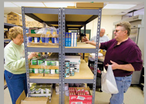
Salvation Army and Plymouth Food Pantry