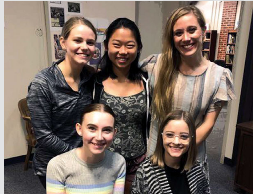
The Friendly House offers an after-school program for children that offers programming and of course play.

Nonprofit organizations apply for interns via the Fran and Warren Rupp Fund at the Foundation. These women worked at the Richland Academy of the Arts during the summer.