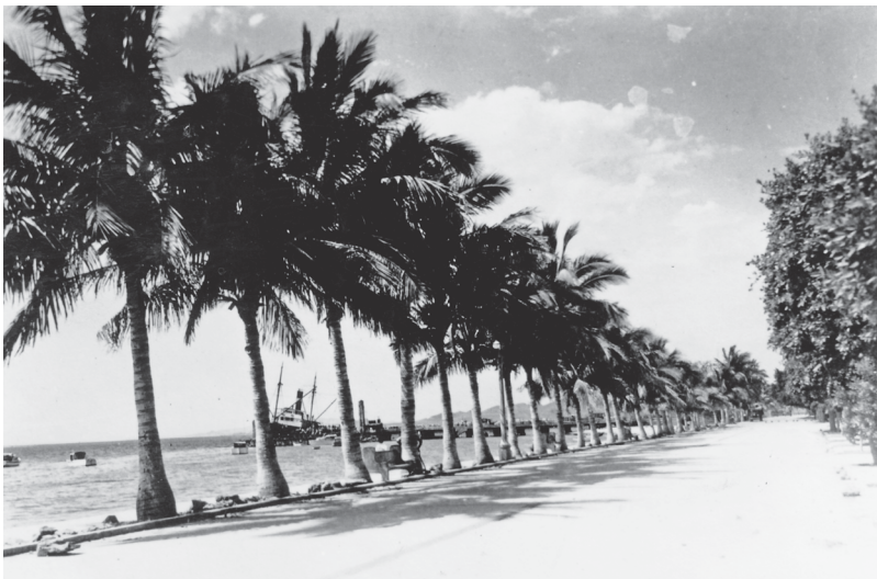
Figure 3. Photograph of the La Paz malecón, 1940. Photo No. 6584 from Archivo Histórico de B.C.S. Pablo L. Martínez, in La Paz, BCS.