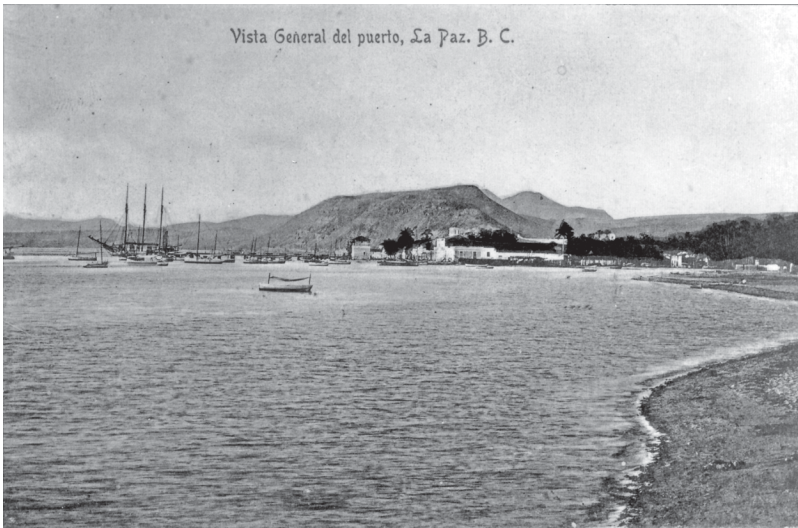
Figure 1. 1940 postcard of La Paz.

The expedition took place just before a highly contested presidential election in Mexico, in which PRI-affiliated president Lázaro Cárdenas hoped to hand the office to Manuel Ávila Camacho (who had been his right-hand man during the Mexican Revolution). The PRI had been rigging the elections since the revolution. After the election, it was reported that Camacho won the presidency with 94% of the popular vote! Not everyone in Mexico supported or backed the PRI’s revolutionary legacy, and most regarded the party as highly corrupt. This political situation was creating unrest in the country and, combined with the Second World War (which had just begun in Europe), the circumstances gave Ricketts and Steinbeck further grist for thought and philosophizing about human nature and the human condition. Coincidentally, President Cárdenas visited La Paz in 1940, though he was not there when the Western Flyer and her crew visited (Figures 1–4).