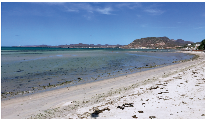
Figure 5. Ricketts-Steinbeck collecting site No. 5, La Paz, page 109 in Sea of Cortez.

as there is no appropriate habitat for this species in the area. They likely took G. grapsus at a rocky site a few kilometers away and combined it with their La Paz sample list. We also did not see the common Gulf fiddler crab Uca crenulata , even though the uppermost beach habitat, next to the malecón itself, appeared suitable for this species. The anoxic layer a few centimeters below the surface might now be excluding this once-common La Paz Bay species. No sea stars of any kind were seen. It is likely that the larger-bodied species are periodically harvested by locals for food and for the curio shop trade in La Paz. Also, echinoderms throughout the Gulf have not fully recovered from the devastating Gulf “echinoderm wasting disease” event that began in 1978 (Dungan et al. 1982).