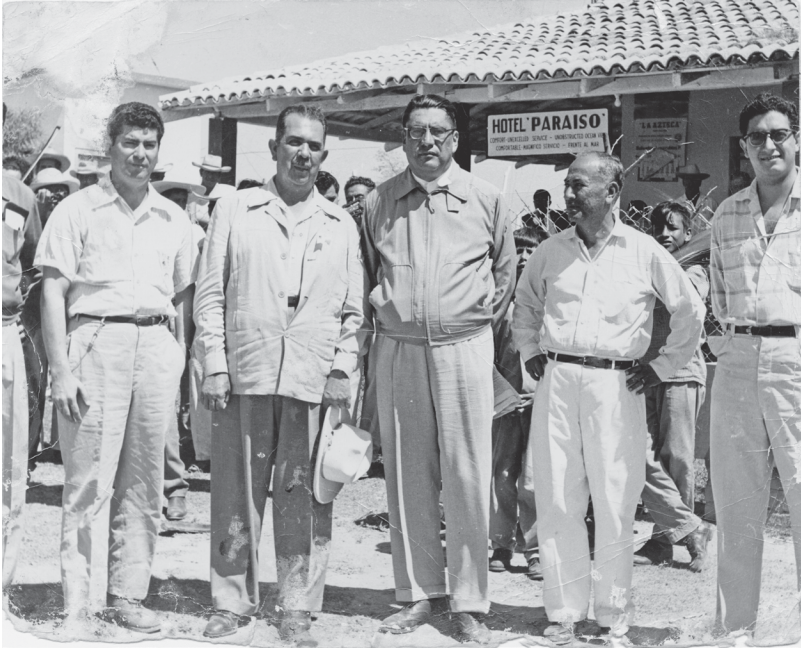
Figure 4. Photograph of President Lázaro Cárdenas and companions in front of the old Hotel Paraíso, La Paz, 1940. Cárdenas was president of Mexico from 1934 to 1940.