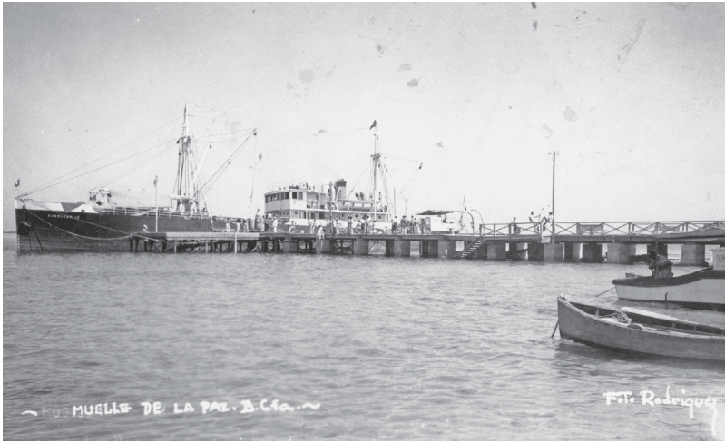
Figure 2. The municipal pier was gone when the Western Flyer arrived in La Paz on March 21, 1940, and the Flyer anchored “250 yards westward” of where the pier used to be. This photograph, taken that same year, is of another, commercial pier in La Paz.