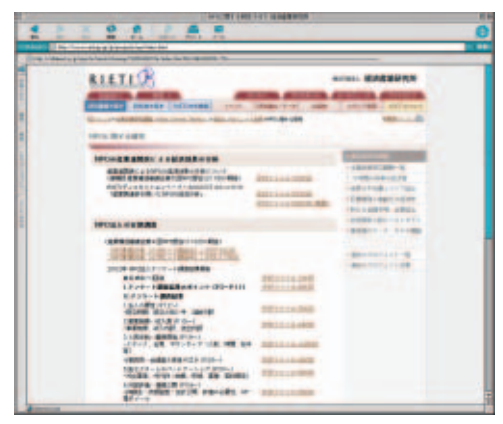
"Research project on NPOs"