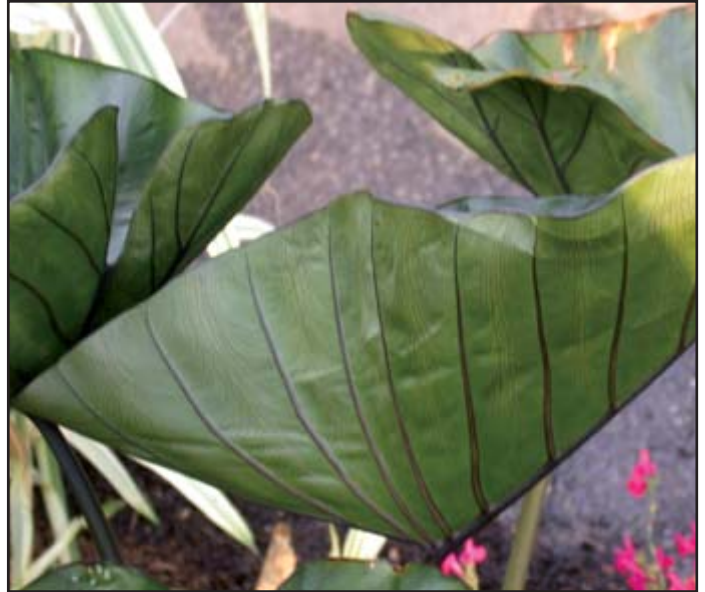
Colocasia esculenta 'Coffee Cups'