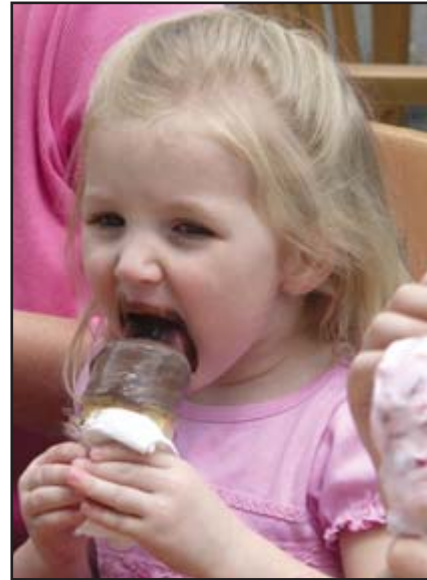
"Cool kids" keeping cool

needs of our guests, as well as the animal collection, during the extreme heat of summer. Aside from the air-conditioned buildings, fans and refreshing water misters are distributed throughout the park allowing visitors to cool off during their outdoor journey. As the temperatures increase, so do the number of snow cone, ice cream and bottled water stands along the Zoo's pathways providing additional creature comforts for members and guests during their visit to the "coolest" place in town. We hope you will join us!