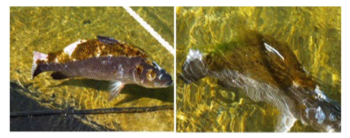
Figure 1: Showing Asian Sea bass Lates calcalrifer live swimming in the Red Sea cultured earthen pond suffered from large and deep ulcers on the back (saddleback disease) and caudal fin growing on it green algae accompanied with destroyed opaque eyes.

The general clinical signs of infected Asian Sea bass fish were represented as sluggish movement, loss of escape reflex (fig, 1), sloughing of scales, ulceration of the skin at the region of dorsal of the body (saddleback disease) (fig. 2). Fading of skin color, and eroded dorsal and caudal fins with protruded eyes (pop eyes) (fig. 2 and fig. 3), Off food and finally death. Postmortem examination revealed that congestion of gills, congestion and inflammation with enlargement of the liver, gall bladder, spleen and kidney with serous fluid accumulation in the peritoneal cavity (fig. 4).