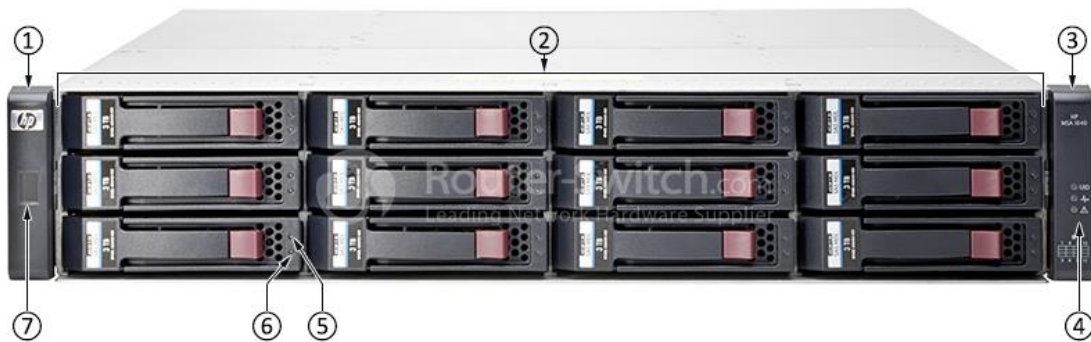
Figure 1 shows the MSA 1040 Array LFF or supported 12-drive expansion enclosure.