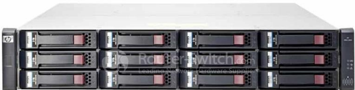
Figure 1 shows the MSA 2040 LFF enclosure.