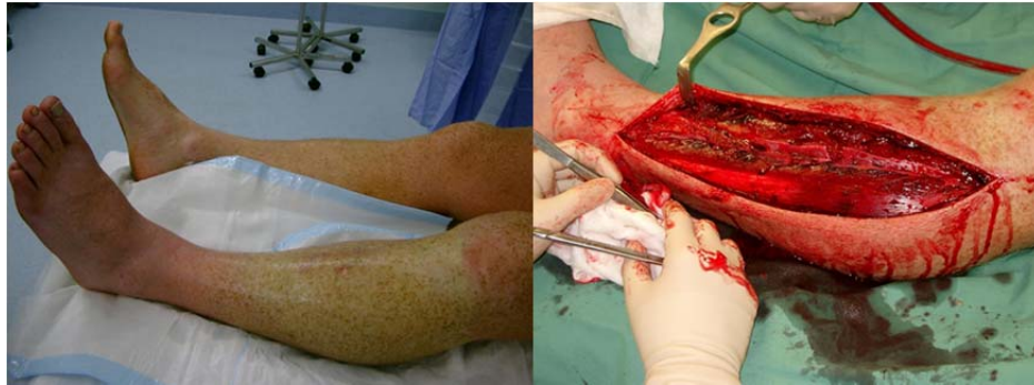
A lower extremity showing signs of swelling and pallor with compartment syndrome and an open fasciotomy performed on a lower extremity. www.lifeinthefastlane.com

For more information, please visit the following websites: