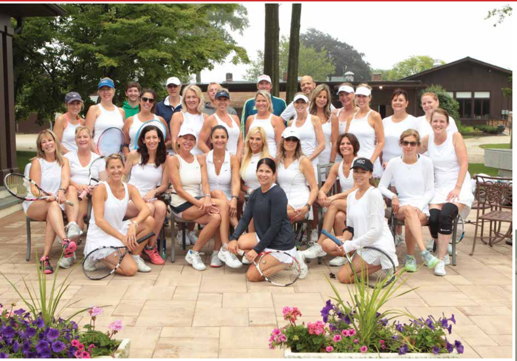
PICTURED ABOVE: TENNIS PLAYERS