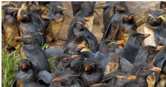
Figure 5: Oiled penguins and their rescue after the MS Oliva disaster on Nightingale Island

breeding on Amsterdam Island. Two pathogens have been identified: Pasteurella multocida is present in the majority of the birds sampled and in a minority of samples Erysipelothrix rhusiopathiae , the causative agent of erysipelas (Jaeger et al. 2018). These infections have been implicated in the high chick mortality of Indian yellow-nosed albatrosses Thalassarche carteri on Amsterdam Island, so the infection could be responsible for the four successive years of complete breeding failure of the northern rockhopper penguin population there (see 2.5), although further studies are needed to confirm whether this is the case.