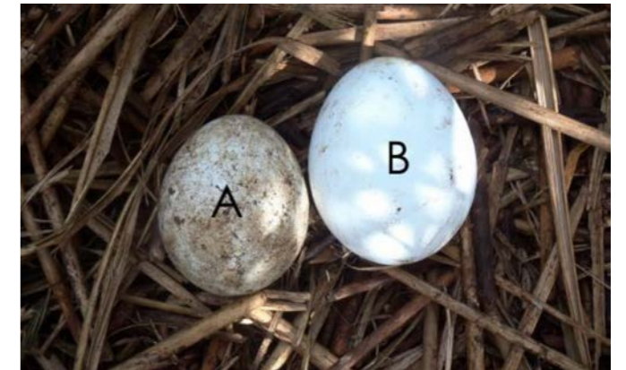
Figure 3: Comparative size of A and B eggs.

During the breeding season on Tristan da Cunha, adult northern rockhopper penguins are regularly preyed on by northern and southern giant petrel Macronectes hallii and M. giganteus on the shore and at sea (Ryan et al. 2008), while in the colony unprotected eggs and chicks are taken by the subantarctic skua Catharacta antarctica lonnbergi and Tristan thrush Turdus eremita (Steinfurth, pers. obs.). On Amsterdam Island, active predation by subantarctic skuas also occurs during the breeding season. Predation on adults by seals close to the beaching places is reported but is believed to be rare.