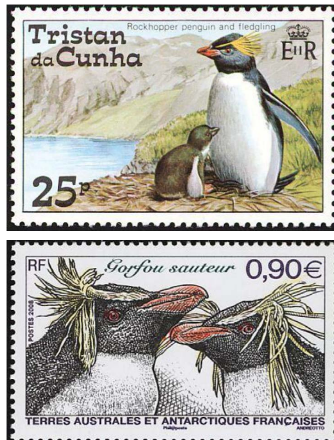
Figure 4: Two examples of northern rockhopper penguin postage stamps.

Predation by sub-Antarctic fur seal ( Arctocephalus tropicalis ), giant petrels and skuas is thought to be influential in population trends of Eudyptes populations elsewhere (Horswill et al. 2014, Morrisson et al. 2017).