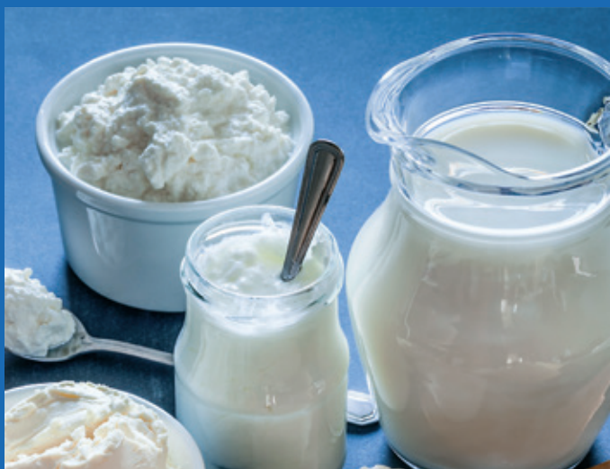
FT-A – LARGE PROCESSORS AND DAIRY LABORATORIES