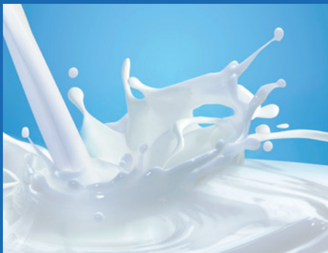
FT-B – MILK COLLECTION POINTS AT DAIRIES