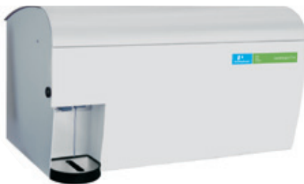
LactoScope™ Milk and Dairy Products Analyzer