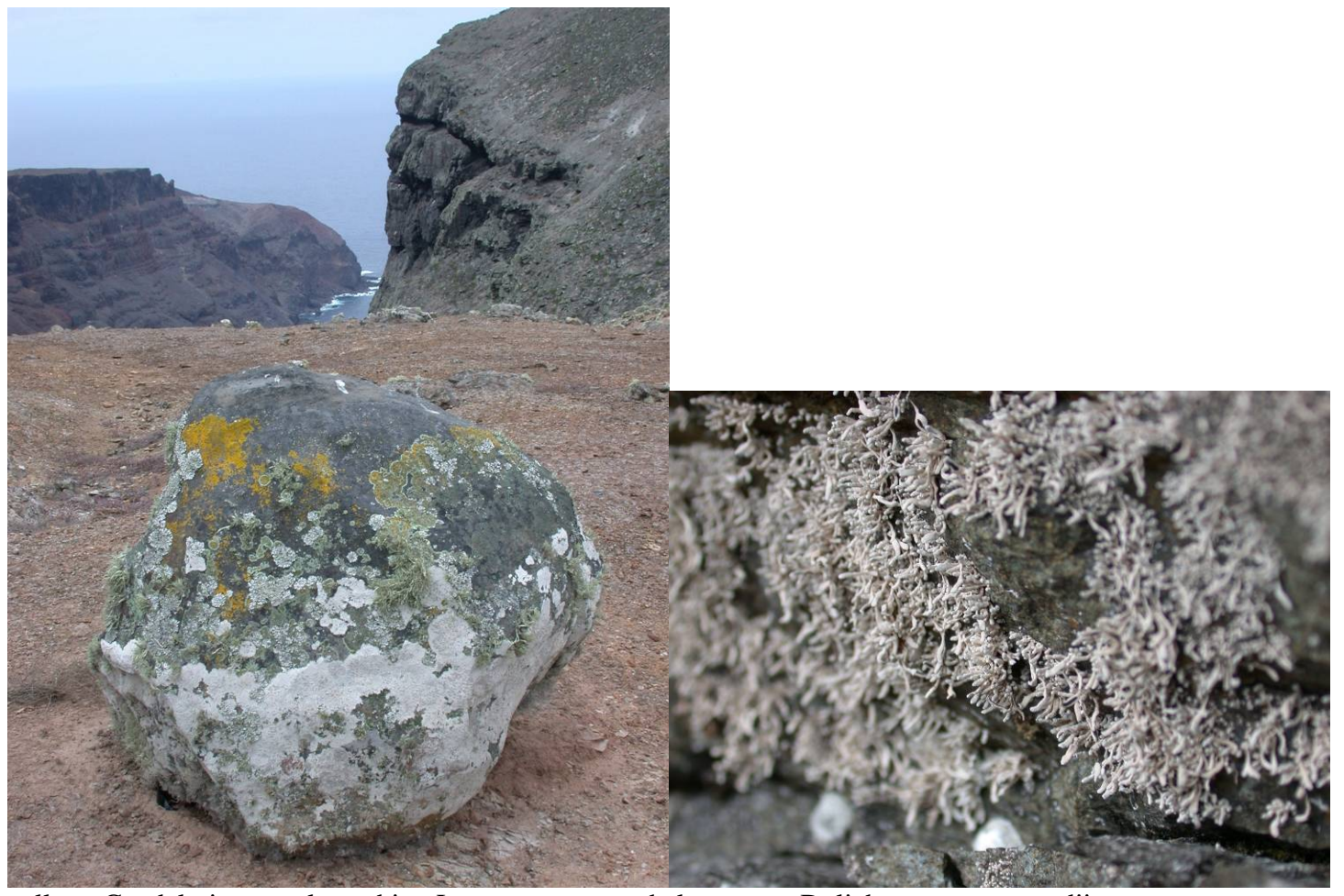
yellow: Candelaria concolor; white: Lecanora sanctae-helenae Dolichocar