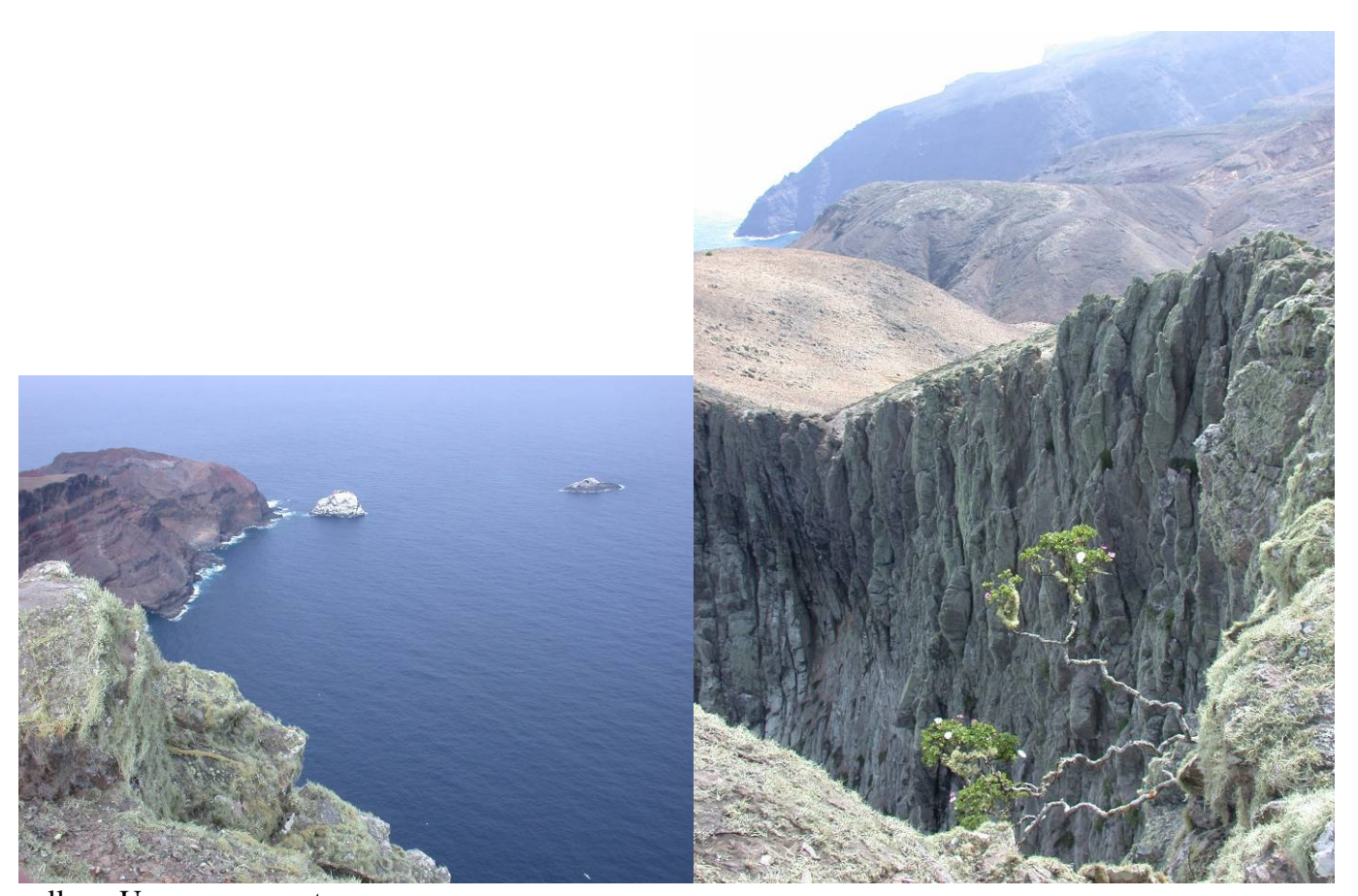
yellow: Usnea exasperata

Additional localities, not studied in detail (also by A. Aptroot in Oct. 2006)