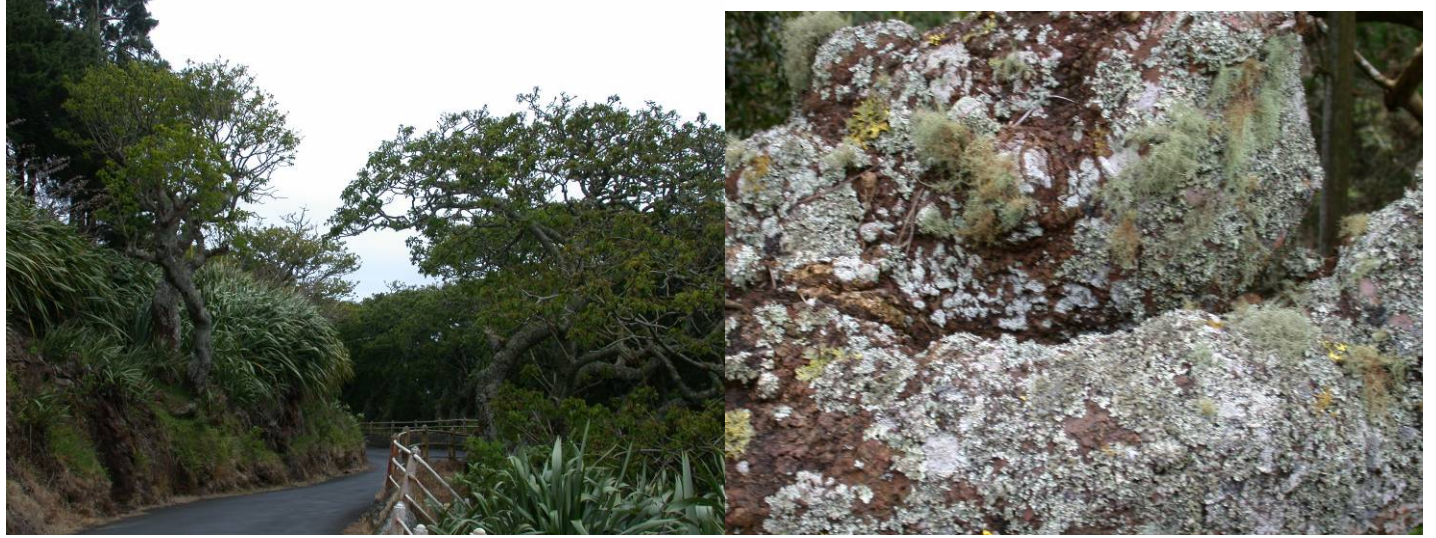
green: Psilolechia lucida; yellow: Teloschistes flavicans