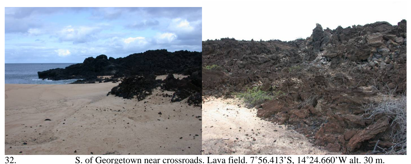
S. of Georgetown near crossroads. Lava field. 7°56.413'S, 14°24.660'W alt. 30 m.

31. Georgetown, Longbeach, coastal lava field. 7°55.4'S, 14°24.3'W alt. 5 m.