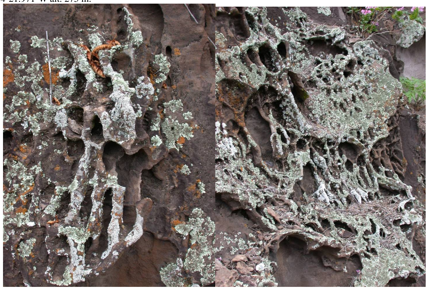
35. Lady Hill. Lava field on slope with large basalt boulders and soil crusts. 7°56.637'S, 14°22.880'W alt. 300 m.

34. E. slope of Sisters Peak. Lava field on slope with large basalt boulders and soil crusts. 7°55.977'S, 14°21.971'W alt. 275 m.