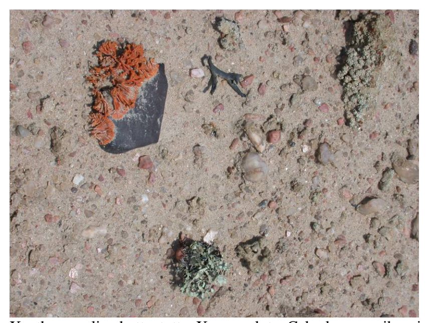
Xanthomaculina hottentotta, X. convoluta, Caloplaca namibensis