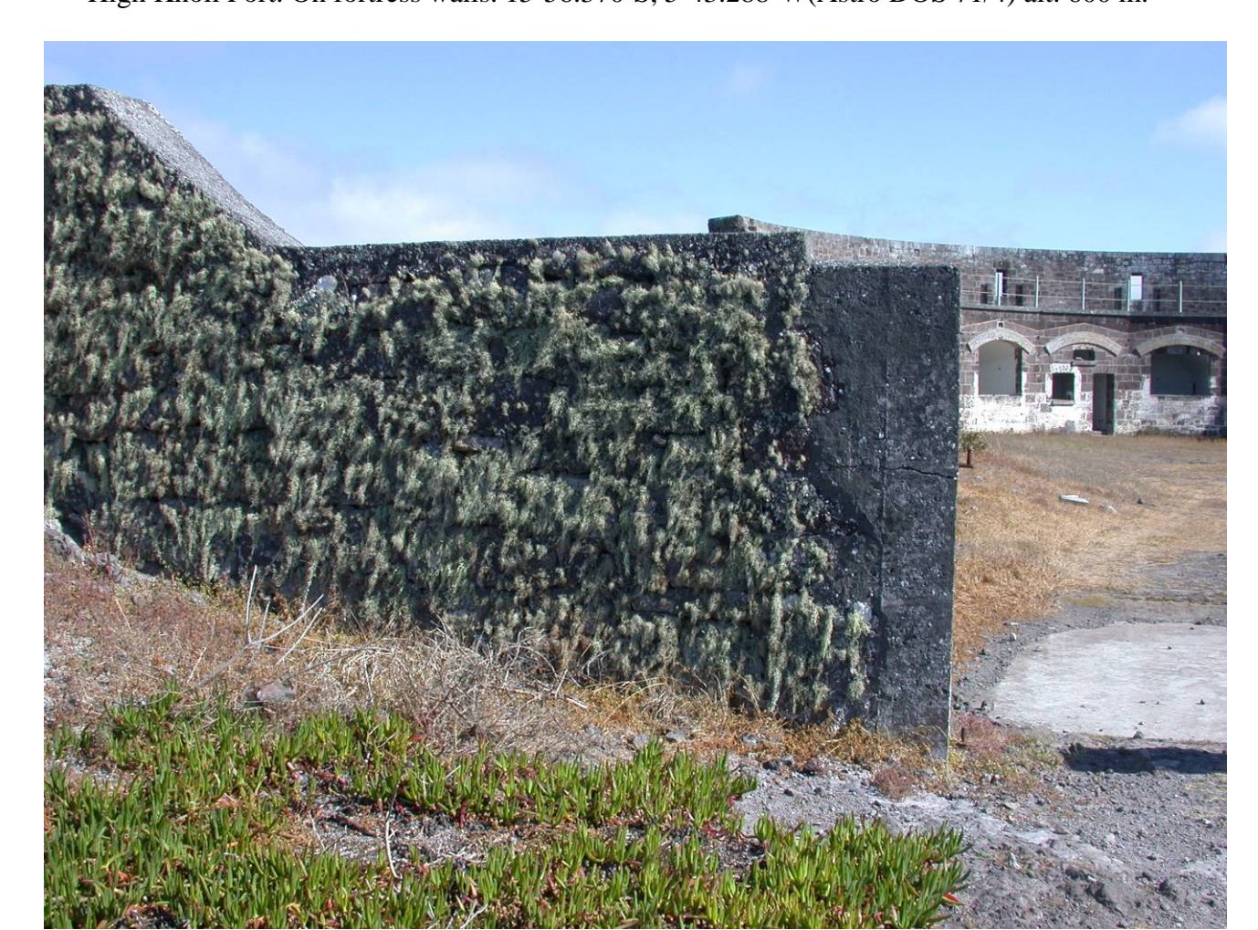
Ramalina rigidella St Paul's Cathedral. Churchyard. 15°57.096'S, 5°43.460'W(Astro DOS 71/4) alt. 600 m.

High Knoll Fort. On fortress walls. 15°56.370'S, 5°43.288'W(Astro DOS 71/4) alt. 600 m.