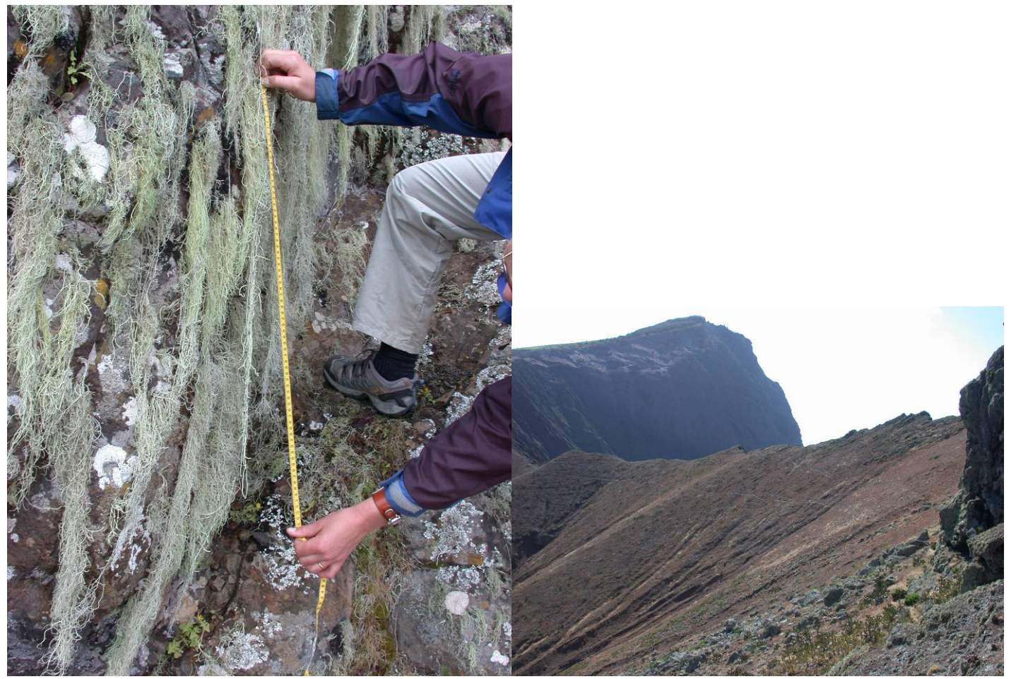
500 years old Ramalina rigidella