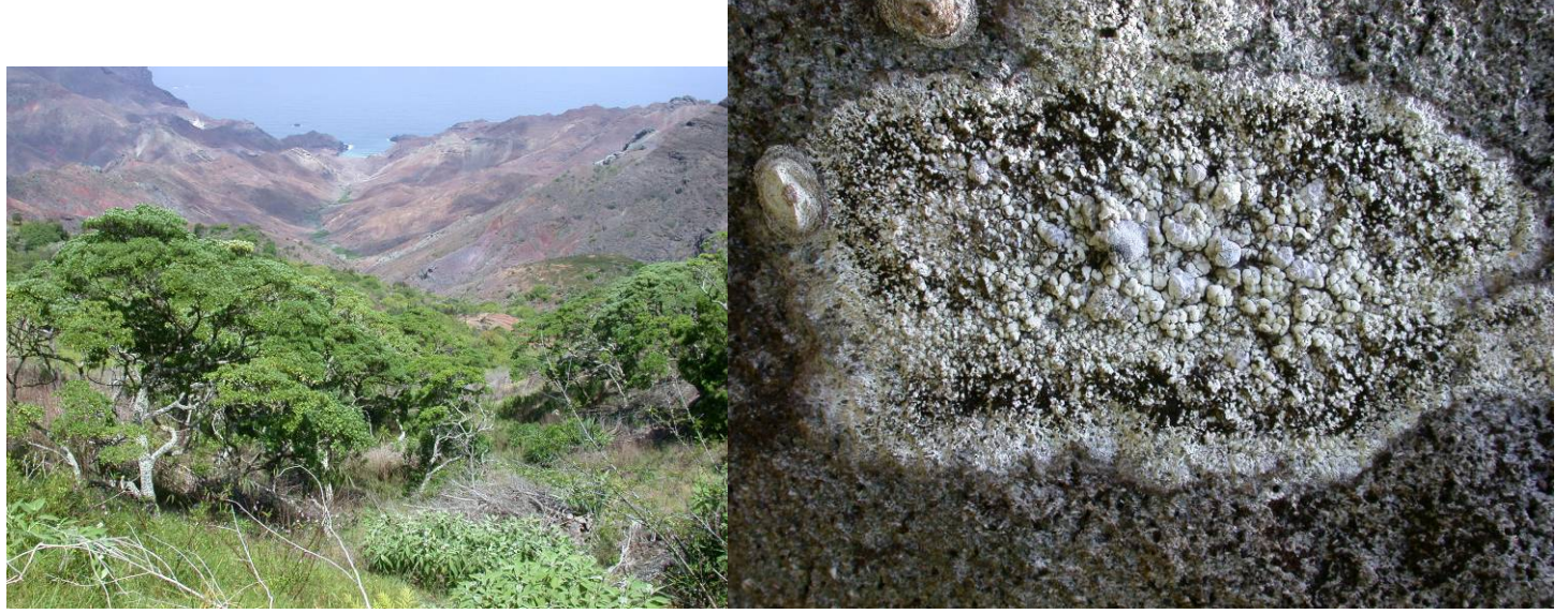
Syncesia effusa with Taeniolella fungus parasite