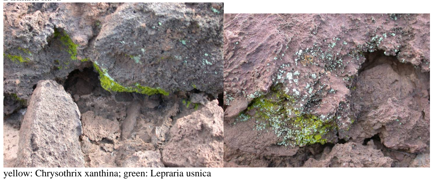
33. W. of 14°22.520'W alt. 175 m. W. of Two Boat Village. Lava field on slope with large basalt boulders and soil crusts. 7°56.181'S,