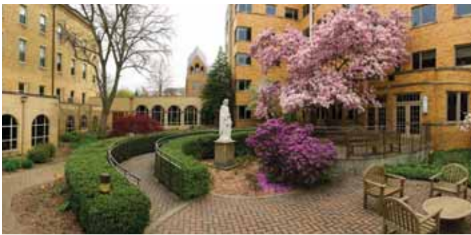
The courtyard at the Queen of Peace Convent

“In a green community, there is no predetermined routine to facilitate their independence or their ability to pursue individual interests,” said Chen. “It’s a good way to help older adults keep their independence and dignity while they continue to live in a homelike setting. They are able to receive