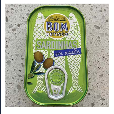
PORTUGUESE SARDINES IN OLIVE OIL Case of 30 x 120 gram Cans. 25.00 case