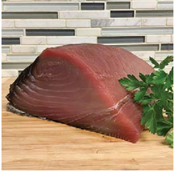
CHOICE GRADE YELLOW- FIN TUNA Light Color & Low Fat Loins. Perfect for Grilling. 8.95 lb