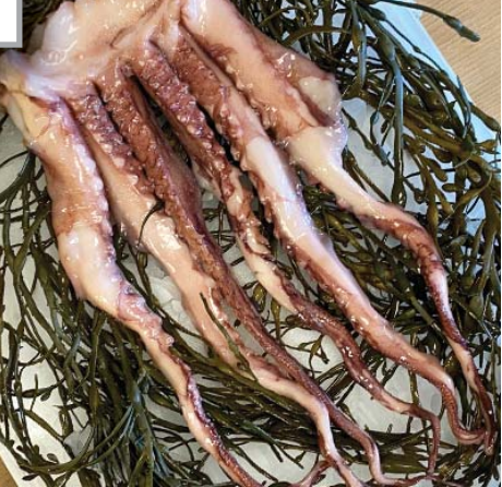
GIANT SQUID TENTACLES Eat a Beast from the Depths! Brand New Item! Sold in Frozen 2 lb Units. 2.95 lb