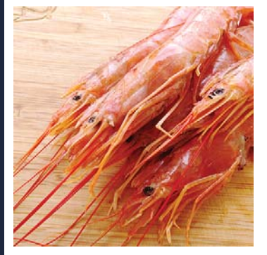
PATAGONIAN PRAWNS 6/8 Size, Head-on. Frozen 26.4 lb Unit. Case Sales Only! 4.99 lb