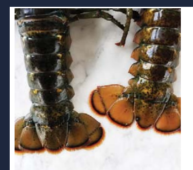
CANADIAN COLDWATER LOBSTER TAILS Frozen 10 lb Case. 4 oz Tails: 25.00 lb 8-10 oz Tails: 30.00 lb