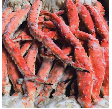
KING CRAB LEGS Long Live the King! 20/24 Size. Frozen 20 lb Case. 17.95 lb