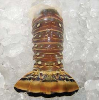
PETITE BRAZILIAN LOB-STER TAILS Frozen 10 lb Case. 3 oz Each. 20.00 lb