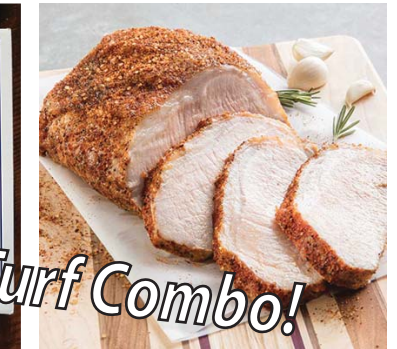
KUROBUTA BONELESS LOINS Heritage Berkshire Pork. Frozen. 7 lb Average Piece. 4-Piece Case. 3.99 lb