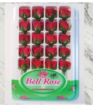
EDIBLE ROSES Vibrant Red for a Dazzling Presentation. Sold in 20 Count Packs 21.00 ea