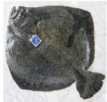
SPANISH TURBOT Meaty with a Mild Flavor. 3-4 lb Whole Fish. 10.95 lb