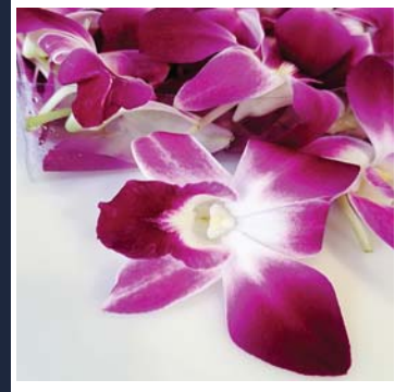
EDIBLE ORCHIDS Gorgeous Purple Color that Makes Any Plate Shine, 50 Count Packs 11.00 ea