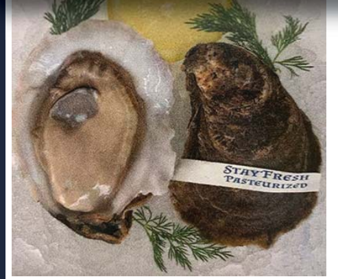
STAY FRESH OYSTERS Mild Flavor, Smooth Finish. Pasteurized to Ensure Quality. Raised in Gulf of Mexico. 100 Count .84 ea

Sale Dates: February 1st - 29th *Special Pricing is Reserved for Current Samuels Account Holders and Guiseppe's 7 Fish Club Members Only. *Price and Availability Subject to Change. *Additional Freight Charges may Apply – Please Consult with Your Samuels Agent for More Information. SamuelsSeafood.com