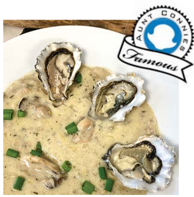
AUNT CONNIE'S CALIFOR-NIA OYSTER CHOWDER Family Recipe. 1 Gallon Unit. 35.00 ea