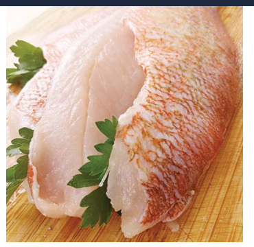
NORDIC ROSEFISH Caught in Frigid North Sea Depths. Skin-on PBO Fillets. 7.99 lb