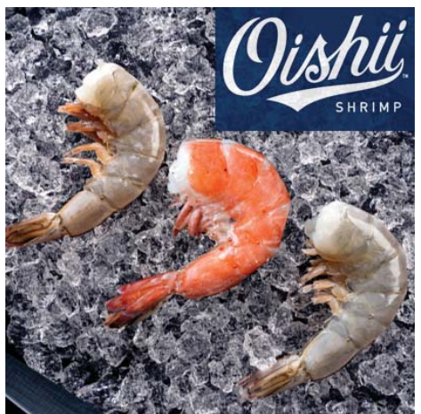
OISHII SHRIMP Unmatched Flavor and Color. Responsibly Raised. Sold in Frozen 10 x 2 lb Case. U/15 Size Easy Peel. 8.95 lb