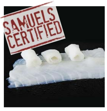
RAFOLS BACCALA CAR-PACCIO Frozen. Desalted, Crafted from Handline-Caught Cod. 11.99 lbb