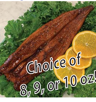
UNAGI Freshwater Eel, Froz 22 lb Case. 299.00 ea Buy 20 Cases, Get One Case Free!