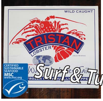
TRISTAN LOBSTER TAILS 4 - 4.5 oz Each. Frozen 10 lb Case. J Tails. 33.00 lb