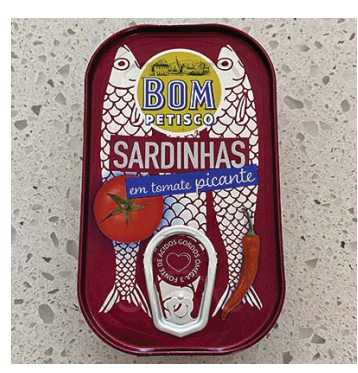
PORTUGUESE SARDINES IN HOT TOMATO SAUCE Case of 30 x 120 gram Cans. 25.00 case