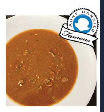
AUNT CONNIE'S SPANISH CRAWFISH GUMBO 1 Gallon Unit Made with the Finest Crawfish!. 35.00 ea