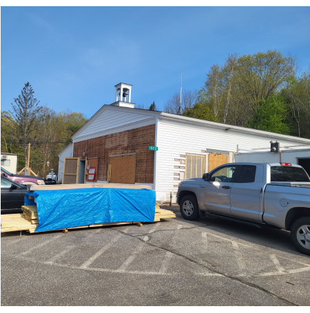
Outside Construction of Police Department