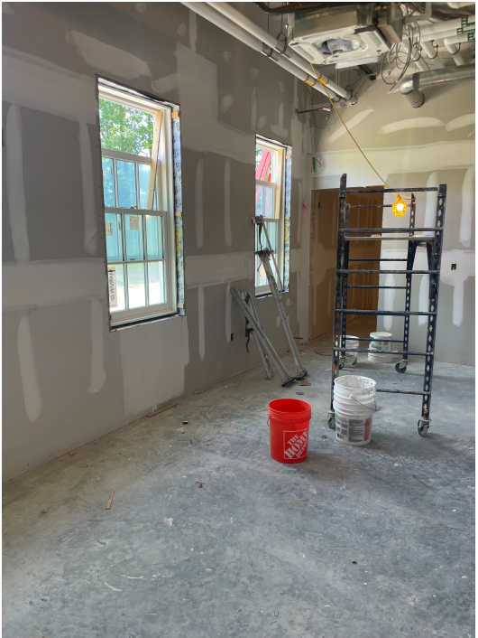
Framing and Drywall for on the Interior of Town Office Building