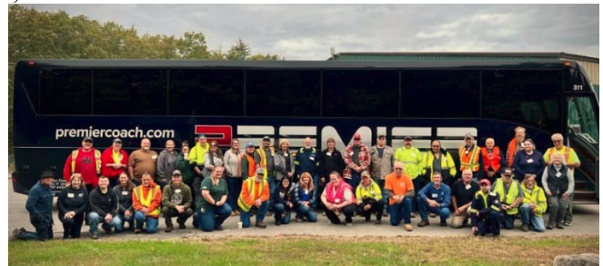
Stop 1: The Waste Management Turnkey Landfill in Rochester, NH. This landfill currently handles 40% of the states solid waste. We rode the tour bus up to the top of the landfill so that we could see all the operations from top to bottom, everything was highly impressive.

On October 18<sup>th</sup>, The Transfer Station staff went on the NRRA Annual Bus Tour.