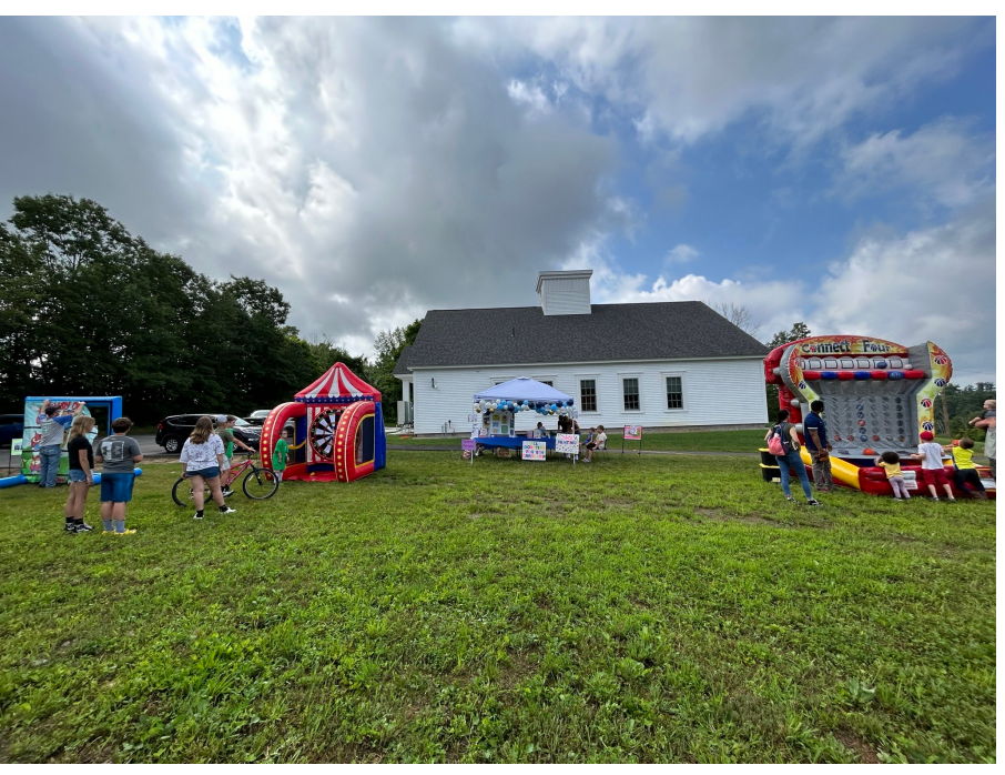
Old Home Day 2023