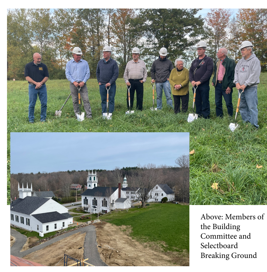
View from the Roof