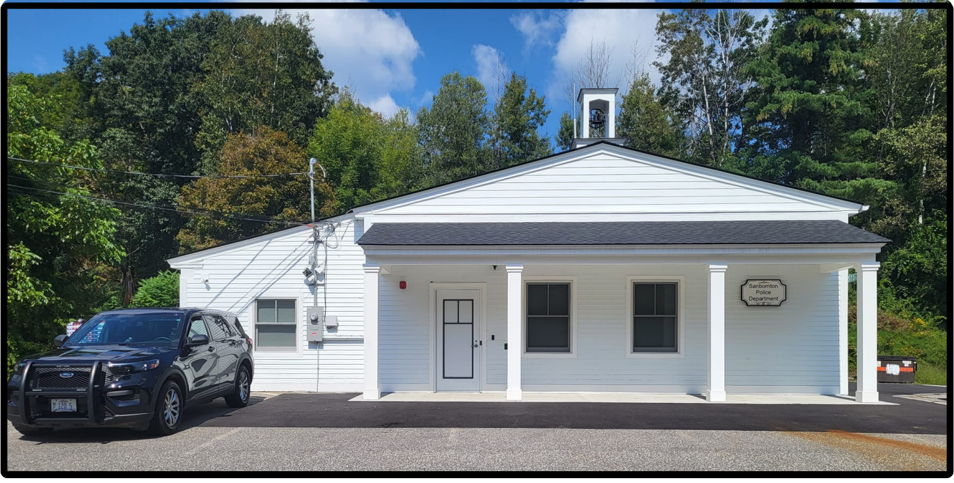
New Town Office and Police Station