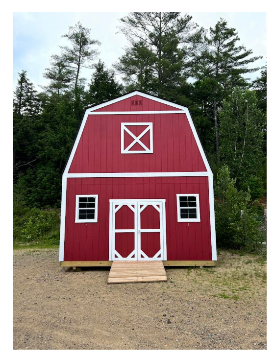
New Shed at the Town Park -thanks to a generous donation