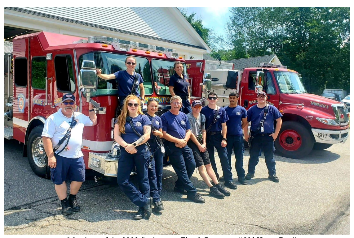
Members of the 2023 Sanbornton Fire & Rescue at "Old Home Day"

Sanbornton continues to be protected by the Officers, Firefighters and Emergency Medical Technicians of the Sanbornton Fire & Rescue Department, these dedicated Men & Women continue to respond 24/7-365 days a year for emergency response to fire, medical emergencies, technical rescue, hazardous material incidents, and prevention activities in our community, as well all members attend on average three department trainings per month.