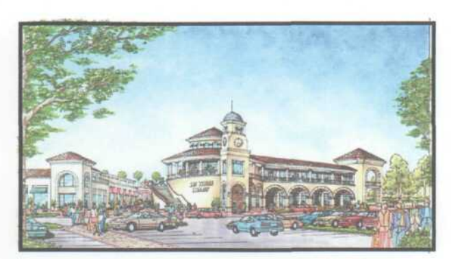
Proposed San Ysidro Library at Las Americas

500 housing units complement the commercial center and transform it into a vital community