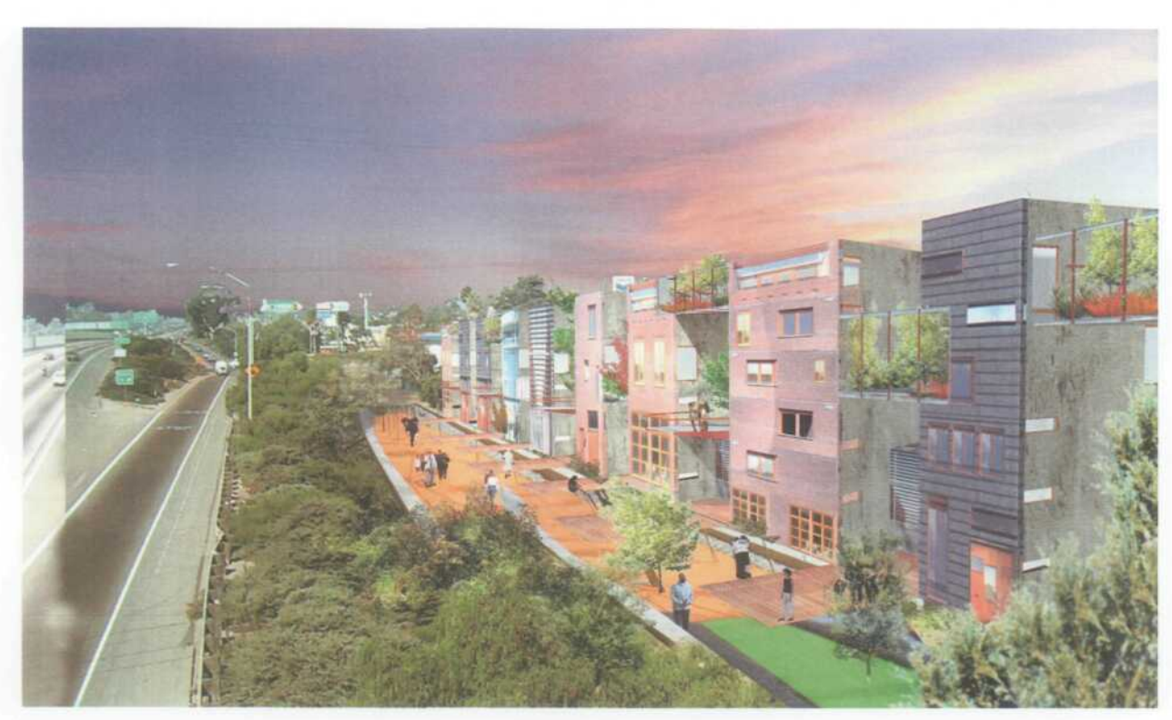
Type "E": Neighborhood Balconies

Set against the freeway, this part of the project extends the small rows of housing alleys creating balconies that hover above a proposed linear park. At this edge, the housing units cascade down "wrapping" two levels of parking below and alternating a rhythm of green balconies against the freeway.