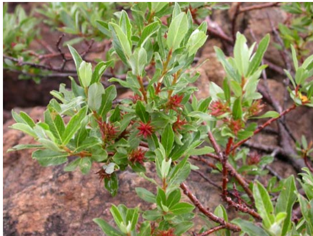
Figure 2. Female green-scaled willow.