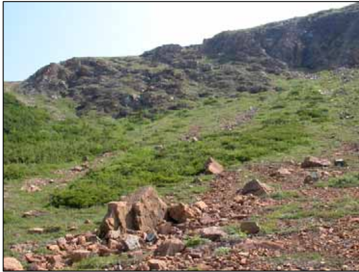
Figure 6. Green-scaled willow habitat in the cirque of Lake Plaqué Malade.

Mountain holly-fern ( Polystichum scopulinum ) and serpentine stitchwort ( Minuartia marcescens ) are two species considered threatened in Quebec ( Act Respecting Threatened or Vulnerable Species ) that sometimes share the same habitat as the green-scaled willow on Mount Albert. A number of species likely to be designated threatened or vulnerable in Quebec (Tardif et al. 2005), such as Aleutian maidenhair ( Adiantum aleuticum ), Indian's dream ( Aspidotis densa ), swamp thistle ( Cirsium muticum var. monticolum ), rough fescue ( Festuca altaica ) and dwarf Arctic groundsel ( Solidago simplex subsp. simplex var. chlorolepis ), also share the habitat of the green-scaled willow.