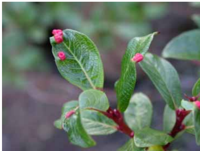
Figure 8. Galls on green-scaled willow.

An unidentified gall (Figure 8) was observed a number of times on the green-scaled willow and short-fruit willow ( Salix brachycarpa ). The galls are irregular and are likely caused by mites or aphids (Goulet, 2005). Its impact on green-scaled willow is unknown, but Sacchi et al. (1988) report that flower bud production is reduced by 43% by comparison with intact stems and that seed production per individual is reduced by between 10% and 50% in the case of Salix lasiolepis .