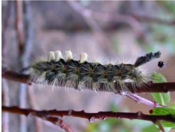
Figure 7. Rusty tussock moth caterpillar on a green-scaled willow.

An unidentified gall (Figure 8) was observed a number of times on the green-scaled willow and short-fruit willow ( Salix brachycarpa ). The galls are irregular and are likely caused by mites or aphids (Goulet, 2005). Its impact on green-scaled willow is unknown, but Sacchi et al. (1988) report that flower bud production is reduced by 43% by comparison with intact stems and that seed production per individual is reduced by between 10% and 50% in the case of Salix lasiolepis .