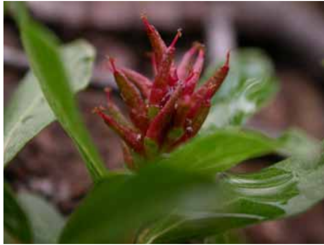
Figure 3. Fruit of the green-scaled willow.

The green colour of the bract, which had been believed to be one of the two distinctive traits of the green-scaled willow, along with hairless capsules (Fernald, 1905, 1950), is instead correlated with the ontogenetic development stage and is not limited to this species. A comparative analysis of the short-fruit willow ( Salix brachycarpa ) and the green-scaled willow shows a striking correlation between flower development and the colour of the bracts (Argus, 1965). The catkins have primarily green bracts at anthesis (time when flowers open and pollen is shed) and yellow to buff bracts after anthesis. There is a continuous sequence of intermediate colours if the ontogenetic processes and the various differences between individuals are taken into account. The high frequency of green bracts during flowering of the short-fruit willow calls into question the validity of the use of bract colour to differentiate the green-scaled willow (Argus, 1965).