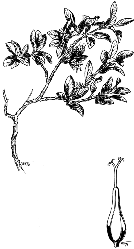
Figure 1. Illustration of the green-scaled willow (drawing by Réjean Roy): growth form (X0.75) and single pistil (X10).