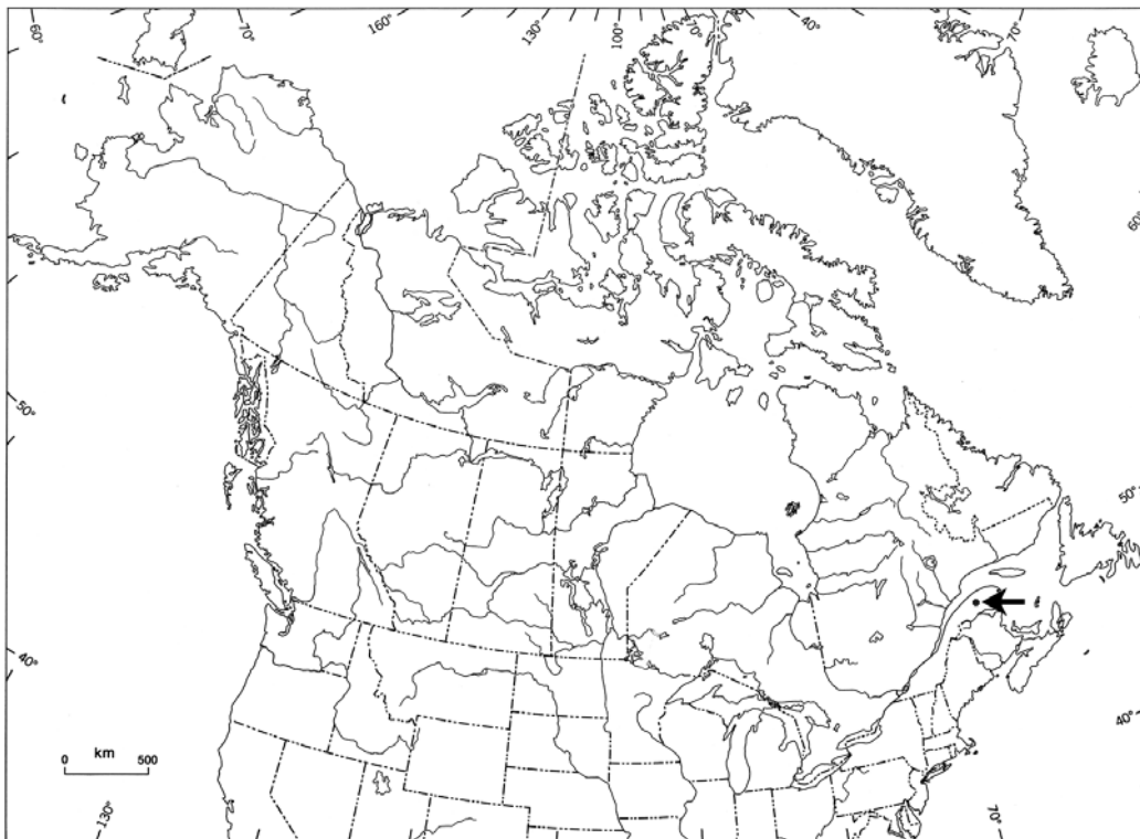
Figure 4. Global distribution of the green-scaled willow.

Green-scaled willow occurs exclusively on the alpine-type serpentine outcrops of Gaspésie Provincial Park, Quebec (Figure 4). It has been inventoried to date on the sides of 10 glacial cirques of Mount Albert representing, perhaps, only 4 or 5 distinct localities. This species has not been found in any other serpentine areas of North America. Given its very limited distribution, the green-scaled willow is considered endemic to the Gaspé region of eastern Canada (Labrecque and Lavoie, 2002).