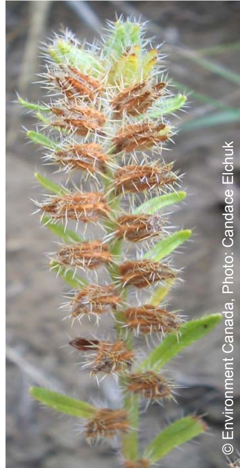
Figure 2. Photo of mature tiny cryptanthe, showing the brown calices.

Tiny cryptanthe is native to North America. In Canada, its known locations are 28 populations 1 in Alberta and four populations in Saskatchewan (Alberta Sustainable Resource Development 2004; C. Bradley pers. comm.; C. Elchuk pers. obs.; D. Nernberg pers. obs.) (Figure 3, Table 1). Tiny cryptanthe is associated with river systems, mainly the South Saskatchewan River valley in the eastern half of Alberta and near the western border of Saskatchewan. Tiny cryptanthe has also been found in the vicinity of the lower Bow and upper Oldman rivers in Alberta and the Red Deer River in Saskatchewan. The nearest location in the United States is in Montana, 450 km from the southernmost Alberta location (Alberta Sustainable Resource Development 2004). The number of populations in the United States is not documented; it is not known what percentage of the species' global distribution and abundance is currently found in Canada, although it is undoubtedly small (Figure 4). There are insufficient historical and long-term data collected for this species to allow a rate of population decline to be determined.