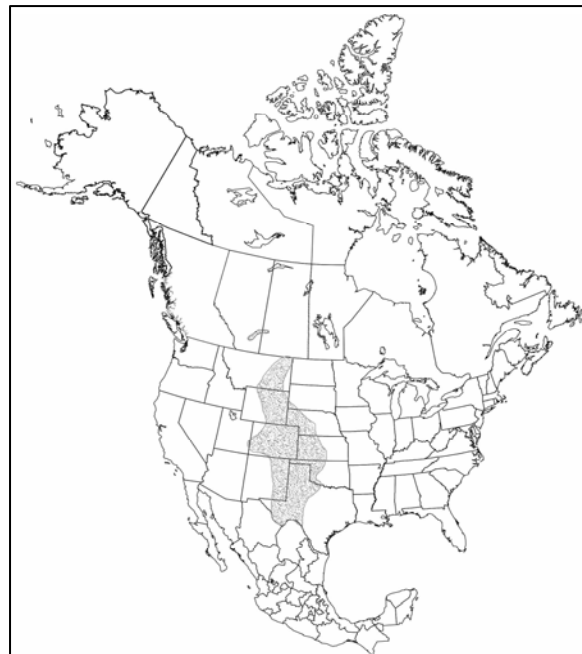
Figure 4. Known range of tiny cryptanthe in North America (adapted from Alberta Sustainable Resource Development 2004).

Globally, tiny cryptanthe is ranked as demonstrably secure under present conditions (G5) (NatureServe 2004).