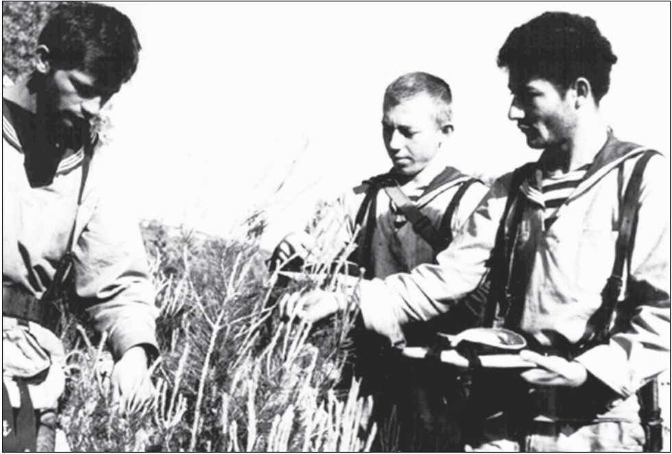
Fig. 3. Sailors collecting Pinus halepensis shoots for tea in the “Shipwreck and Survival I” expedition in Kornat islands in 1969