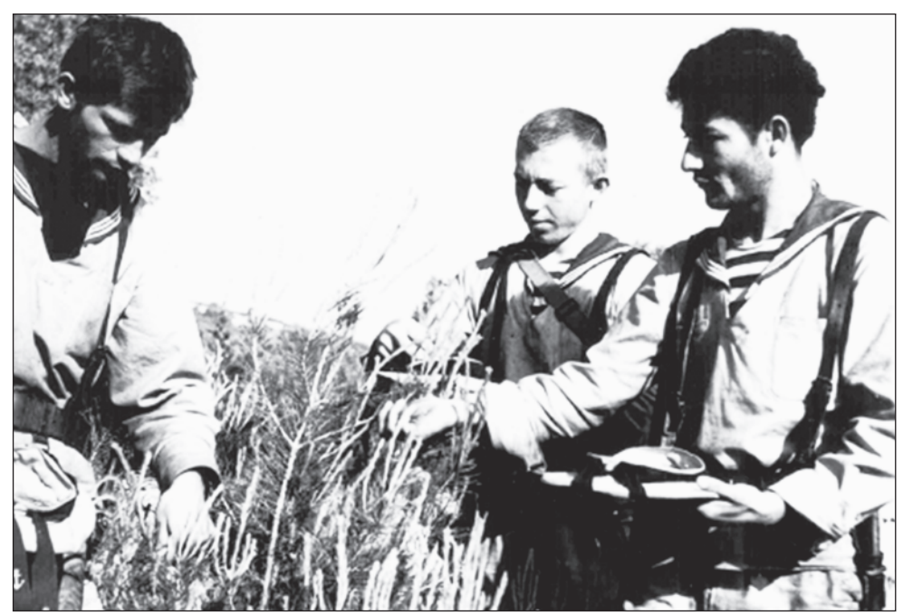
Fig. 3. Sailors collecting Pinus halepensis shoots for tea in the "Shipwreck and Survival I" expedition in Kornat islands in 1969