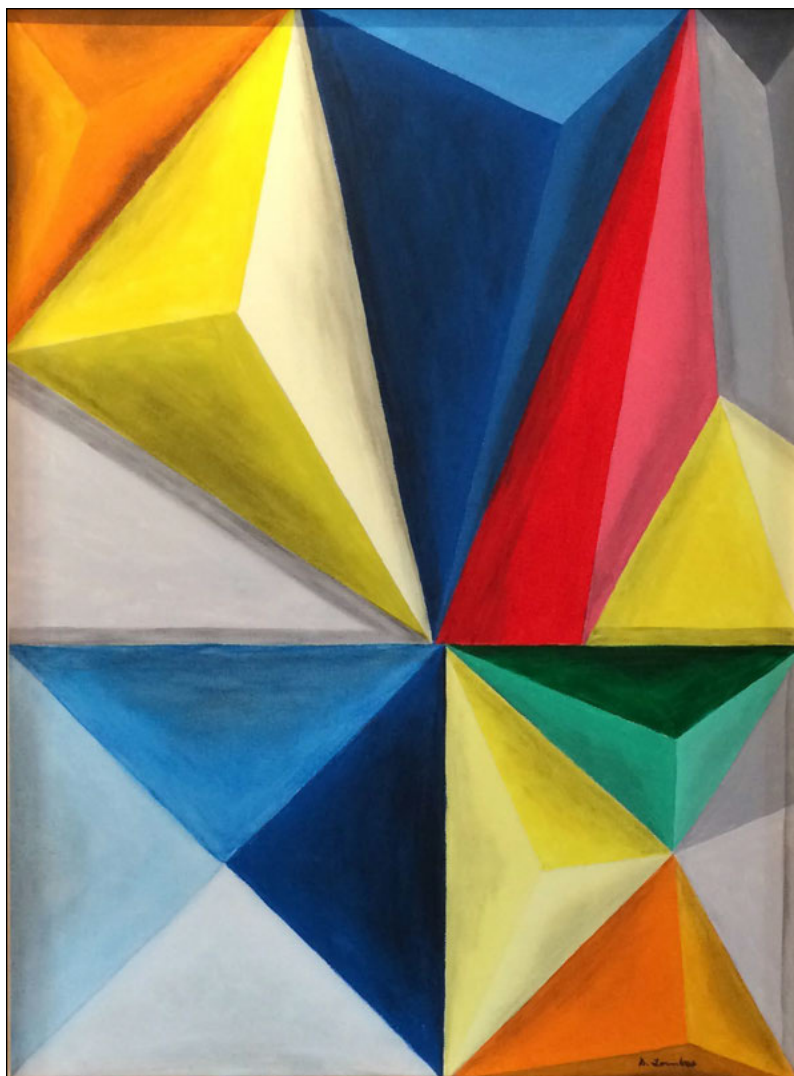
Twelve Pyramids No. 2 , by Dean G. Loumbas (see page 3)