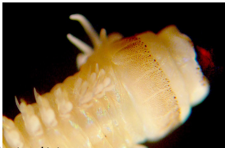
Nereis eakini Anterior ventrum showing paragnaths. 8-19-02