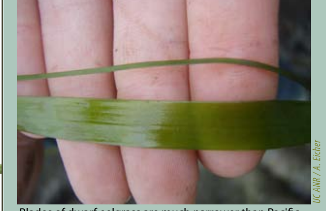
Blades of dwarf eelgrass are much narrower than Pacific eelgrass.