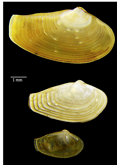
Fig. 1 - Nuculana leonina Cascadia Slope Sta. EBS-64, 5JUL195, 950 m