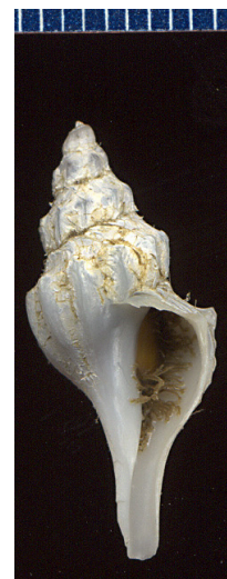
Fig. 4 - Boreotrophon avalonensis from CSD Sta. DB5, 10/17/05 318m. Scale in millimeters.

Lastly Wendy Enright shared some specimens she had brought for review. From B'08 station 7111, at 517m, was a Lirobittium sp. She was hoping for a species level ID but none was forthcoming from the members present. Next were numerous specimens of Modiolus from B'08 station 7527 at 42m. After review it was determined that all were juvenile Modiolus sacculifer . And finally a small specimen of Calliostoma also from B'08 station 7527. Due to its small size it was decided it should be left at Calliostoma sp, juvenile.