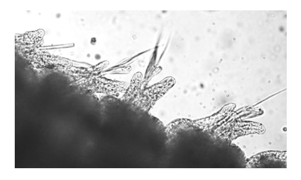
Figure 1. Anterior segments.