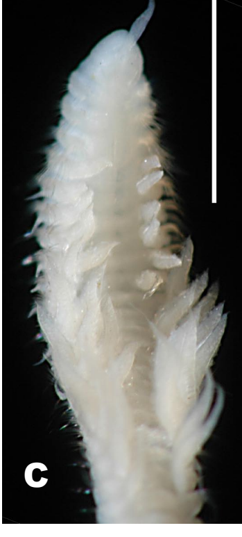
Fig 1 A. Prostomium dorsal view, B. modified postbranchial neurosetae C. Anterior dorsum Scale bar = 1 mm (Specimen from DB14)