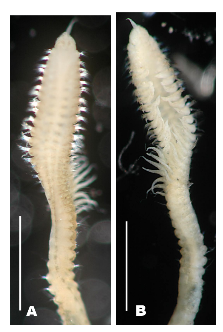
Fig. 2 A. Anterior ventrum, B. Anterior dorsum (Specimen from DS1)