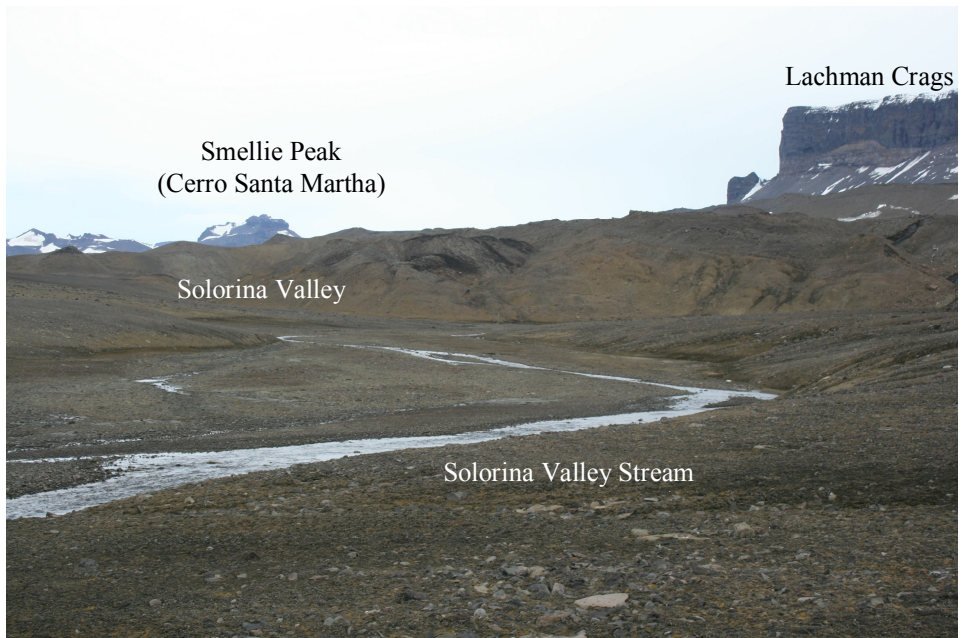
Fig. 2. General view on the Solorina Valley taken in austral summer season (February 15 th , 2017). Patchy distribution of vegetation is seen on the stream banks.