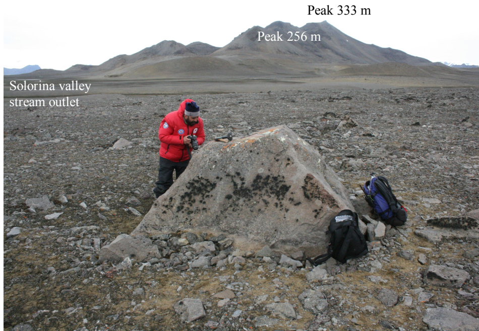
Fig. 3. Collection and documentation of lichen species close to the stream mouth (150 m from the sea shore line).

The land surface is generally covered by a debris layer of gravelsand large clasts that are mixed with loose sandy regolith, mostly derived from James Ross Volcanic Group basalts, which were deposited as debris flows. Soil microbiota is dominated by bacterial taxa such as Actinobacteria, Proteobacteria, Acidobacteria (Meier et al. 2018). The Solorina valley is rich in seep-