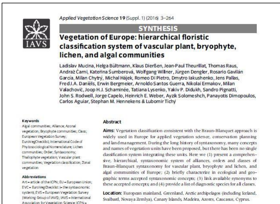
Figure 2.1. EuroVegChecklist was published in 2016 as an extra issue of Applied Vegetation Science, a journal of the International Association for Vegetation Science (IAVS).