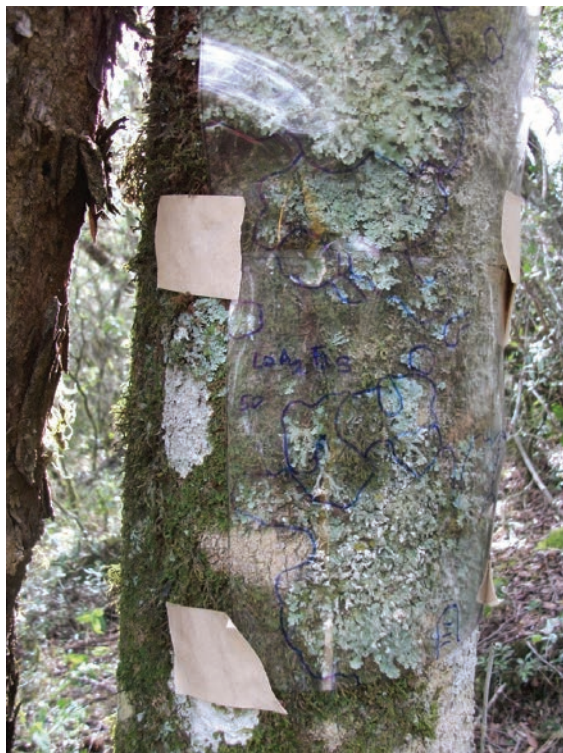
Figure 2. Acetate method used for the lichen mapping in stands of riparian forest.

Método del acetato utilizado para el mapa de los líquenes de los sitios del bosque ribereño.