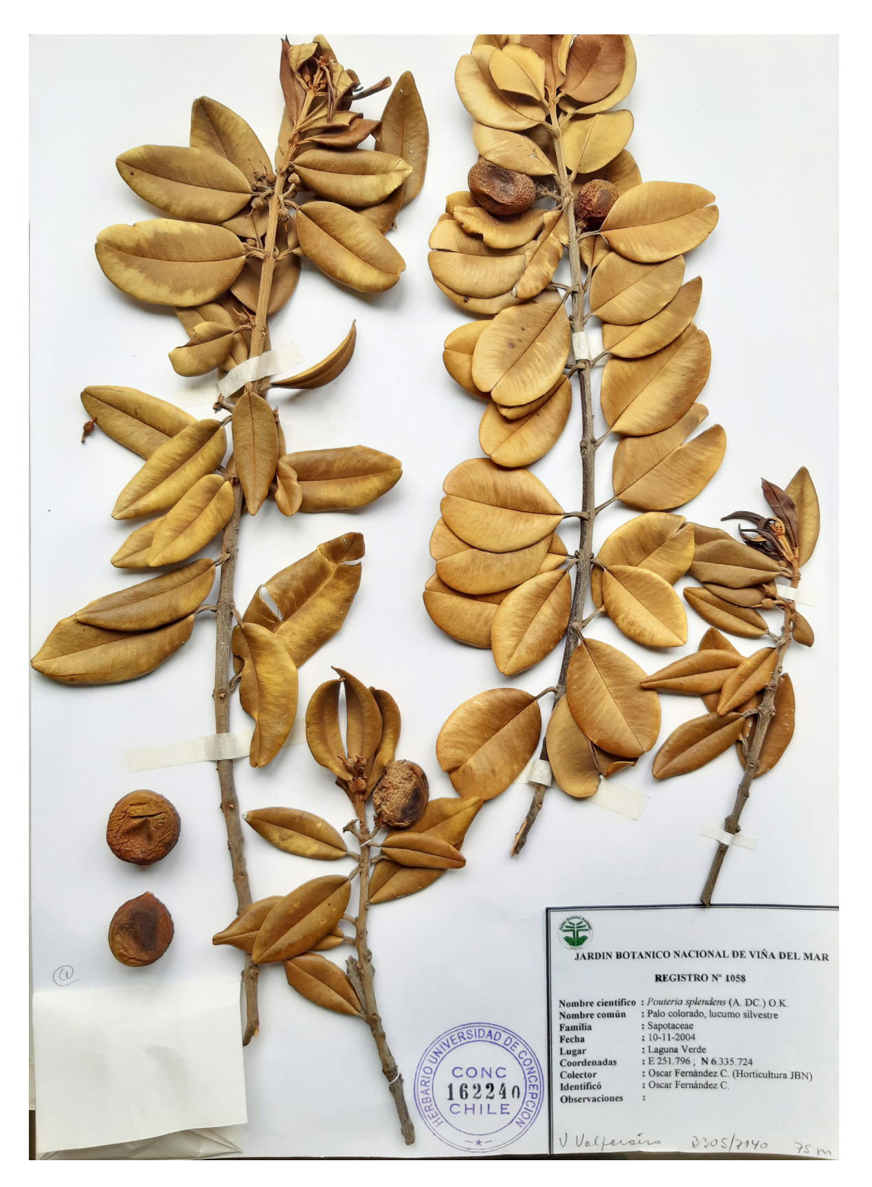
FIGURE 2. Neotype of Lucuma valparadiseaa (≡ Gayella valparadisaea), O. Fernandez C. s.n. (CONC No. 162240). / Neotipo de Lucuma valparadisaea (≡ Gayella valparadisaea), O. Fernandez C. s.n. (CONC No. 162240).