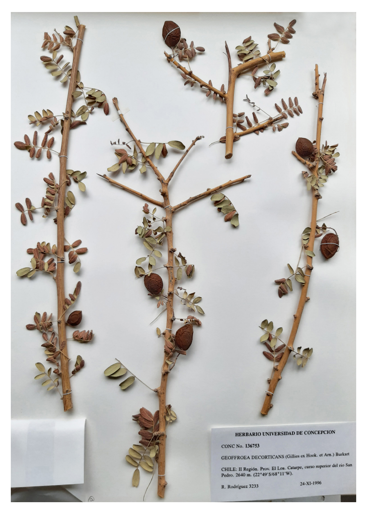
FIGURE 4. Neotype of Lucuma spinosa (= Geoffroea decorticans), R. Rodríguez 3233 (CONC no. 136753). / Neotipo de Lucuma spinosa (= Geoffroea decorticans), R. Rodríguez 3233 (CONC no. 136753).