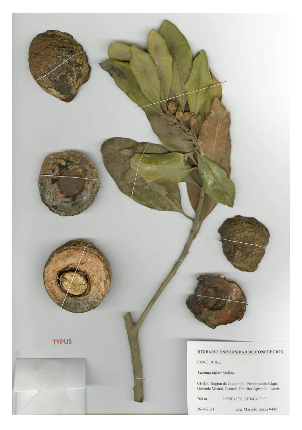
FIGURE 1. Neotype of Lucuma bifera, M. Rosas 9449 (CONC no. 191032). / Neotipo de Lucuma bifera, M. Rosas 9449 (CONC no. 191032).