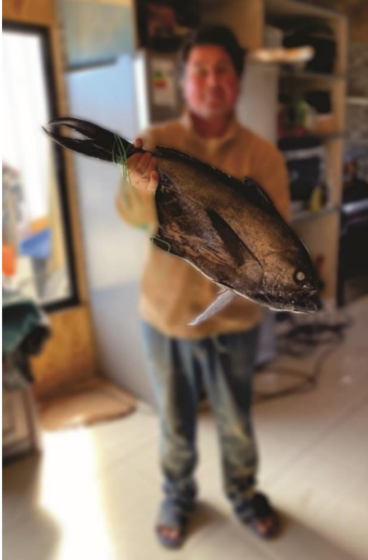
Figure 2. Specimen of Taractes asper .