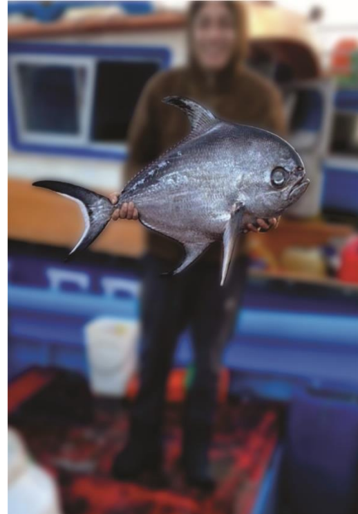
Figure 1. Specimen of Taractichthys steindachneri .

Characters: body oval, compressed. The dorsal profile of the head arched, rounded, and covered with scales, the snout is short, shorter than the eye diameter, interorbital space rounded, the mouth is oblique, the lower jaw projecting, the upper jaw is moderately thin, scaly, and reaches vertically to the middle of the pupil, preopercle and opercle covered by scales, dorsal and anal fin falcate anteriorly, their lobes much elongate, reaching to or beyond one-third of fin-length when depressed, pectoral fin long reaching about the middle of anal fin, caudal fin lunate. Silvery blue, darker on dorsum, paler on belly, caudal fin with an abruptly white posterior border. Selected morphometrics in the percentage of standard length (SL): head length 28.6-