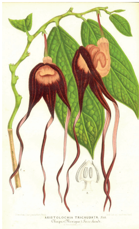
Figure 2. Illustration of A. tricaudata from Lemaire (1867).

Shrub up to 3-4 m high; branches zigzag with slightly swollen nodes; leaves simple, alternate, petiole 1-2 cm long, tomentulose; lamina 10-23 cm long, 5-12 cm wide,