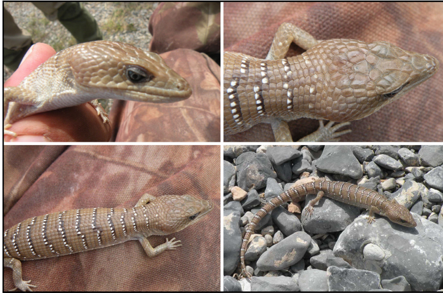
Figure 1. Specimen of Gerrhonotus lugoi from Nuevo León, Mexico.

vs. 14), longitudinal ventral scale rows (14 vs. 12), suboculars (3 vs. 2), and primary temporals (5 vs. 4) (Bryson & Graham, 2010; McCoy, 1970).