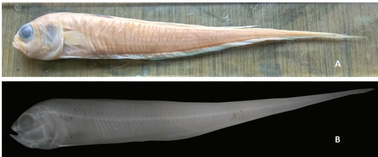
Fig. 1. (A) Preserved specimen and (B) x-ray Radiograph of A. indica from Northern Bay of Bengal, West Bengal, India (CIFE/KOL/MW/F0232; TL = 236,83mm)

Remarks: The genus Acanthocepola is known to have about 4 species worldwide (Froese & Pauly, 2017). The majority of these species have uniform body coloration, while others have distinct dark bands or spots. A. indica has a close resemblance with Acanthocepola limbata by